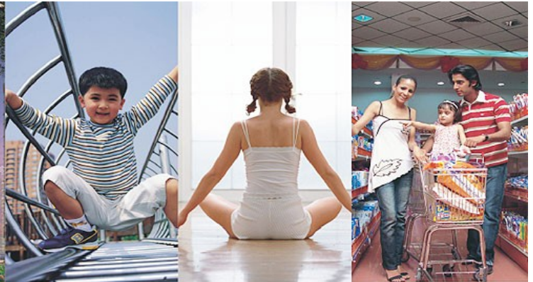
The Elements of Fun

A freedom for the mind from the stresses of the day, the exquisite facilities unknots the senses & provides hours of diverse leisure activities for everyone. Suncity Heights is the answer to the needs of leisure.