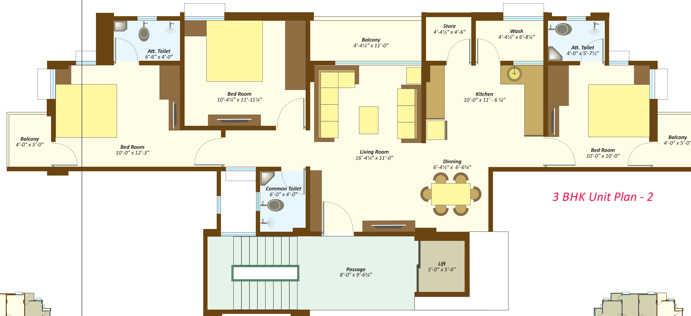
3 BHK Unit Plan - 2