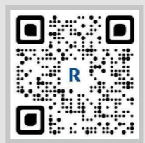
Scan For Location

Site Address : Raghuvir Steffon B/s. Raghuvir Silverstone, Vip Main Road, Vesu, Surat.