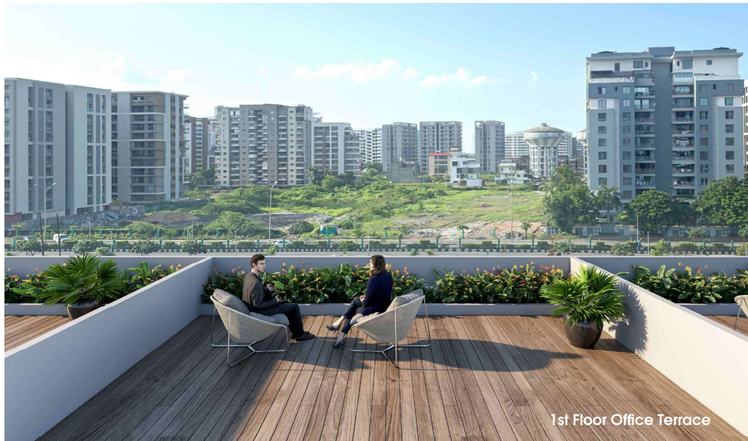
1st Floor Office Terrace