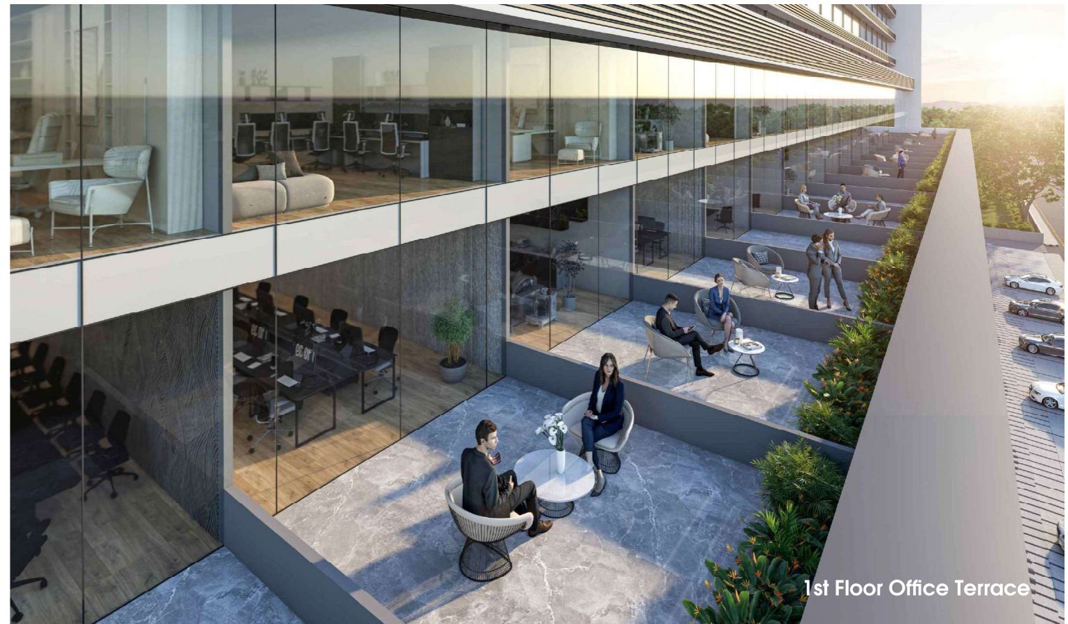
1st Floor Office Terrace