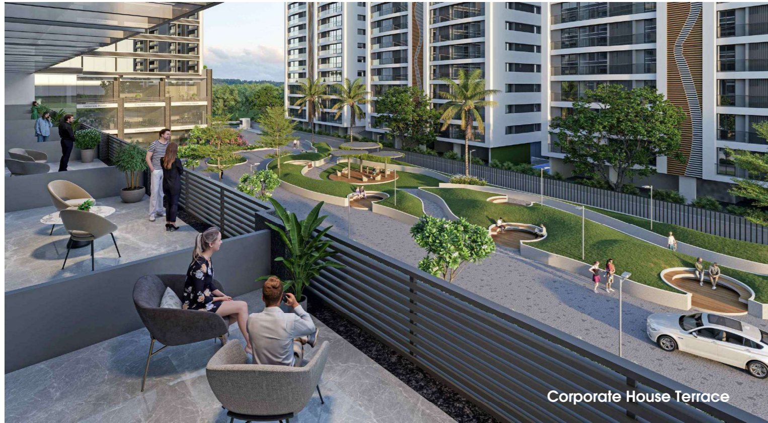
Corporate House Terrace