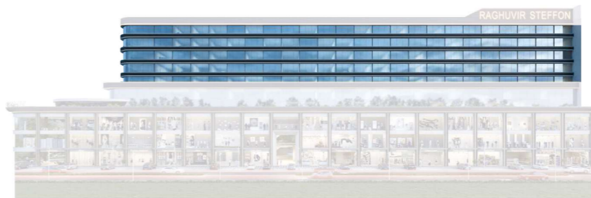
THIRD TO SEVENTH FLOOR

NOTE: *ON 4TH FLOOR SERIES NO 20 IS OFFICE NO 422A *ON 4TH FLOOR SERIES NO 22 IS OFFICE NO 422B