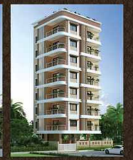
Dream Height Sharda Chowk, Jafar Nagar, Nagpur.