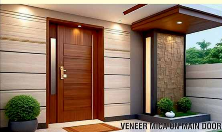
VENEER MICA ON MAIN DOOR