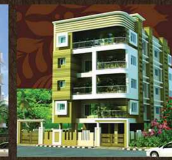
Dream Galaxy Jaripatka, Nagpur.