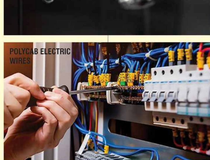
POLY CAB ELECTRIC WIRES