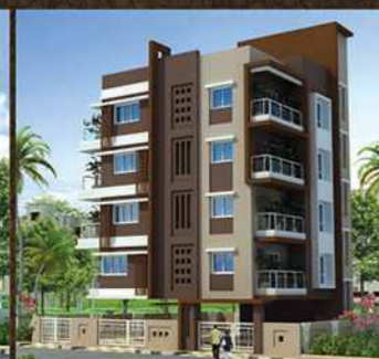
Dream Mansion Sadiqabad Colony, Nagpur.