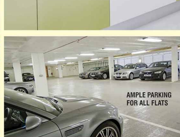
AMPLE PARKING FOR ALL FLATS