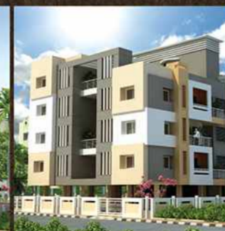
Dream Elite Gokul Housing Society, Nagpur.