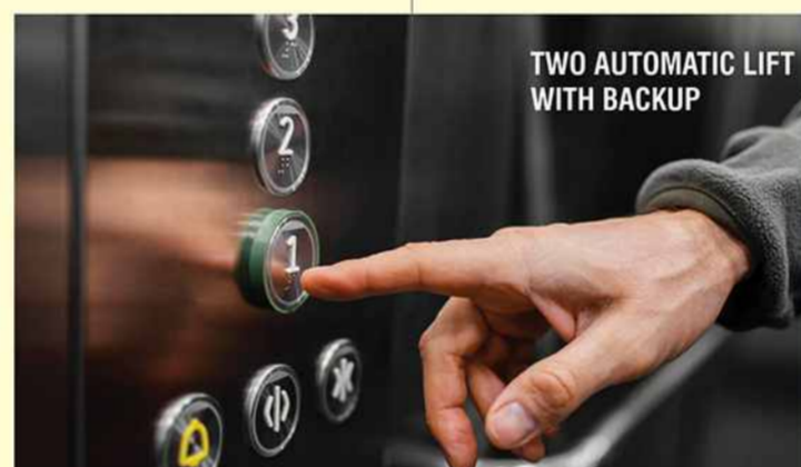
TWO AUTOMATIC LIFT WITH BACKUP