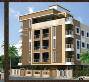
Dream Serene Awasthi Nagar, Nagpur.