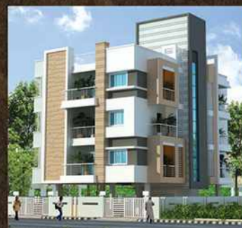
Dream Palacia Bhupesh Nagar, Nagpur.