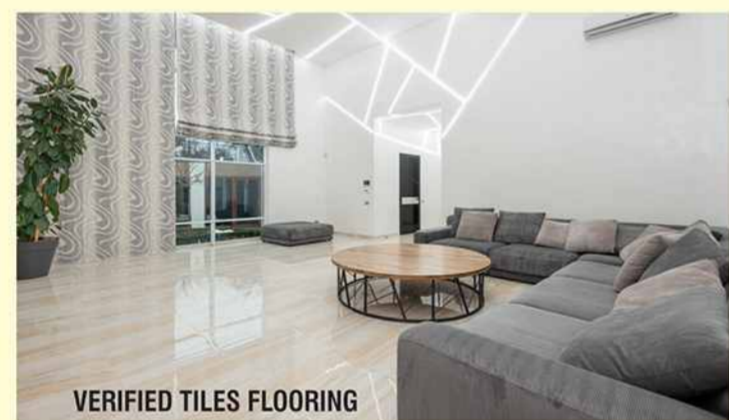
VERIFIED TILES FLOORING