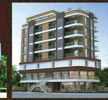
Dream Arcade Awasthi Chowk, Nagpur.