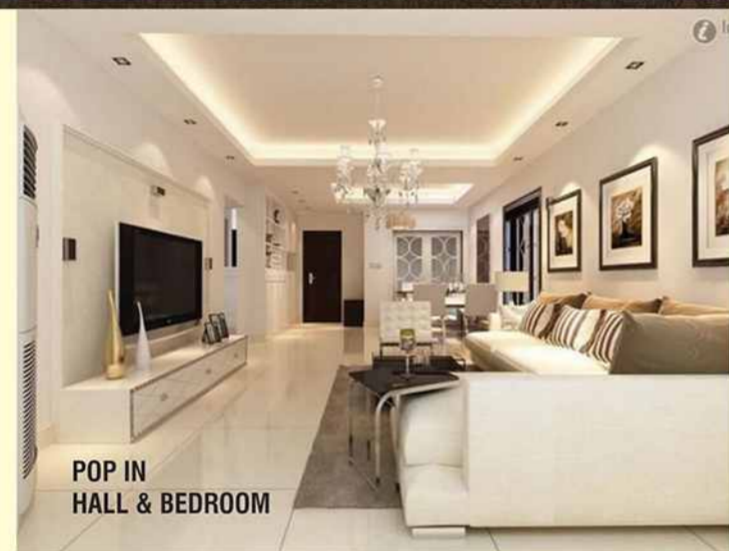
POP IN HALL & BEDROOM