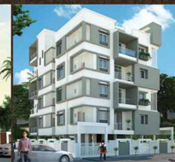
Dream Royal RMS Colony, Nagpur.