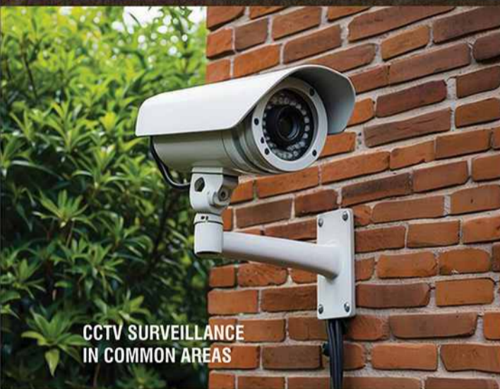
CCTV SURVEILLANCE IN COMMON AREAS

DREAM PARADISE 2 BHK Luxurious Apartment