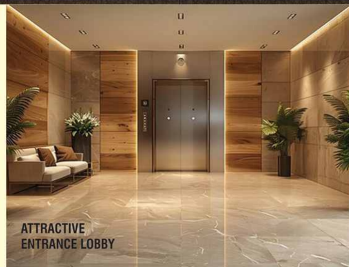
ATTRACTIVE ENTRANCE LOBBY