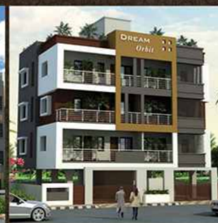
Dream Orbit Godhani Main Road, Nagpur.