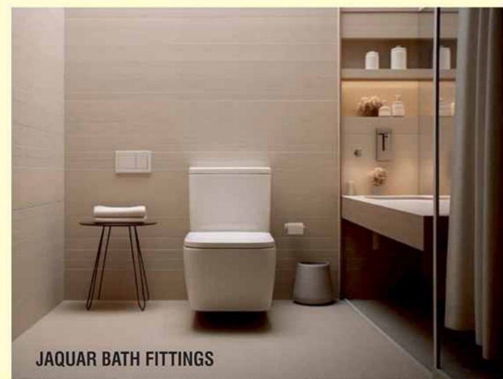
JAQUAR BATH FITTINGS