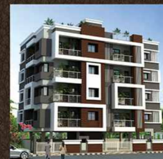
Dream Classic Manish Nagar, Nagpur.