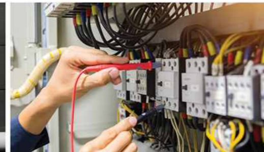
POLY CAB ELECTRIC WIRES