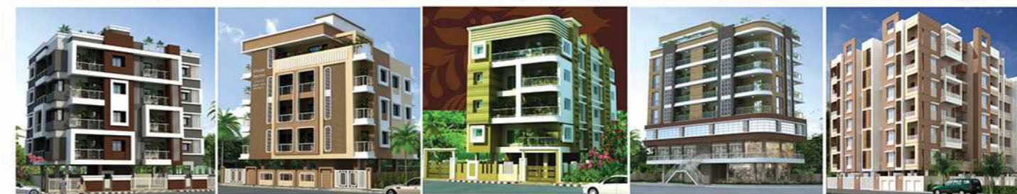
Dream Classic Manish Nagar, Nagpur. Dream Serene Awasthi Nagar, Nagpur. Dream Galaxy Jaripatka, Nagpur. Dream Arcade Awasthi Chowk, Nagpur. Dream Paradise Behind shyam Lawn, Nagpur.