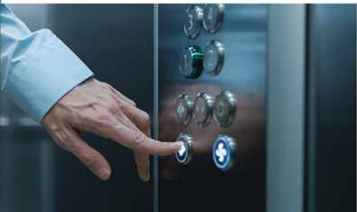
AUTOMATIC LIFT WITH BACKUP