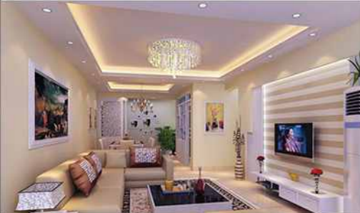
POP IN HALL & BEDROOM