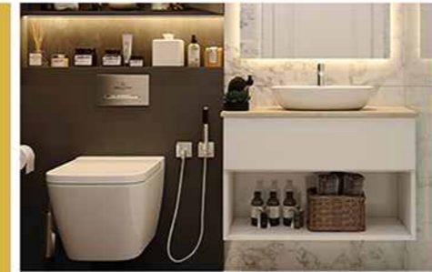
JAQUAR BATH FITTINGS