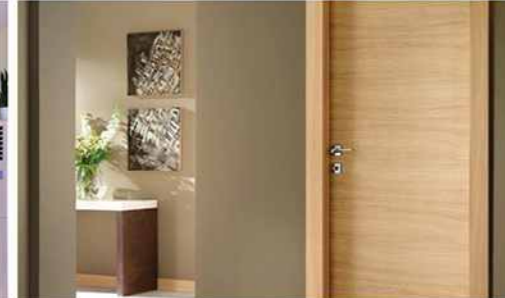
VENEER MICA ON MAIN DOOR