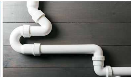
INTERNAL PLUMBING PIPES OF CK BIRLA GROUP