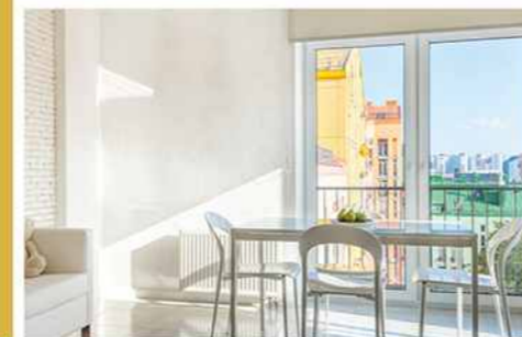
VENTILATION FOR NATURAL LIGHT & AIR