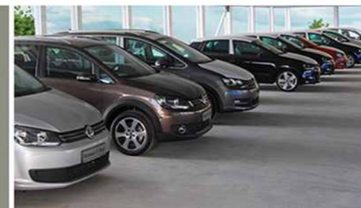
AMPLE PARKING FOR ALL FLATS