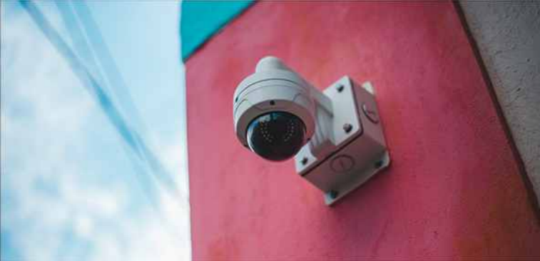
CCTV SURVEILLANCE IN COMMON AREAS