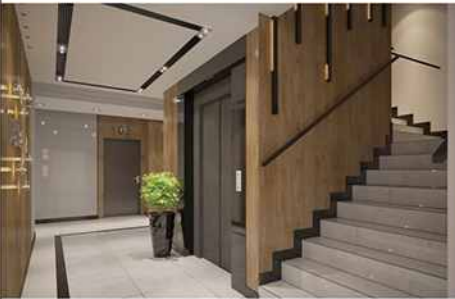
ATTRACTIVE ENTRANCE LOBBY