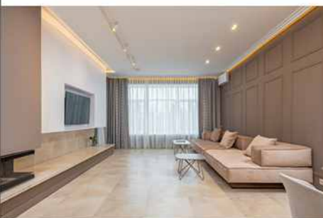
VERIFIED TILES FLOORING