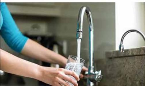
24 X 7 WATER SUPPLY