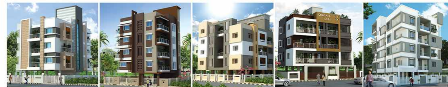
Dream Palacia Bhupesh Nagar, Nagpur. Dream Mansion Sadiqabad Colony, Nagpur. Dream Elite Gokul Housing Society, Nagpur. Dream Orbit Godhani Main Road, Nagpur. Dream Royal RMS Colony, Nagpur.