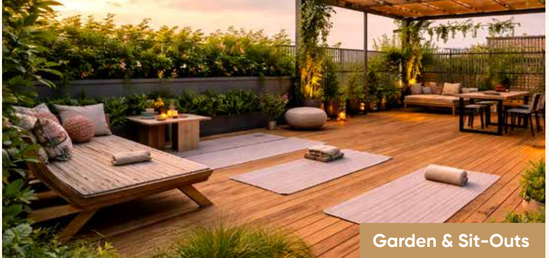
Garden & Sit-Outs