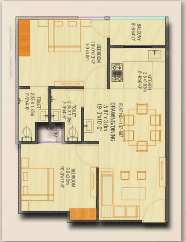
2BHK 984 SQFT PERSPECTIVE