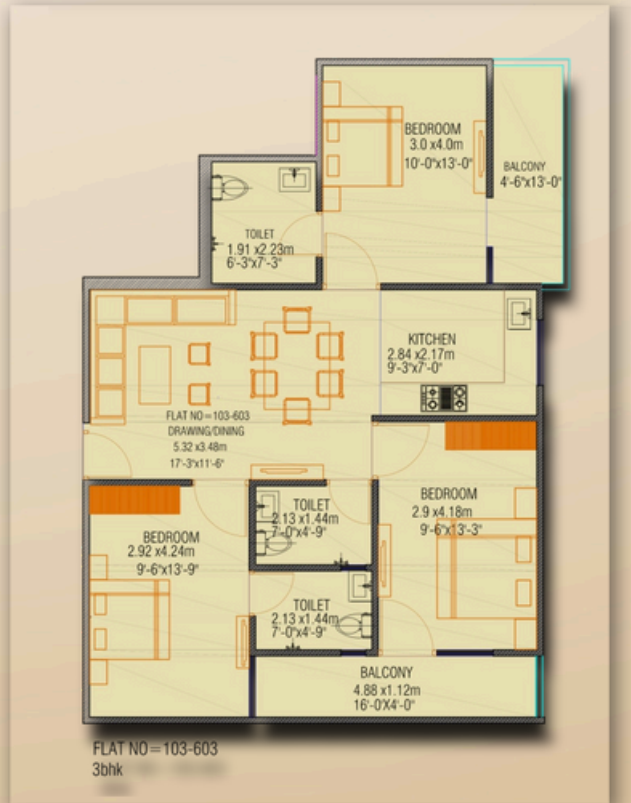
3BHK 1430 SQFT PERSPECTIVE