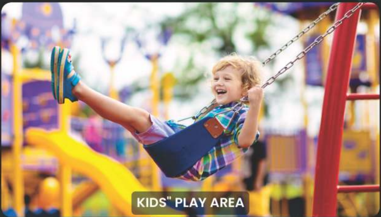
KIDS" PLAY AREA