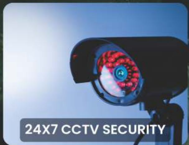
24X7 CCTV SECURITY