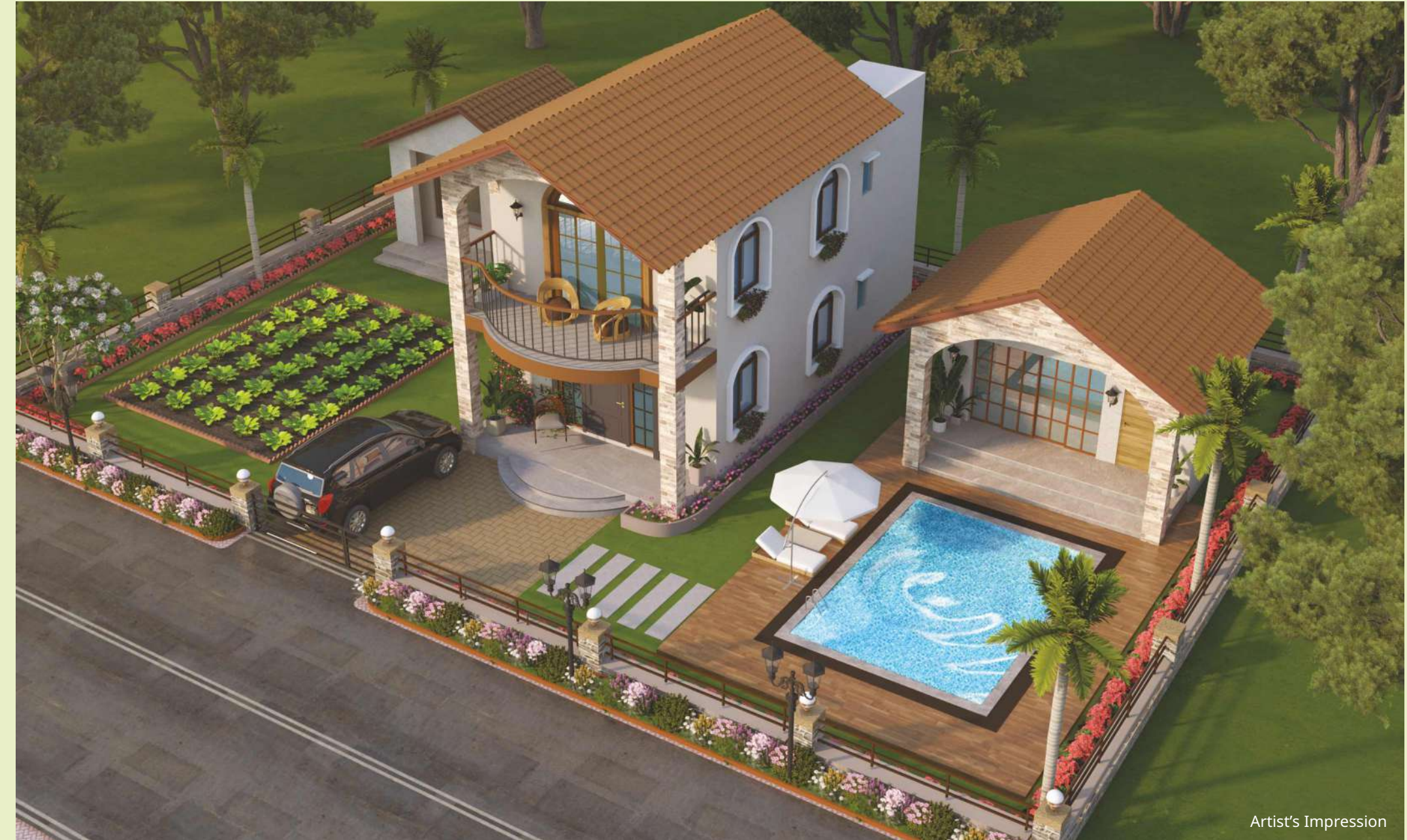
Premium 2 BHK Villa with option of private swimming pool, Organic farming & Office/Guest room