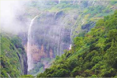
Tamhini Ghat Waterfalls : 38 km