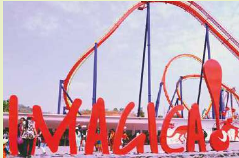
Imagica : 23 km