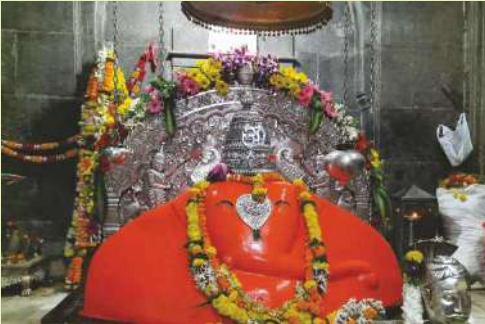
Ashtavinayak Ganpati Pali : 07 km