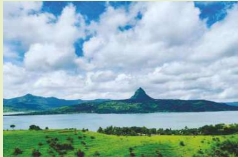
Pawana : 78 km

Joy Villa is centrally located between Mumbai and Pune, making it strategically positioned for easy access via the Mumbai-Pune Express Highway or the Mumbai-Goa Highway. This prime location offers practicality and serves as a convenient getaway from both major metro cities.