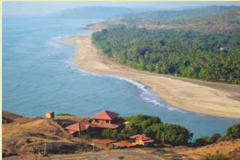
Alibaug : 60 km