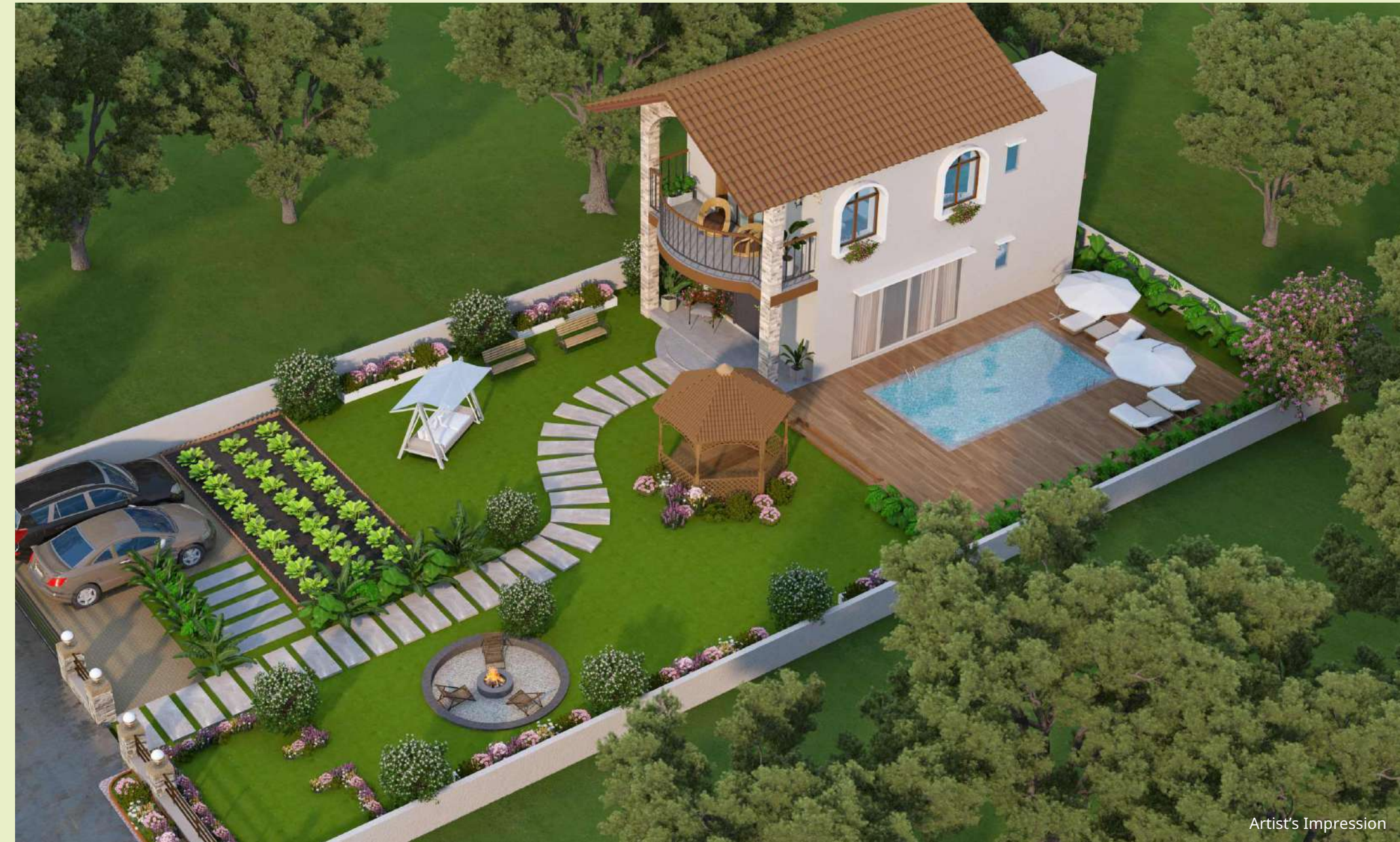
Premium 2 BHK Villa with option of private swimming pool, Organic farming & Garden