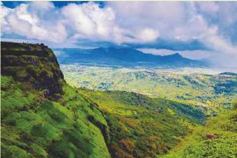
Lonavala : 50 km