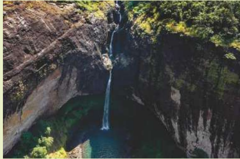
Devkund Waterfall : 34 km