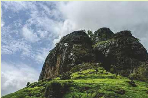
Sarasgad Fort : 7 km