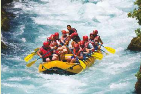
Kolad River Rafting : 31 km