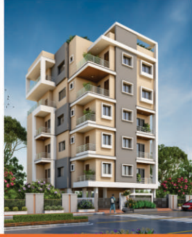
Vaishnavi Enclave (Shaktimata Nagar)