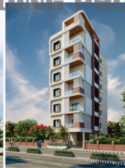
Vaishnavi Imperial-II (Kharbi Road)