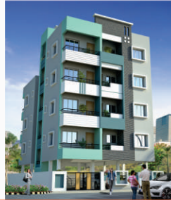
Shree Ganesh Enclave (Omkar Nagar)