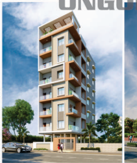
Vaishnavi Infinity (Jayprakash Nagar)