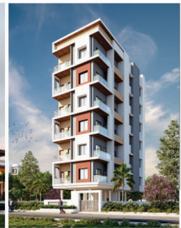
Vaishnavi Delight-2 (New Subhedar Layout)