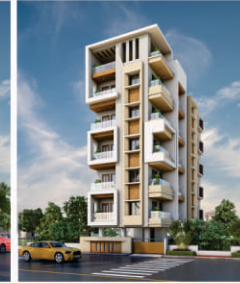
Vaishnavi Delight (Rukmini Nagar)