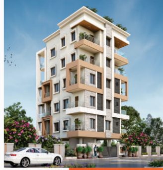
Vaishnavi Paradise (Dev Nagar)