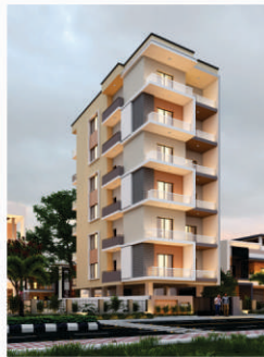
Vaishnavi Imperial (Sankalp Nagar)