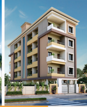
Vaishnavi Enclave (Murli Nandan Nagar)