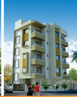
Sai Apartment (Dhangawdi Nagar)