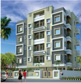
Vaishnavi Residency (Ashirwad Nagar)