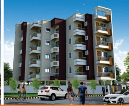
Vaishnavi Heights (Sonagaon Lake)