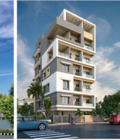
Vaishnavi Tower (Shree Hari Nagar)