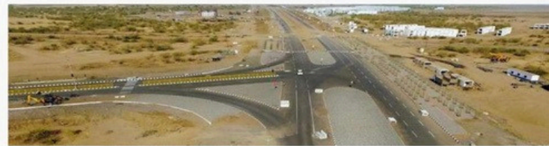
UPCOMING BIGGEST TOURIST HUB