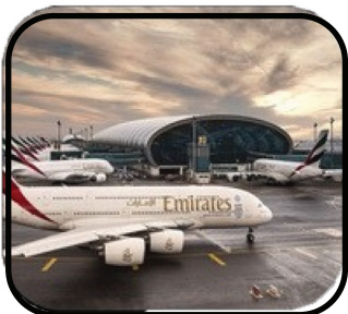
DHOLERA INTERNATIONAL AIRPORT