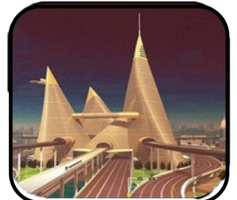
GUJARAT TRADE CENTER (GTC)