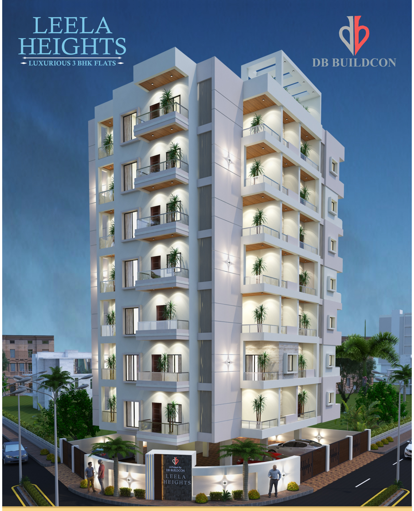
Site Add.: Plot No. 94, Near Ram Mandir, Vivekanand Nagar, Khamla Road, Nagpur.