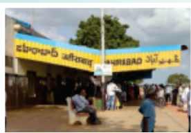
Zaheerabad Rly Station