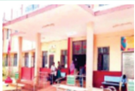
Zaheerabad Govt. Hospital