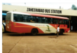
Zaheerabad Bus Station