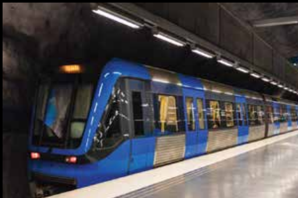
Underground railway line connecting CST-Thane - 21 mins travel time