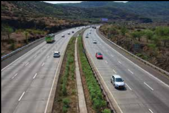
High-speed Thane road- 6 lane road from Mulund to Gaimukh, Thane will be reducing travel time to 10 mins