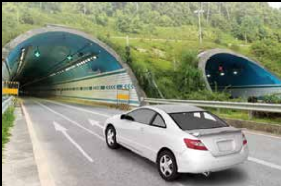
Borivali Thane twin tunnel a travel time reduced to 15 mins