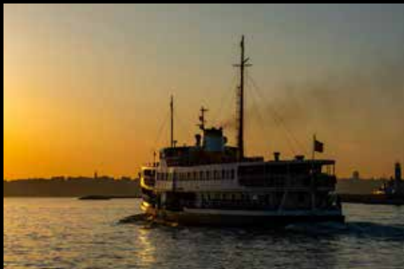
Kolshet-South Mumbai-Vasai waterway - first Intracity water service