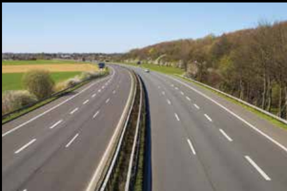
Central park road linking Kolshet & Bhiwandi - will cover 17 kms in 10 mins