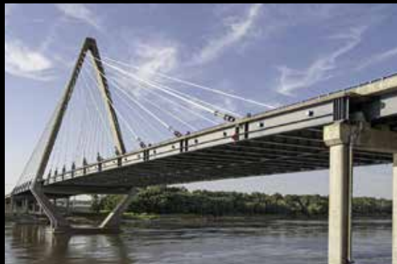
2 new bridges over Thane Creek speeding up Mumbai-Nashik travel