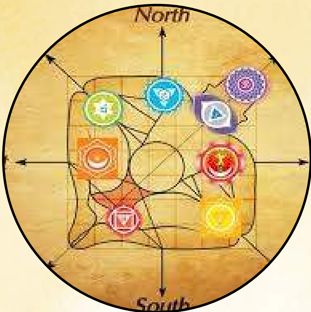
Vaastu Compliant Flats