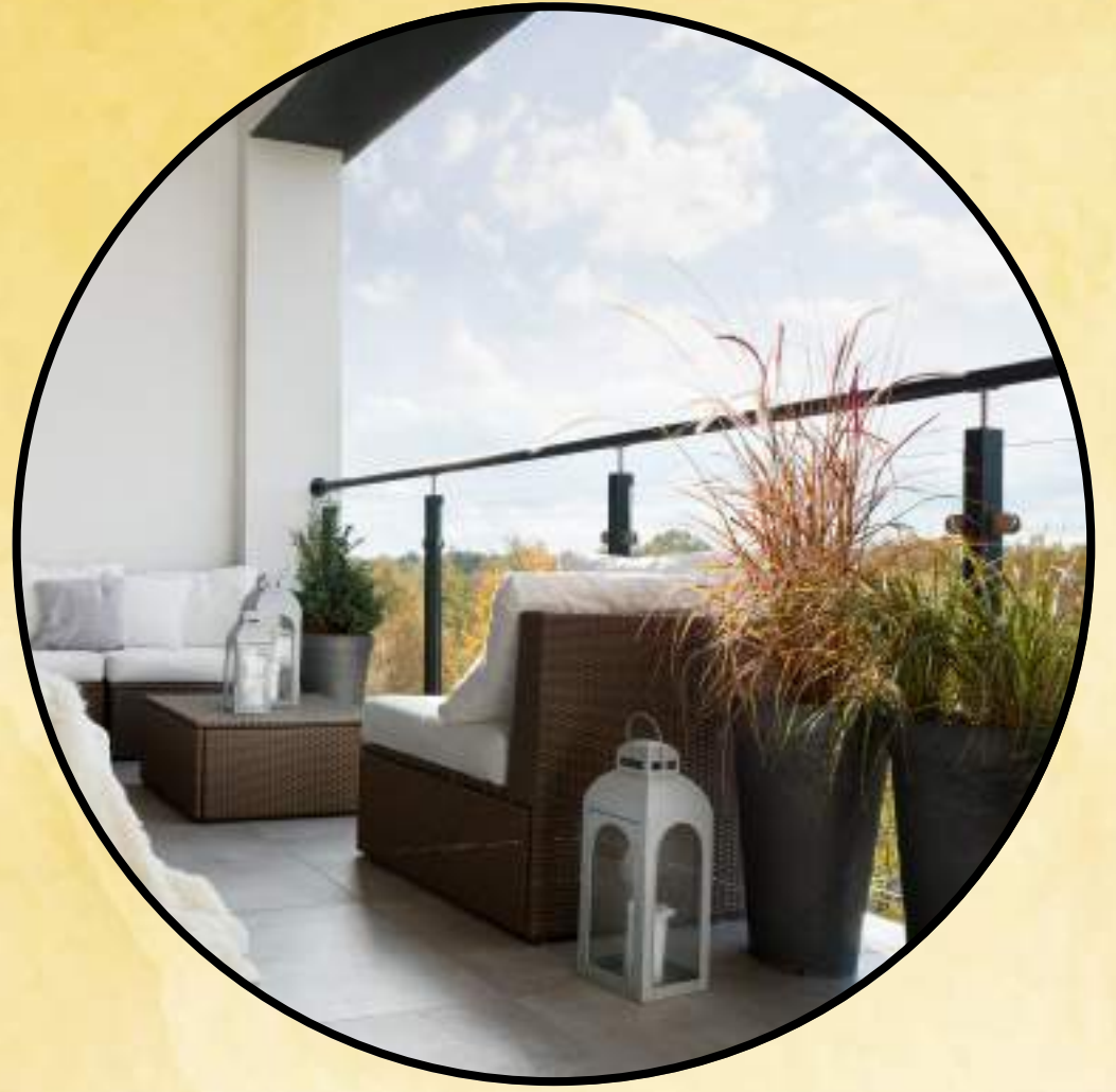
Balcony for each Room