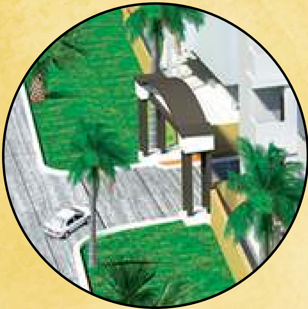
Grand Entrance Gate