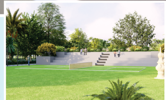
Badminton Court with Seating Space