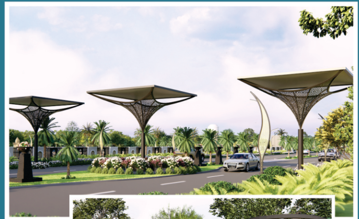
Road Side Best Architect