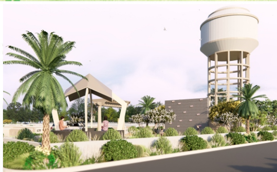
Overhead Water Tank