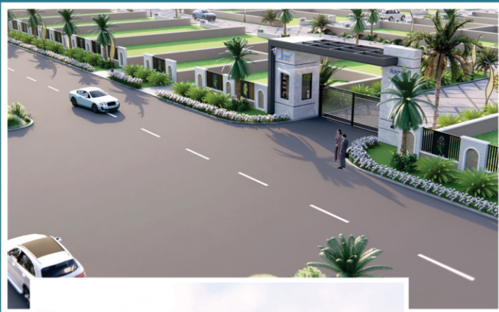
Wide Damar Road