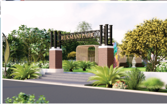
Wide Park Entry Gate