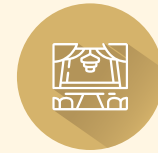
Multi-purpose Hall/ Banquet