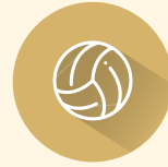
Outdoor Sports Facilities