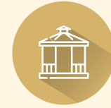
Water Bodies & Gazebo