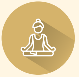
Yoga & Meditation Corner