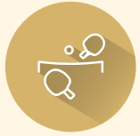
Indoor Sports / Games Facilities