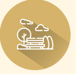
Seating & Relaxing Pavilions