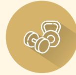
Fully Equipped Gym