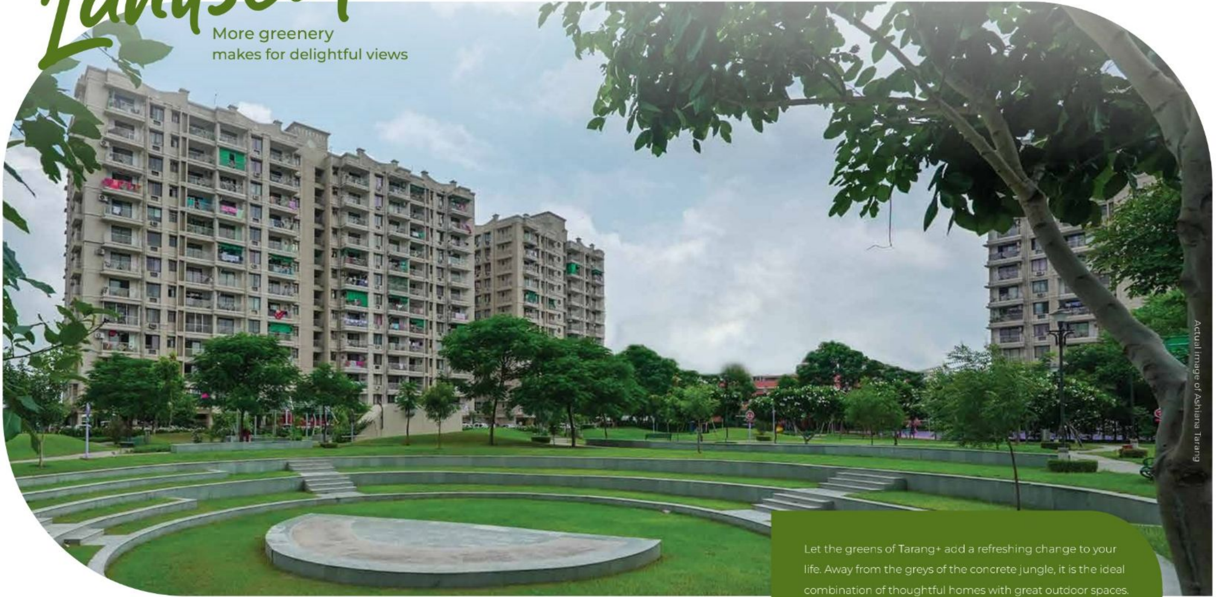
Actual Image of Ashiana Tarang

More greenery makes for delightful views