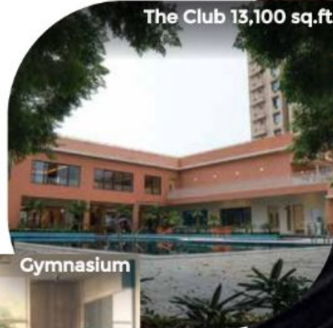
The Club 13,100 sq.ft.

The 13,100 sq.ft. clubhouse gives you more space to add the 'more' to your life. More fun, more comfort, more friends, more conversations, more enjoyment, and more experiences.