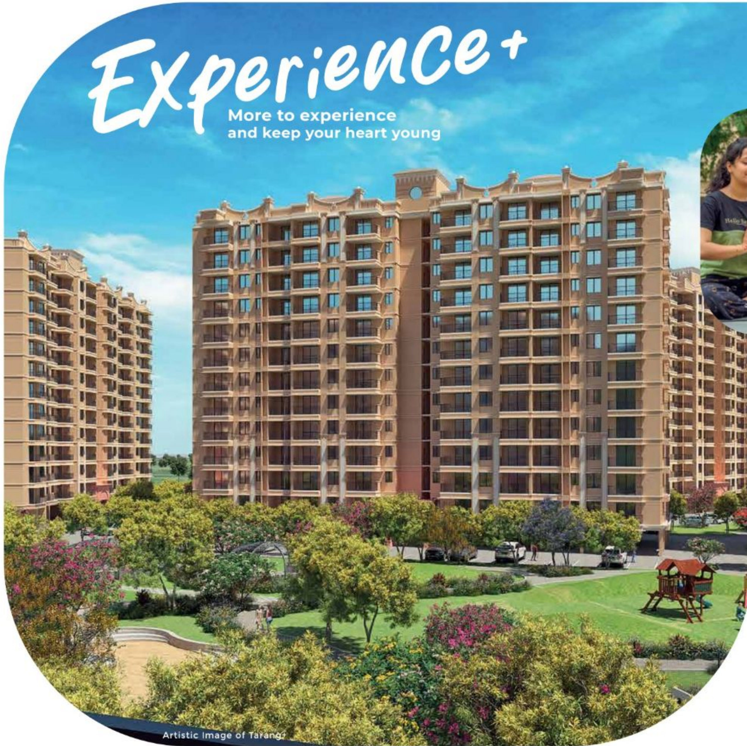
Artistic Image of Tarang

More to experience and keep your heart young