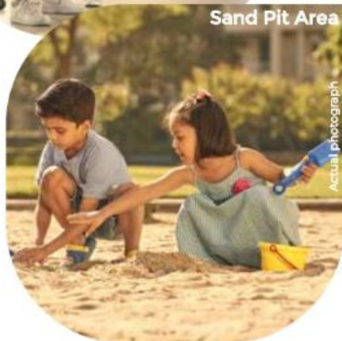
Sand Pit Area

Flex your muscles, and sweat a bit at the gym. If you're interested in taking some strokes, dive into the swimming pool.