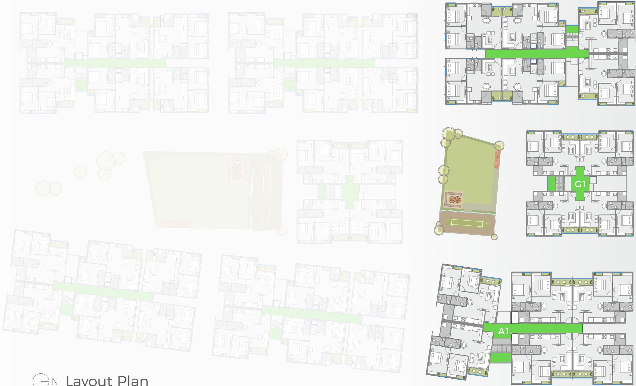
⊖ N Layout Plan