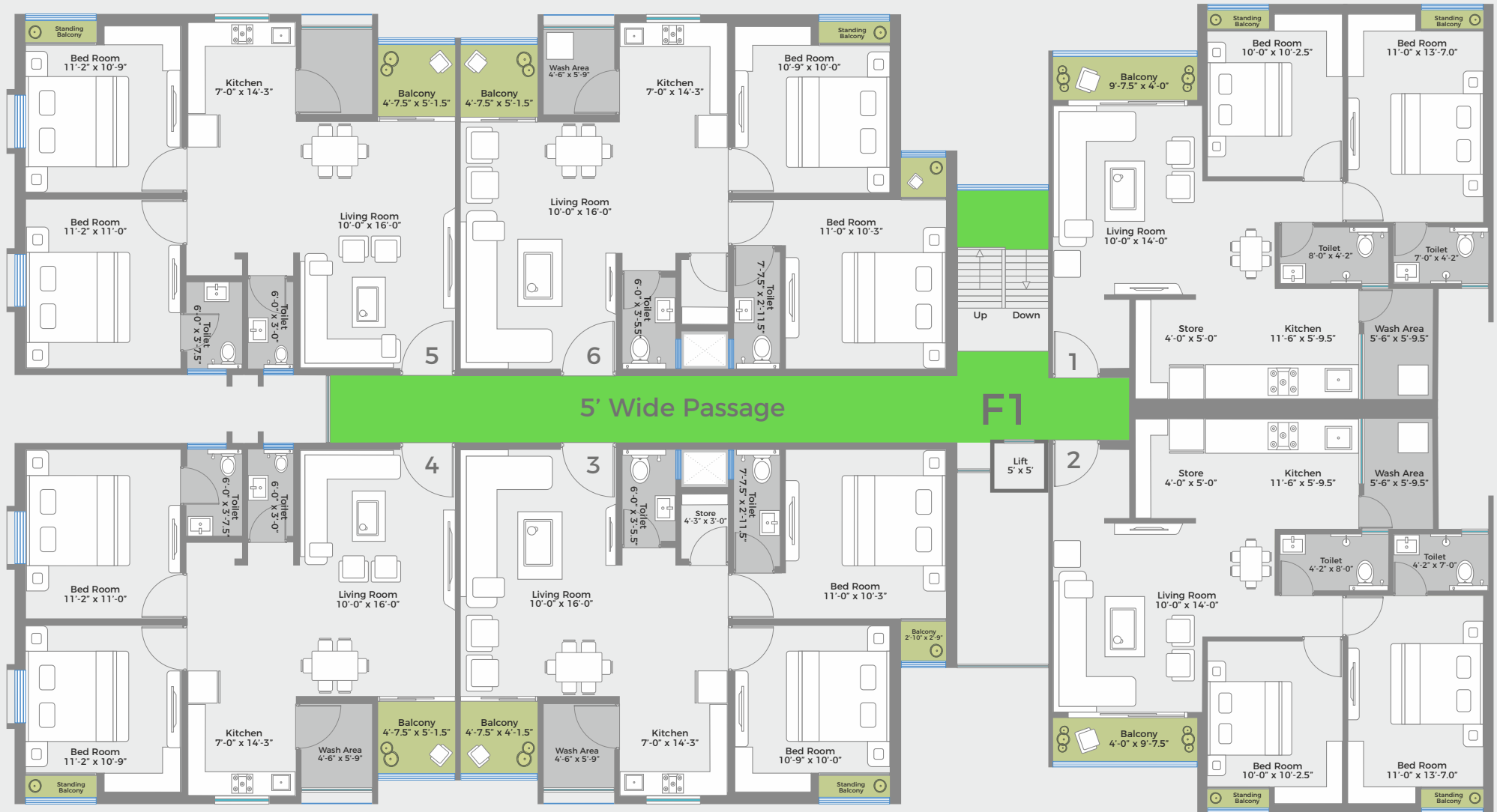
Building F1 - 2 BHK