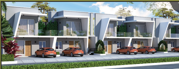
Forteasia The Grand, Sector 35, Bahadurgarh, Haryana