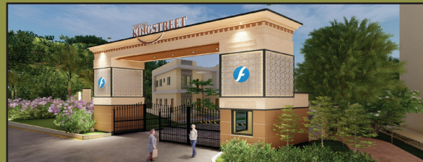
Kingstreet, Sector 3B, Bahadurgarh, Haryana