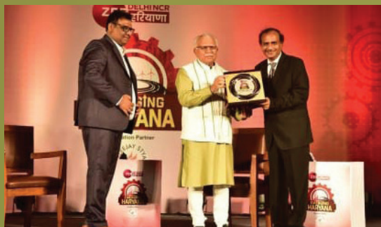
Excellence award to Forteasia Realty Pvt. Ltd. for being an integral part of Emerging Haryana, 2022. Presented by the Hon'ble Chief Minister of Haryana.