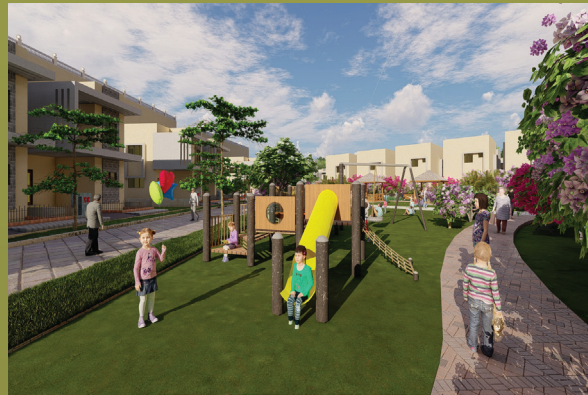
All images are Perspective View