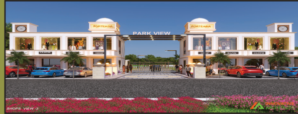
Forteasia Park View, Sector 27A, Rohtak, Haryana