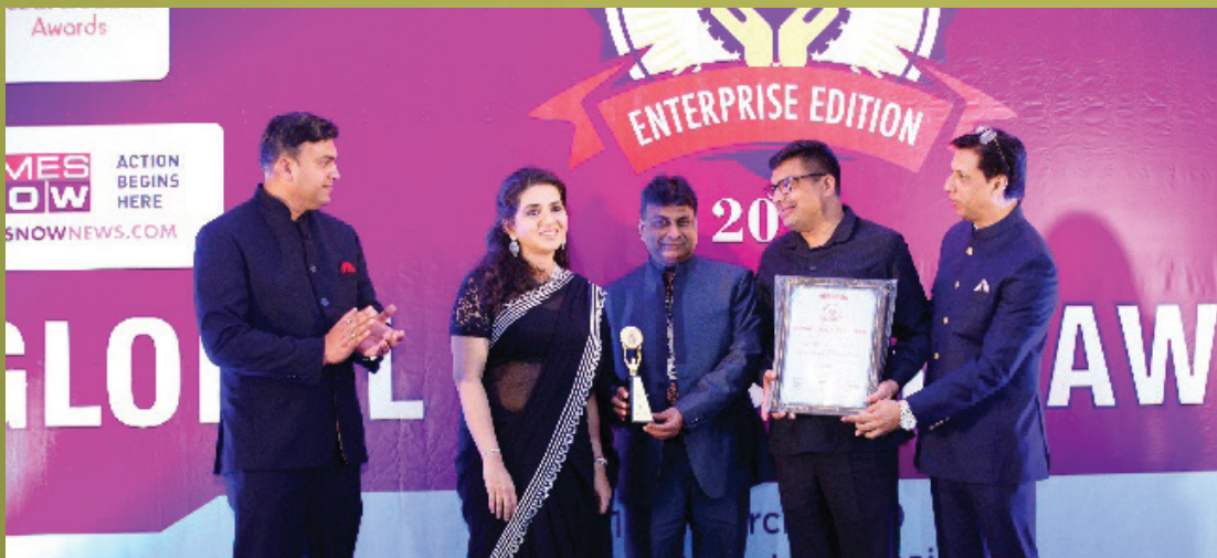
Best Emerging Township award to Forteasia Residency, Sector 28, Bahadurgarh at Global Entrepreneurship Awards, 2018.