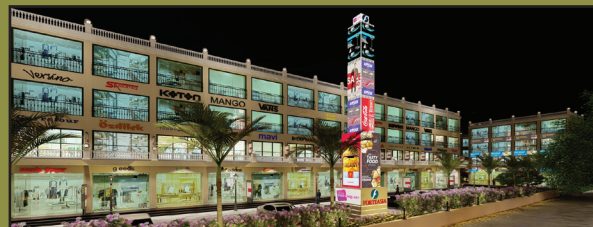
Time Square, Sector 3B, Bahadurgarh, Haryana