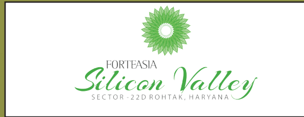
Forteasia Silicon Valley, Extension 1&2, Sector 22D, Haryana