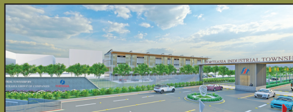
Forteasia Industrial Township (fit) Kalanaur, Rohtak, Haryana