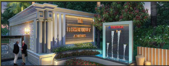
Forteasia Flower Valley, Sector 26, Jind, Haryana