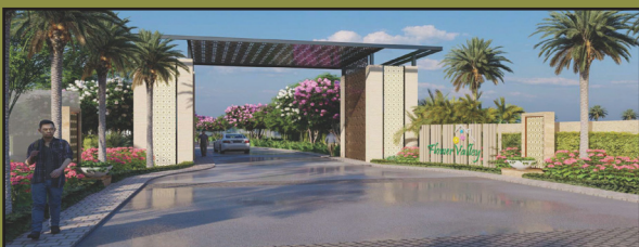
Forteasia Flower Valley, Sector 25, Yamunanagar, Haryana