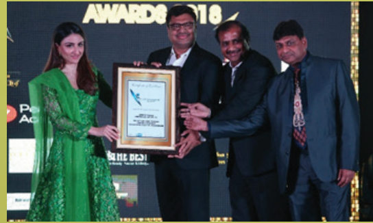
Best Emerging Developer In Affordable Township Projects In Delhi & NCR award to Forteasia Realty Pvt Ltd at Global Business Awards, 2018.