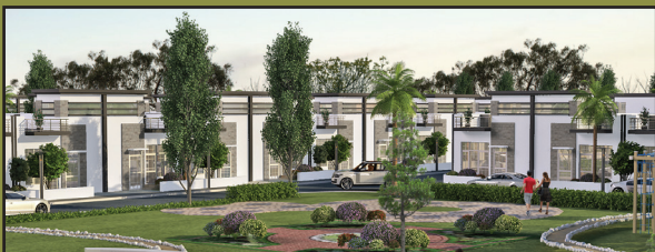
Forteasia Residency, Sector 28 & 28A, Bahadurgarh, Haryana