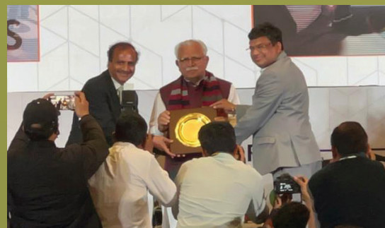
Recognized for on-time delivery of Forteasia Residency, Sector 28, Bahadurgarh project by the Hon'ble Chief Minister. The project was completed in a record timeframe of less than and half year.