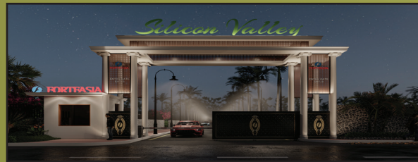
Forteasia Silicon Valley, Extension 3, Sector 22D, Rohtak, Haryana