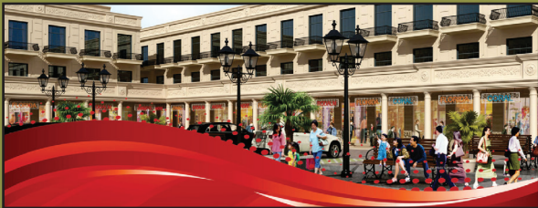
Forteasia Mart, Sectors 26 & 28, Haryana