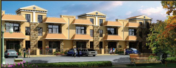
Silicon Valley, Sector 22D, Rohtak, Haryana