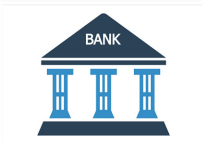
All Bank Loan Available