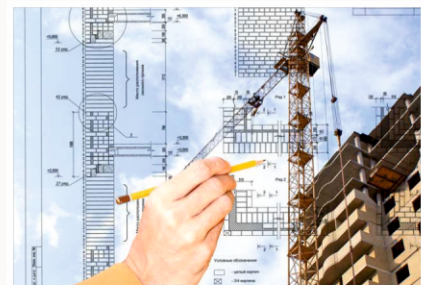
Best Quality Constriction