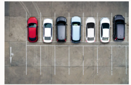
RESERVE CAR PARKING