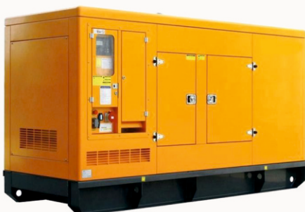
Power Back-up Common Area