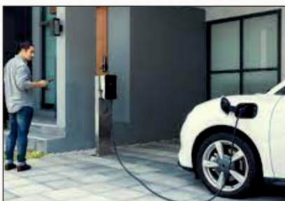
EV CHARGING POINT