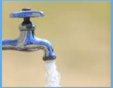
GOOD GROUND WATER