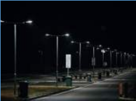
EB STREET LIGHTS