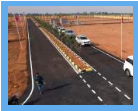
40' FEET ROAD