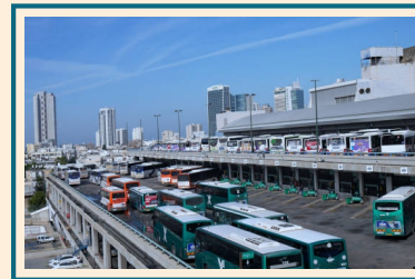
BUS TERMINAL LARGEST INTEGRATED BUS TERMINAL