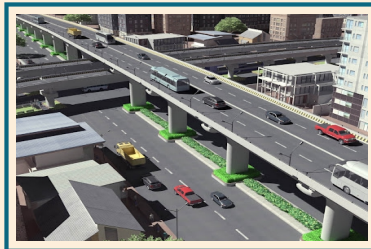
ELEVATED ROADS PROPOSED ELEVATED CORRIDORS