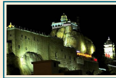
ROCK FORT OLDER THAN HIMALAYAS