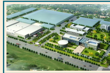
BHEL BHARATH HEAVY ELECTRICALS