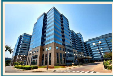
IT PARK - Phase II ELCOT IT PARK (SEZ)