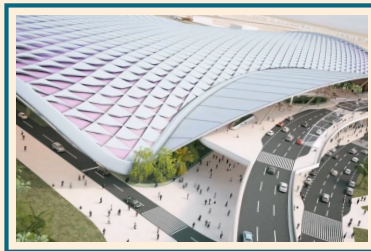
AIRPORT 2nd LARGEST AIRPORT IN TN