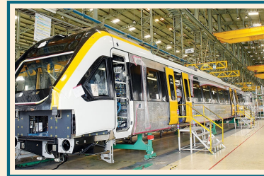
GOLDEN ROCK RAILWAY WORKSHOP