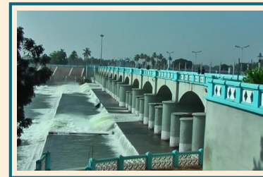
KALLANAI WORLD'S FIRST ANAICUT