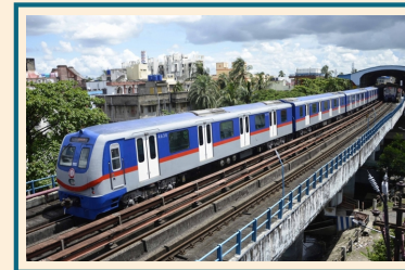
METRO PROPOSED MRTS