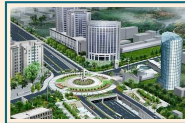
TIDEL PARK PROPOSED TIDEL PARK - PHASE II