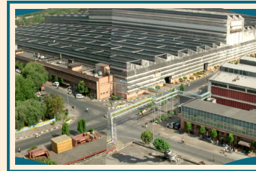
OFT / HAPP ORDNANCE FACTORY