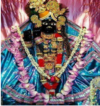
Shri Banke Bihari Temple 4.5 km