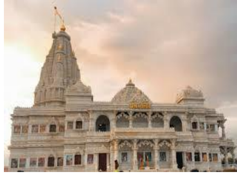
Prem Mandir 3.0 km