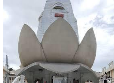
Kamal Mandir 1.5 km