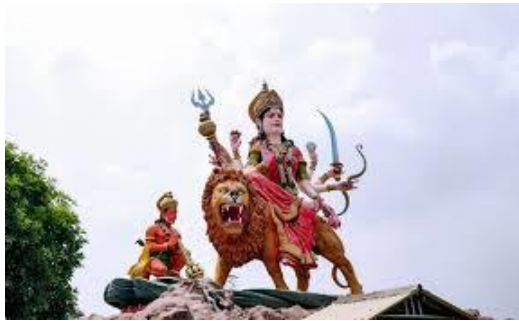
Vaishno Mata Mandir 1.3 km