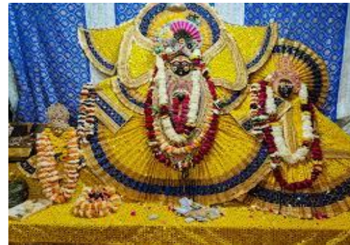
Garud Govind Mandir 1.0 km