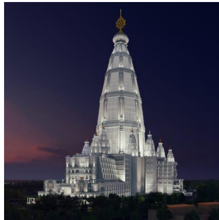
Chandrodaya Mandir 1.0 km