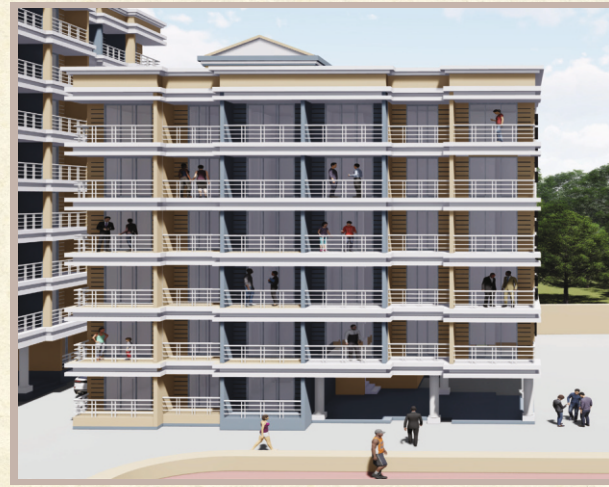
SK HEIGHTS II