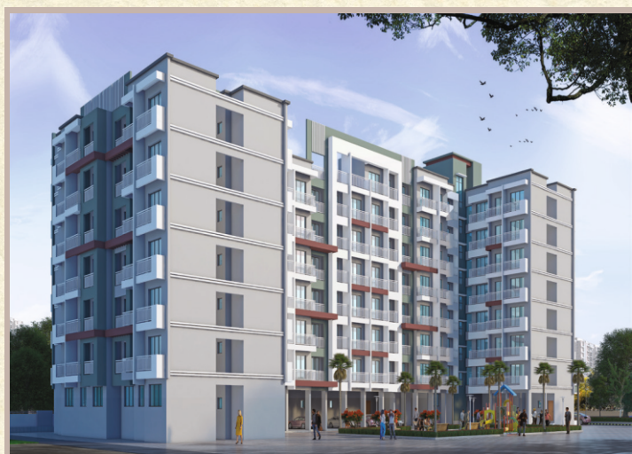
SK HEIGHTS III