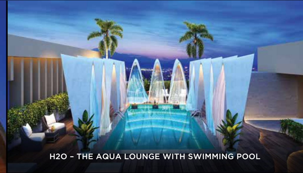
H2O - THE AQUA LOUNGE WITH SWIMMING POOL

AMANIA - THE LEISURE LOUNGE WITH CONVERSATION COVE