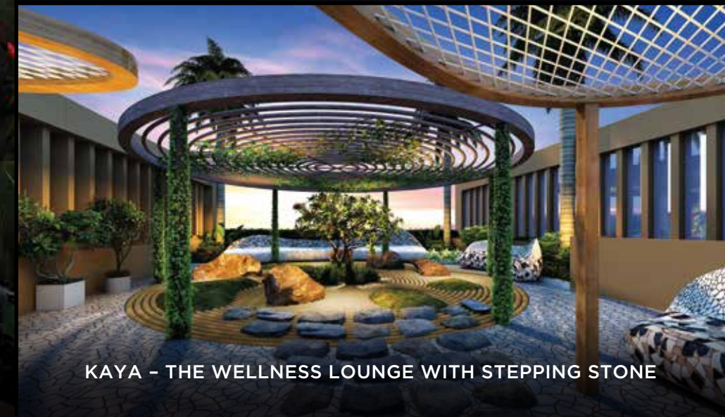
KAYA - THE WELLNESS LOUNGE WITH STEPPING STONE