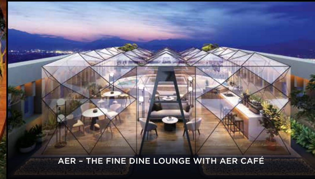
AER - THE FINE DINE LOUNGE WITH AER CAFÉ