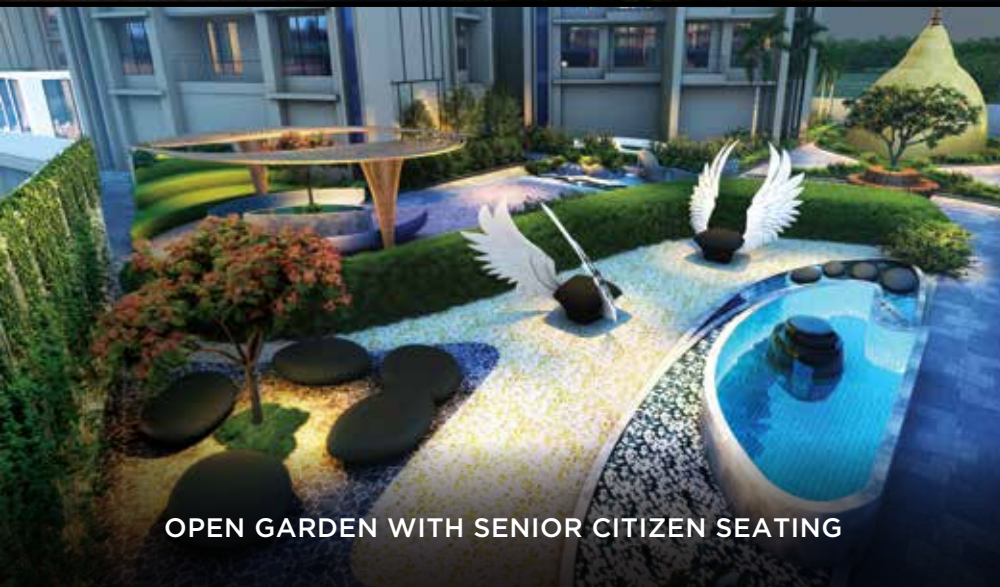
OPEN GARDEN WITH SENIOR CITIZEN SEATING