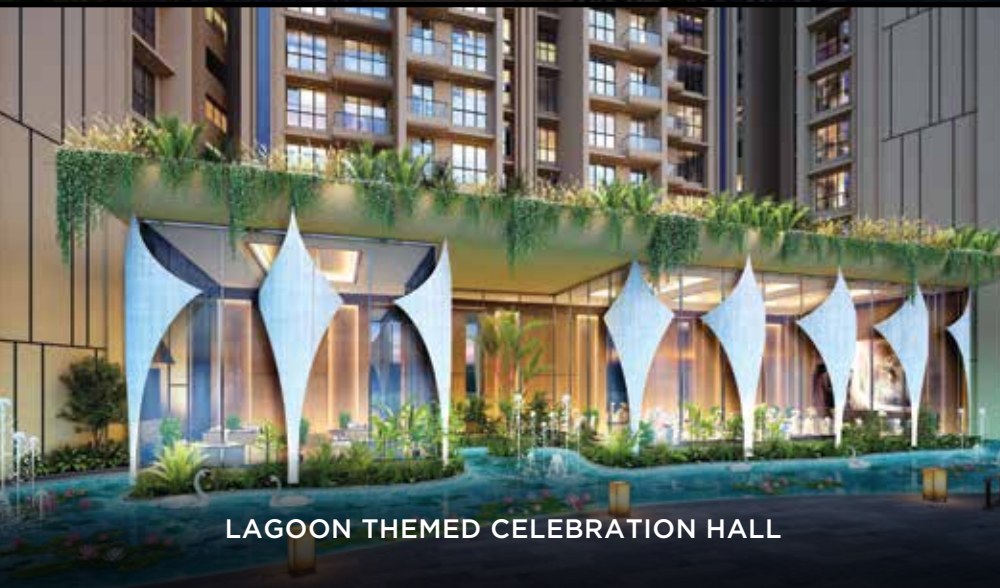
LAGOON THEMED CELEBRATION HALL