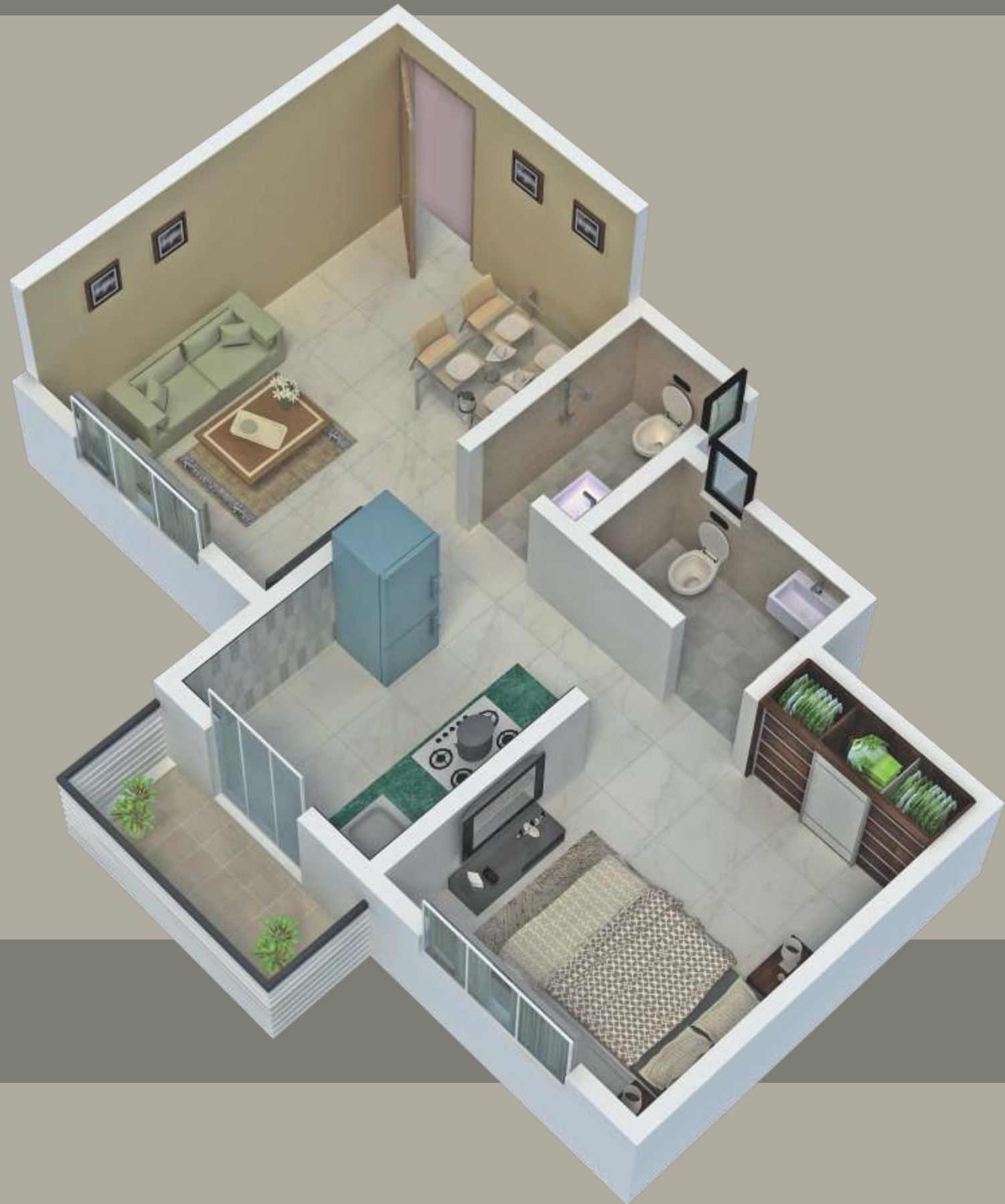
1 BHK- 3D VIEW