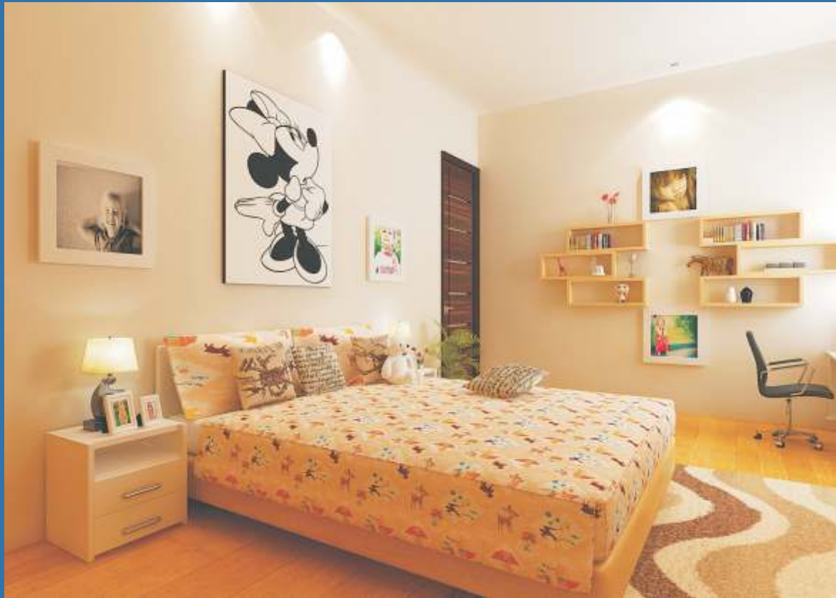
KIDS ROOM | Size: 110 Sqft. to 123 Sqft. approx.