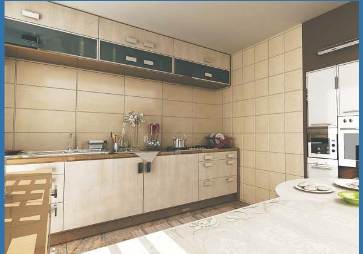
KITCHEN | Size: 63 Sqft. to 82 Sqft. approx.