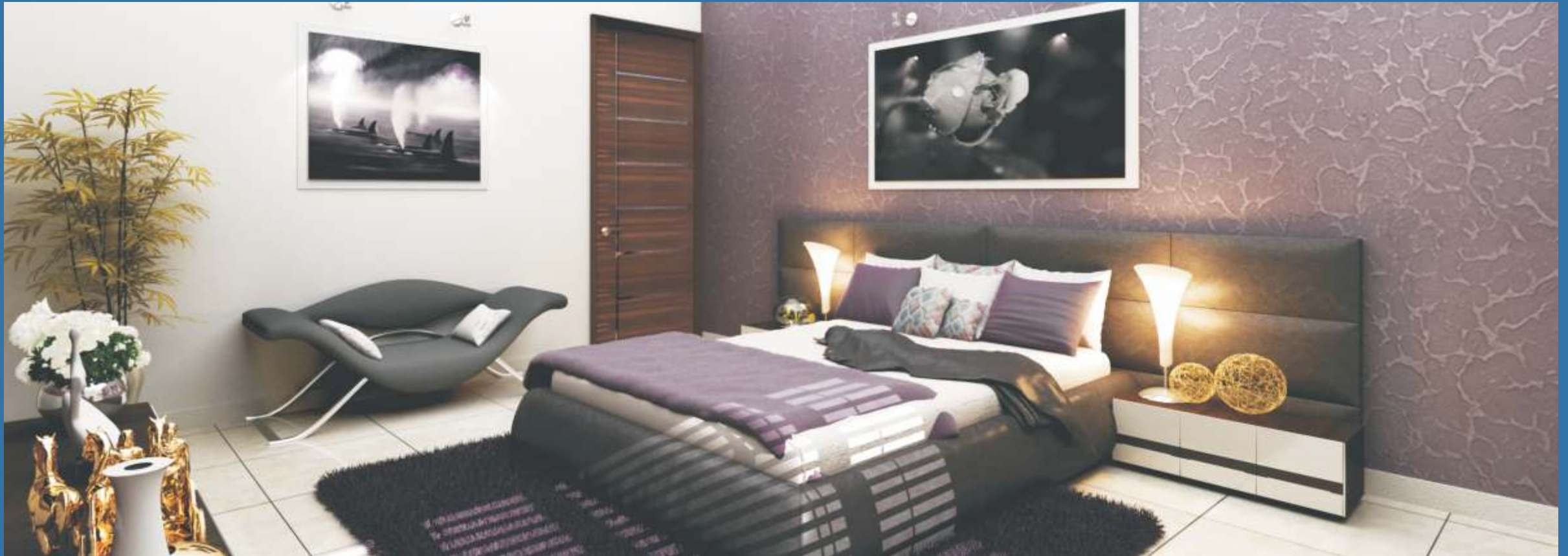
MASTER BEDROOM | Size: 140 Sqft. to 170 Sqft. approx.