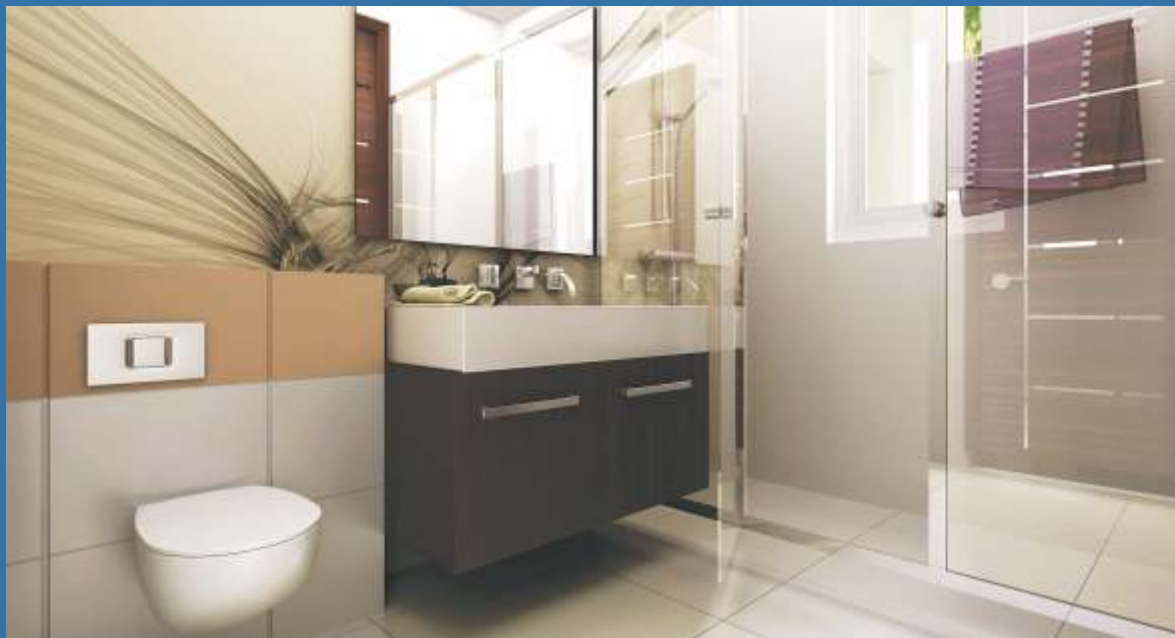
WASHROOM | Size: 45 Sqft. approx.