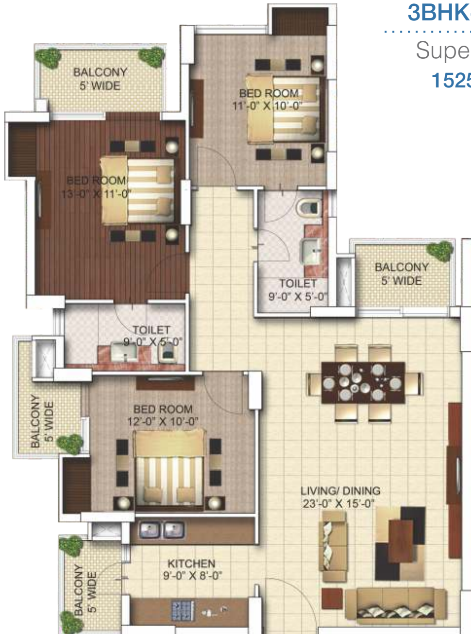
3BHK+2TOI ..... Super Area 1525 Sq.ft.