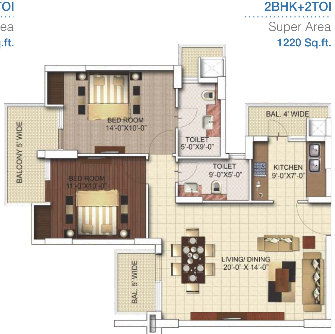
2BHK+2TOI ..... Super Area 1220 Sq.ft.