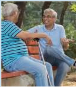
Senior Citizen Area