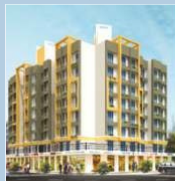
Sai Ashish Tower,