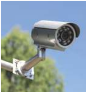
24/7 Security Camera