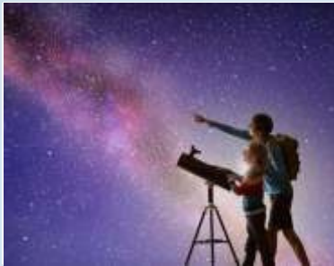
Star Gazing Area