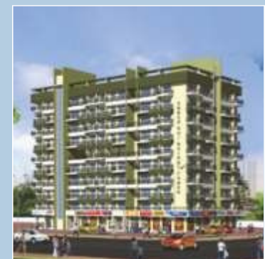
Sai Height Tower