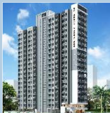
OM Shri Vakratund