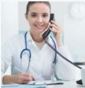
24/7 On Call Doctor