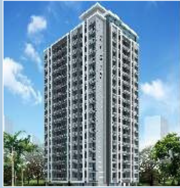
Hari OM Hari