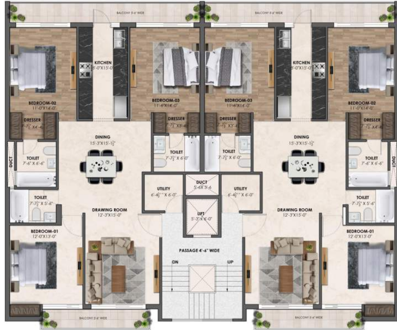
1st-3rd Floor Plan (32'x70')