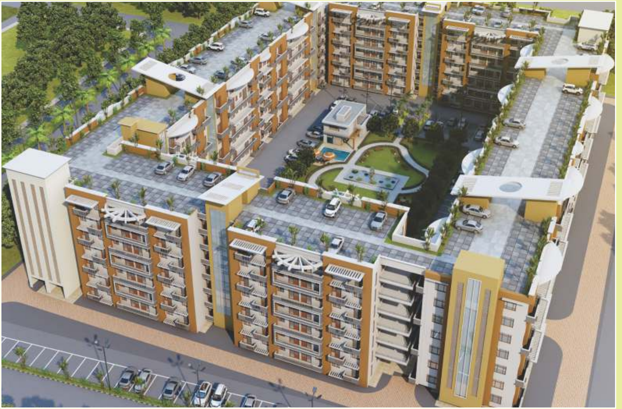
● Proposed Aerial View

All specifications, designs, layout, images, conditions are only indicative & some of these can be changed at the discretion of the builder/architect/authority. These are purely conceptual & constitute no legal offerings.