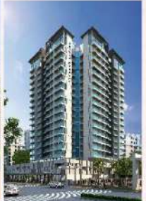
OSTWAL DARSHAN (Bhayandar - East)