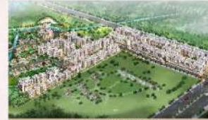
OSTWAL WONDER CITY (Boisar - East)