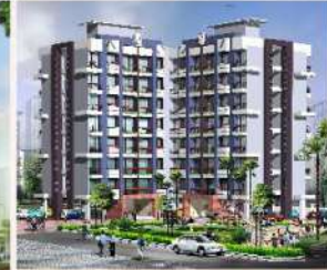
OSTWAL HEIGHTS - 4, 5 (Mira Road - East)