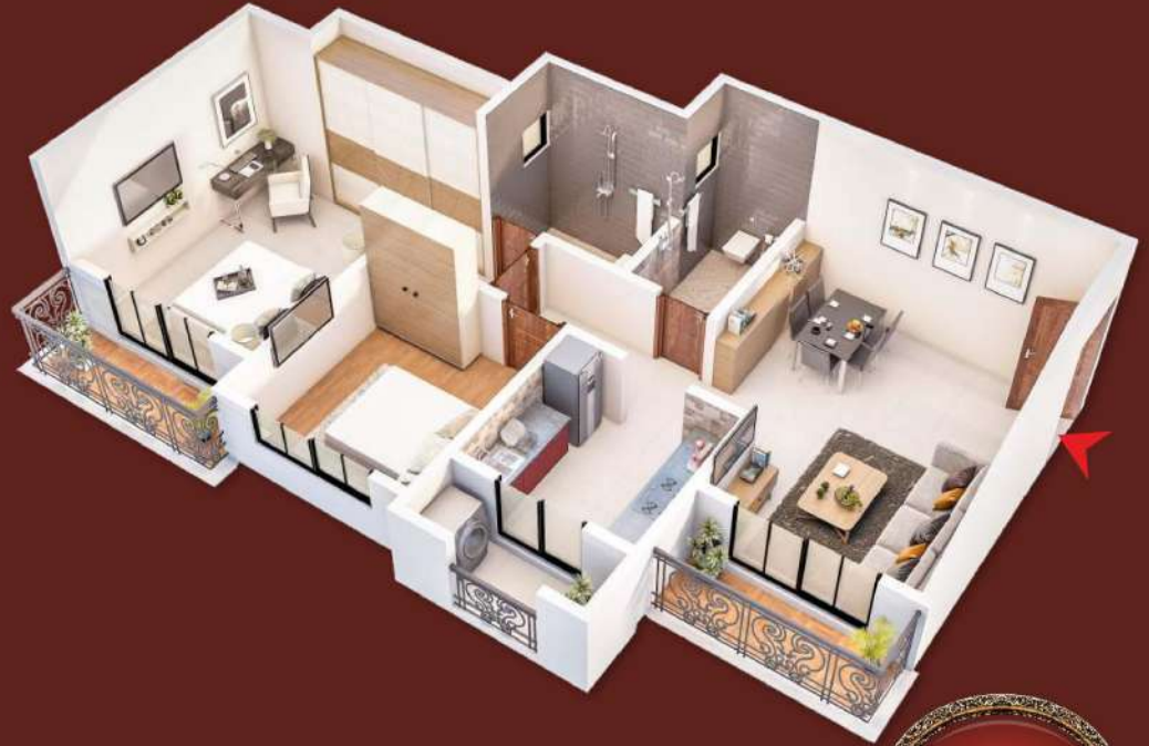
2 Bhk ISOMETRIC VIEW