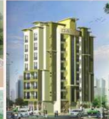
OSTWAL OASIS (Mira Road - East)