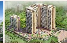
OSTWAL ORCHID 9 TO 12 (Mira Road - East)