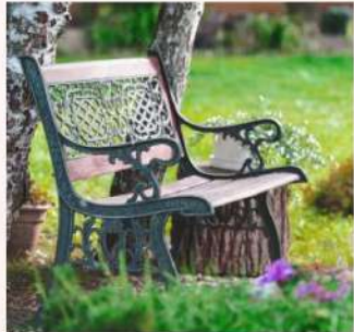
*Artist's impression. Not the actual offering.