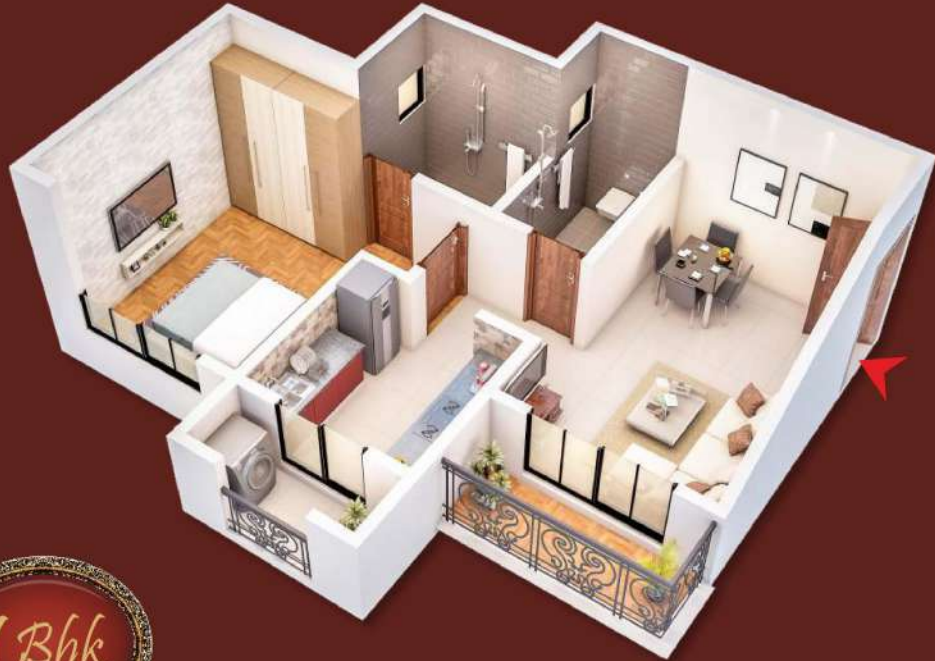
1 Bhk ISOMETRIC VIEW