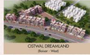
OSTWAL DREAMLAND (Boisar - West)