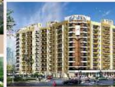
OSTWAL ORCHID 1 TO 5 (Mira Road - East)