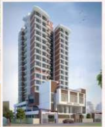
OSTWAL TOWER (Borivali - West)