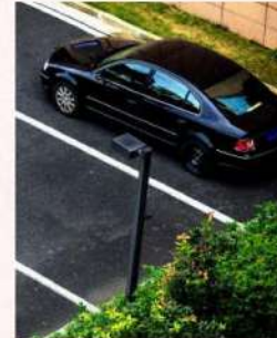
*Artist's impression. Not the actual offering.