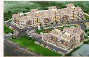
KESAR PARK (Boisar - East)