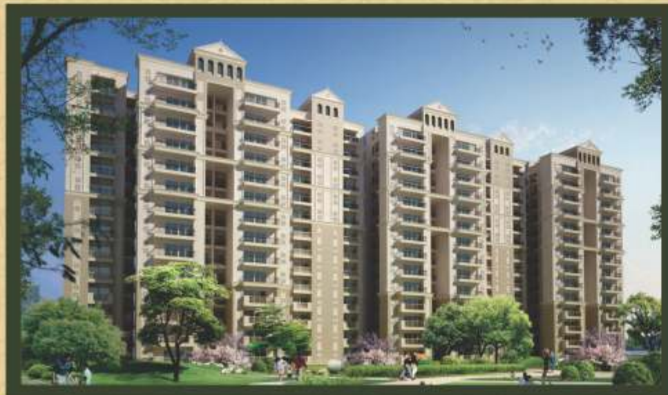
VP Eminence, Karjat, Pune