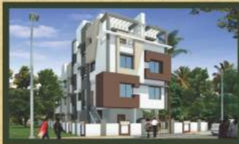
VP Icon, Pradikaran, Pune