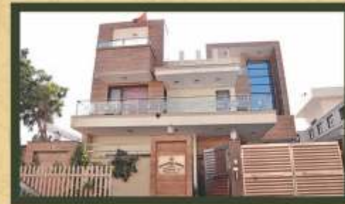
Villas Sector-21C Faridabad (HR.)