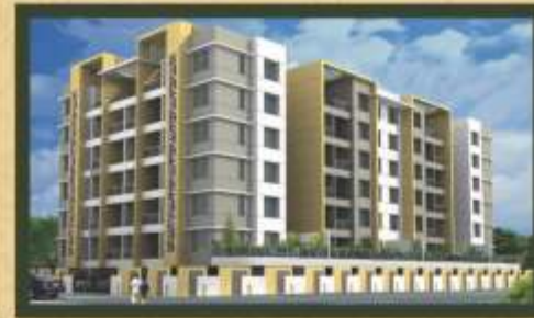
Viva City, Kharadi, Pune