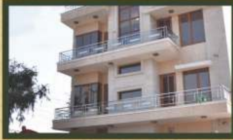
Low Rise Floors Sector-49 Faridabad (HR.)