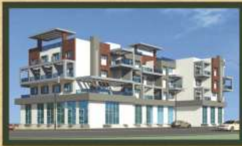
VP Florence, Wakad, Pune