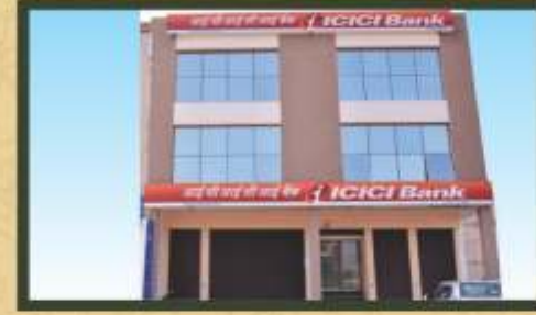
Commercial Spaces Sector-49 Faridabad (HR.)