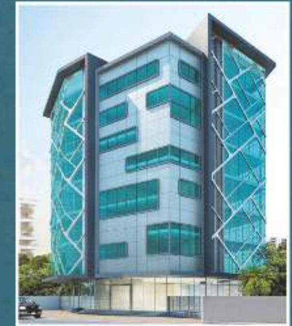
SOS BANDRA (W)