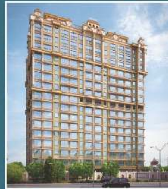
MILLIONAIRE HERITAGE, S. V. ROAD, ANDHERI (W)

The Millionaire Group is always committed to quality construction and timely delivery.