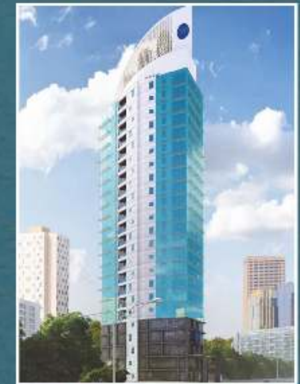
WALKESHWAR OCEAN 360