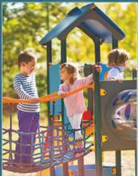
Childrens Play Area