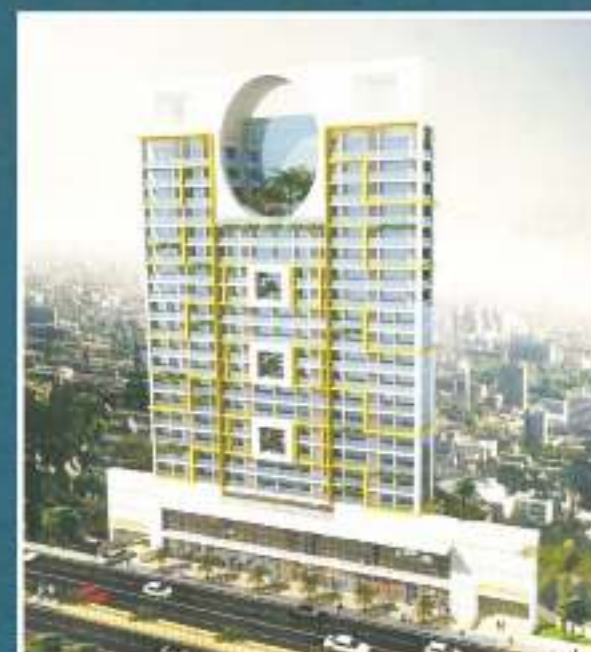
STAR CONSTRUCTION, YARI ROAD, ANDHERI (W)