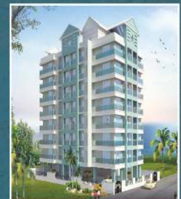
7 STAR CONSTRUCTIONS, YARI ROAD, ANDHERI (W)