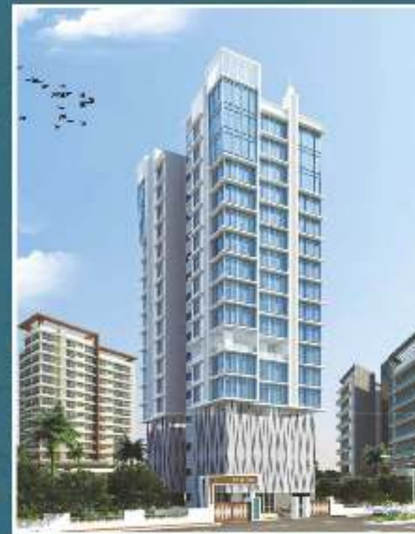
SARAH HEIGHTS, GRANT ROAD (E)