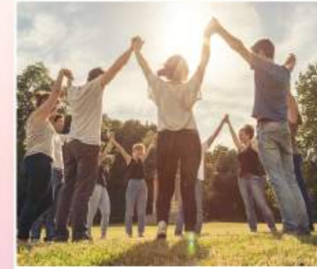
RESIDENTS COMMUNITY PARK