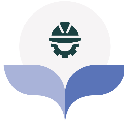
Top-notch Industries in Close Vicinity