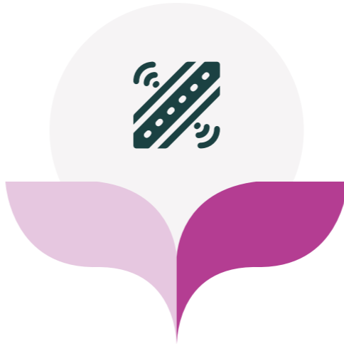
Easy Highway Connectivity