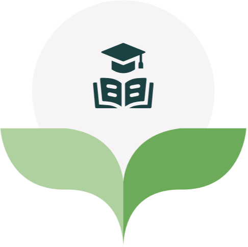
Schools & Colleges Nearby