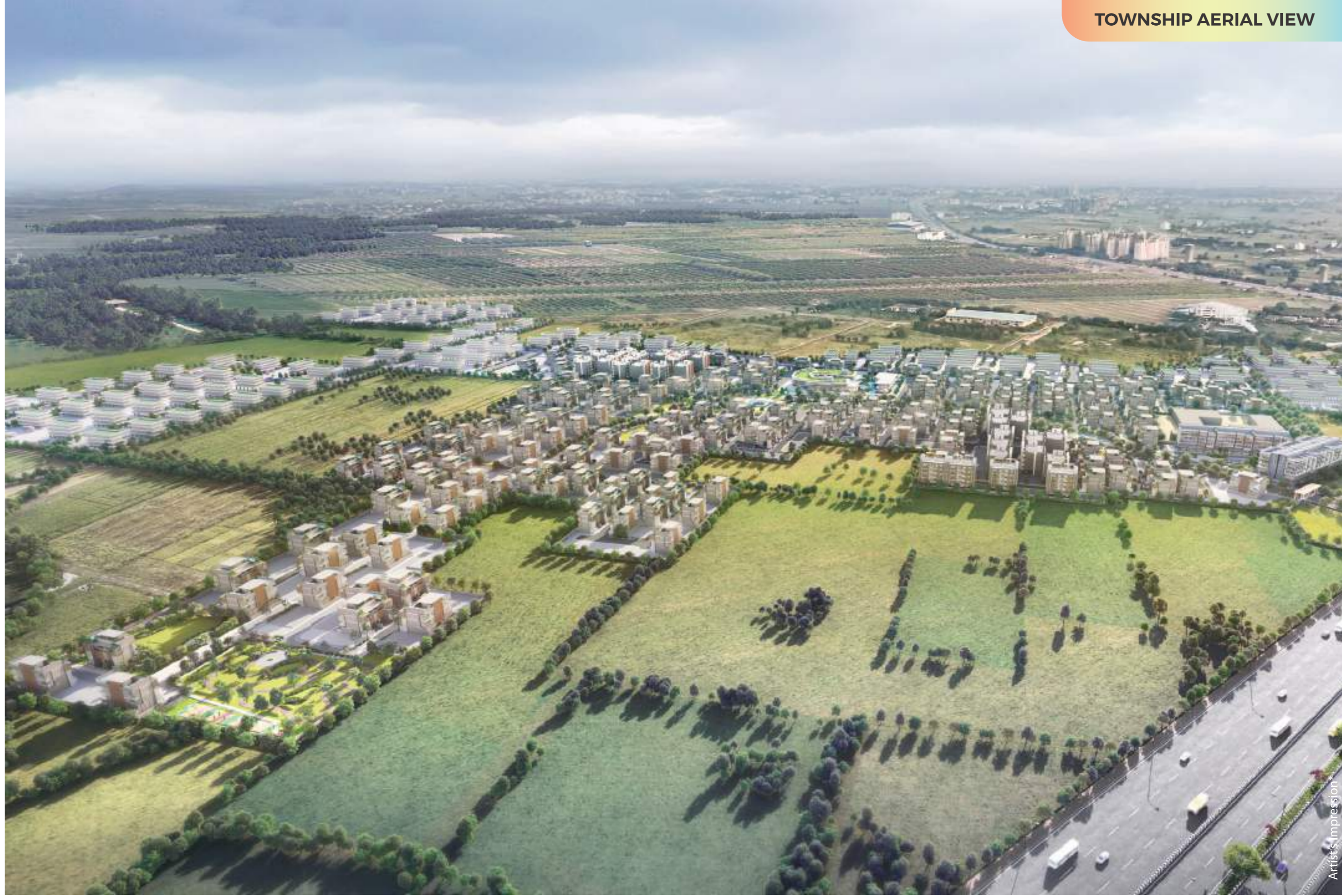
TOWNSHIP AERIAL VIEW