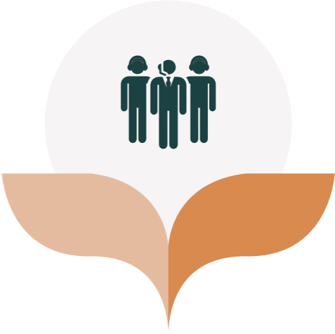
Availability of Skilled Manpower and Semi-Skilled Labour