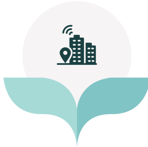
Convenient Access to Delhi and Gurugram