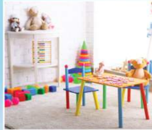
KIDS' INDOOR PLAY AREA