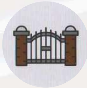
GATED AND WALLED SECURITY