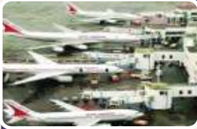
Jewar International Airport