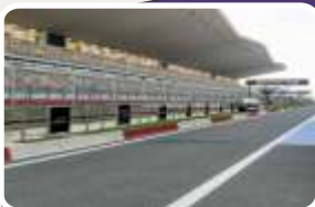
Budh International Circuit