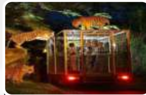
Proposed Night Safari