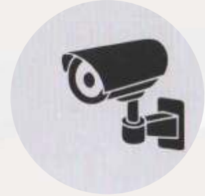
24 X 7 SECURITY