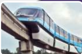
Proposed Mono Rail