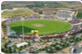
International Cricket Stadium