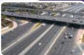
Eastern Peripheral Expressway