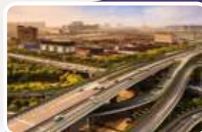
Delhi-Mumbai International Corridor