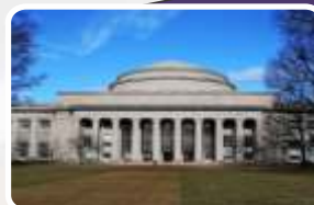
World Class Universities