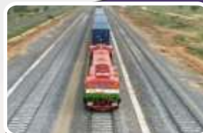
Freight Corridor By Indian Railway