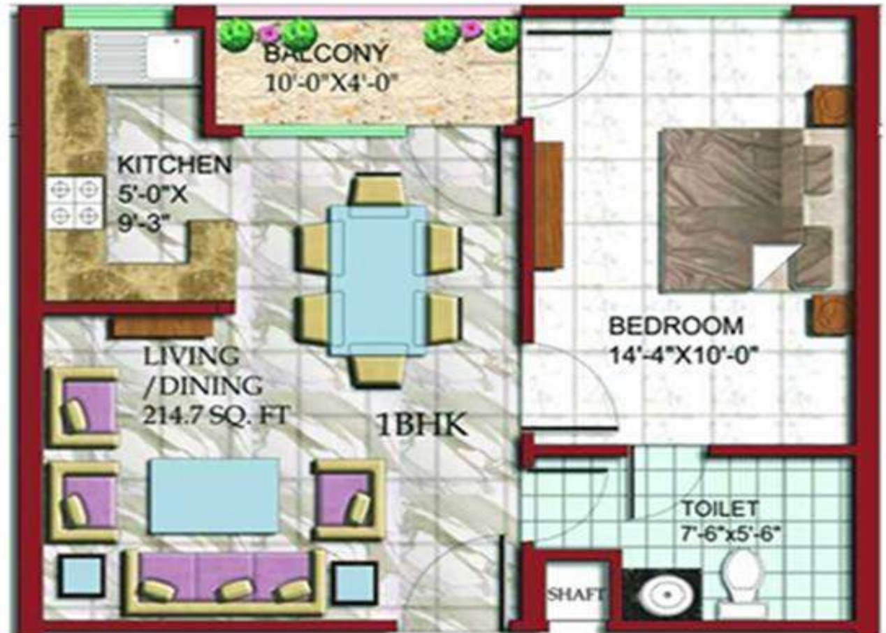
Deluxe/Superior - 715 (sqft)