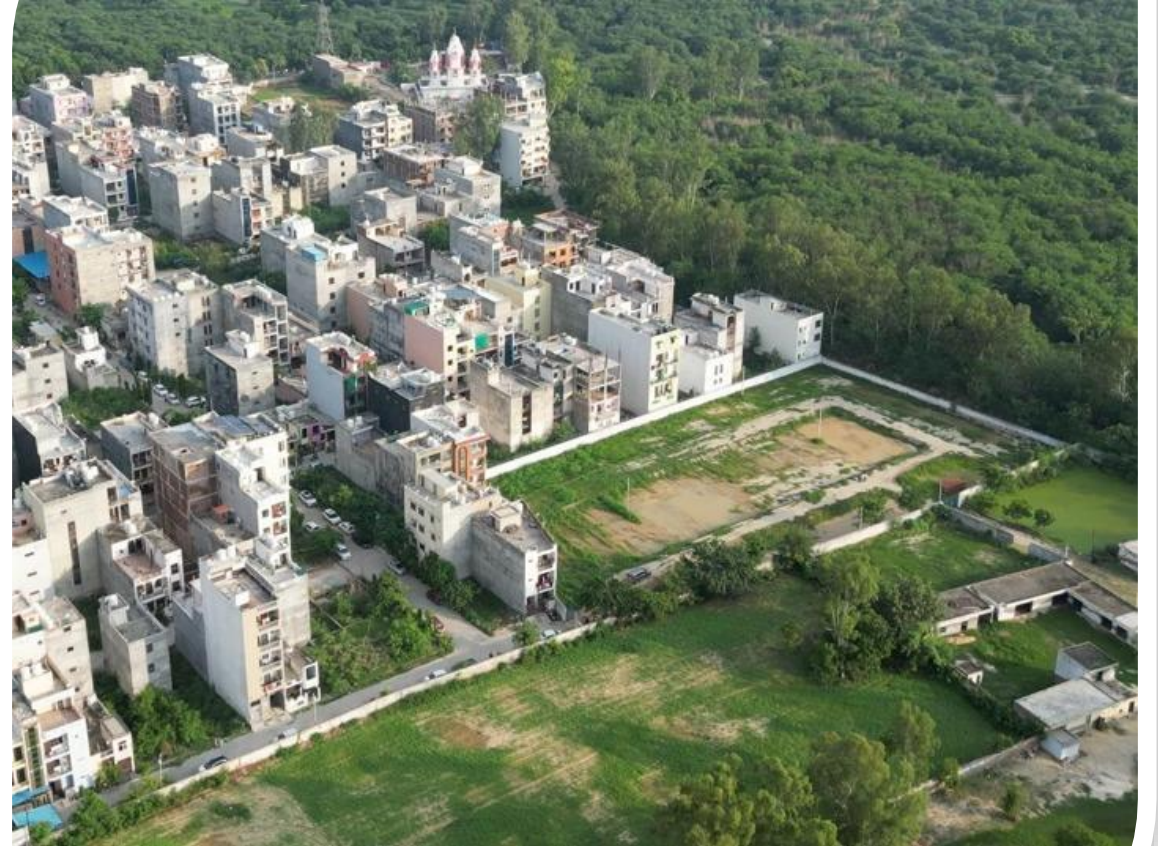
Sarin Farms Plot