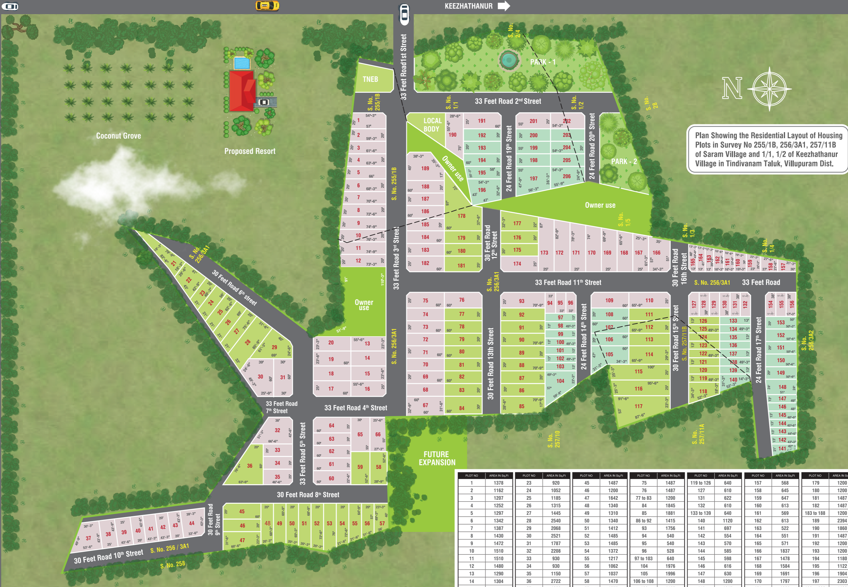
Plan Showing the Residential Layout of Housing Plots in Survey No 255/1B, 256/3A1, 257/11B of Saram Village and 1/1, 1/2 of Keezhathanur Village in Tindivanam Taluk, Villupuram Dist.