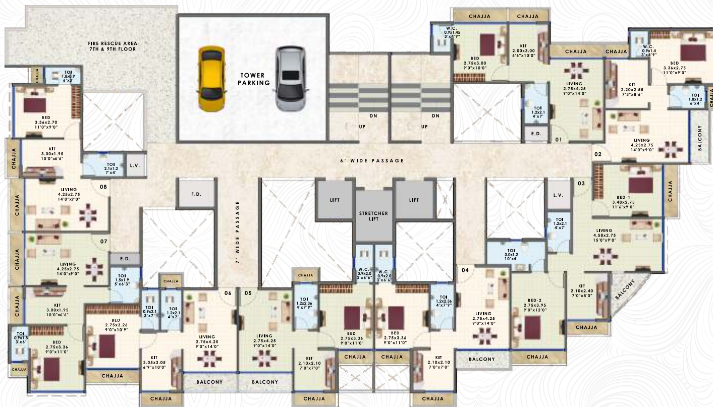
9 th Floor Plan