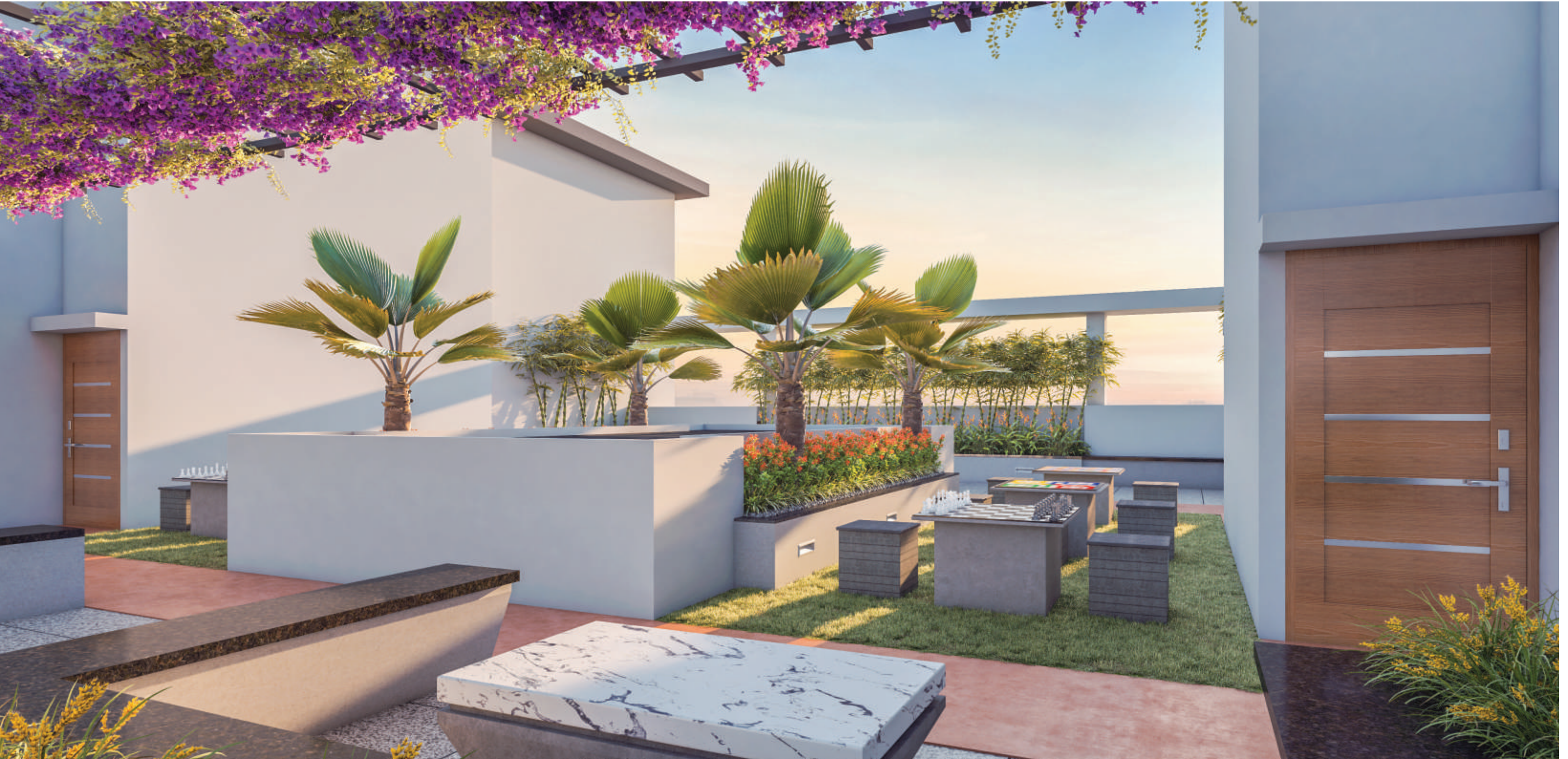
Artistic Impression | Top Terrace Game Area