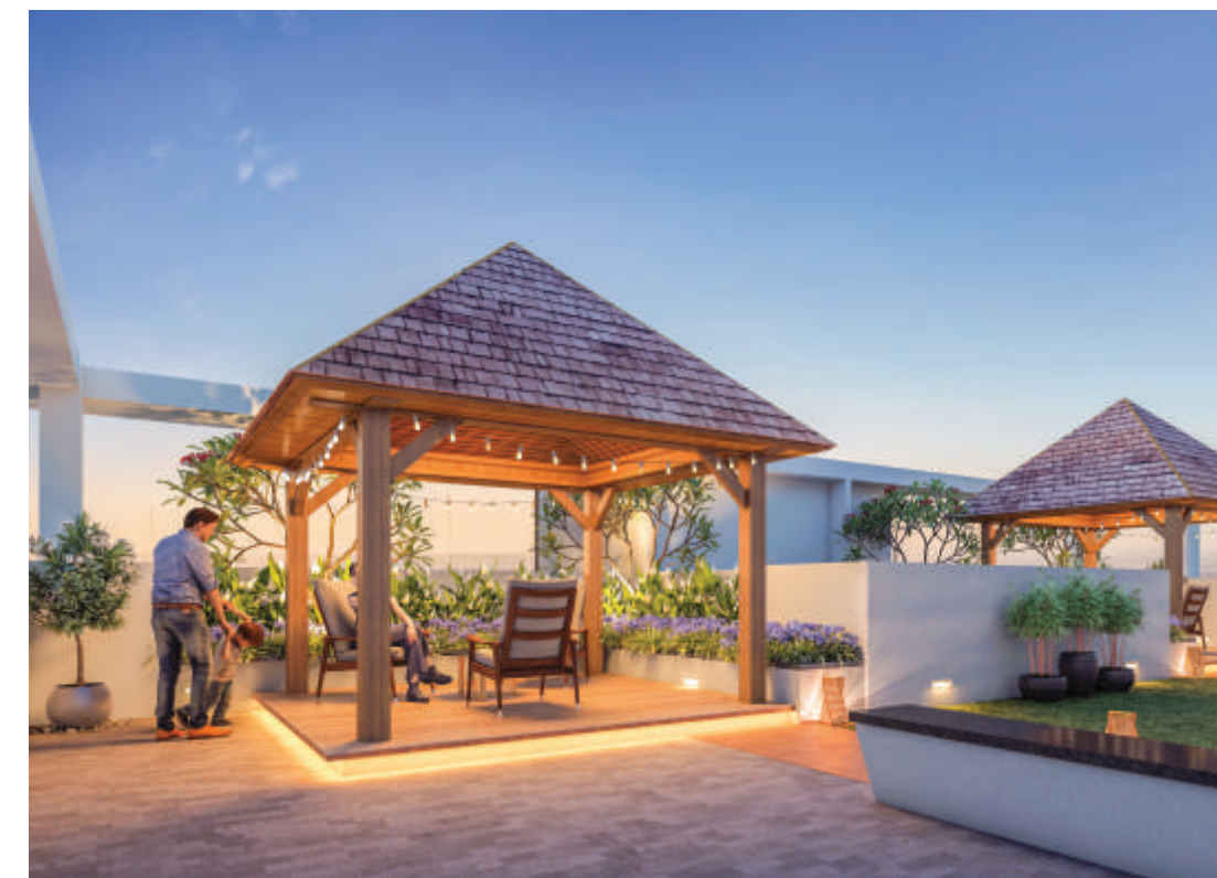
Artistic Impression | Sky Deck Gazebo