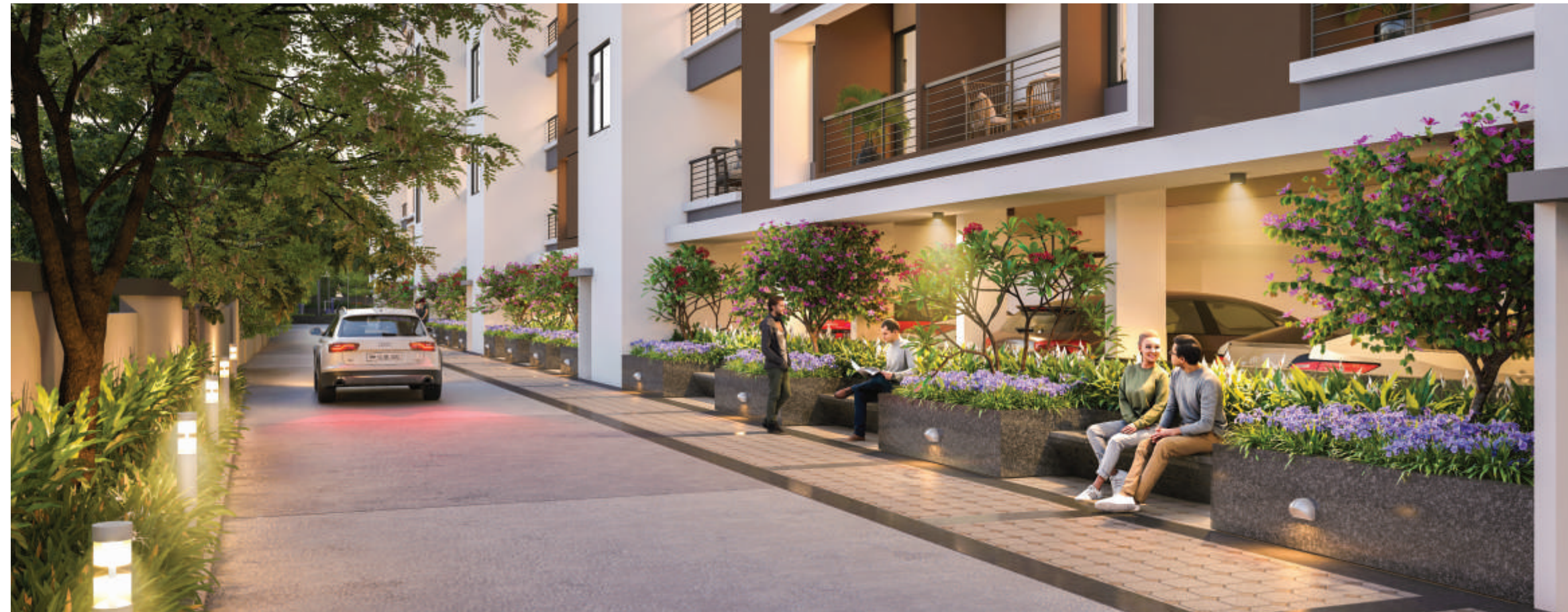
Artistic Impression | Drive Way Sitting Area