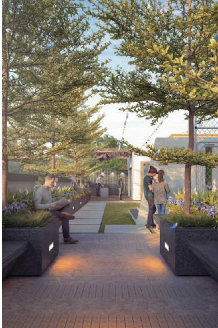
Artistic Impression | Ground Floor Sitting Area