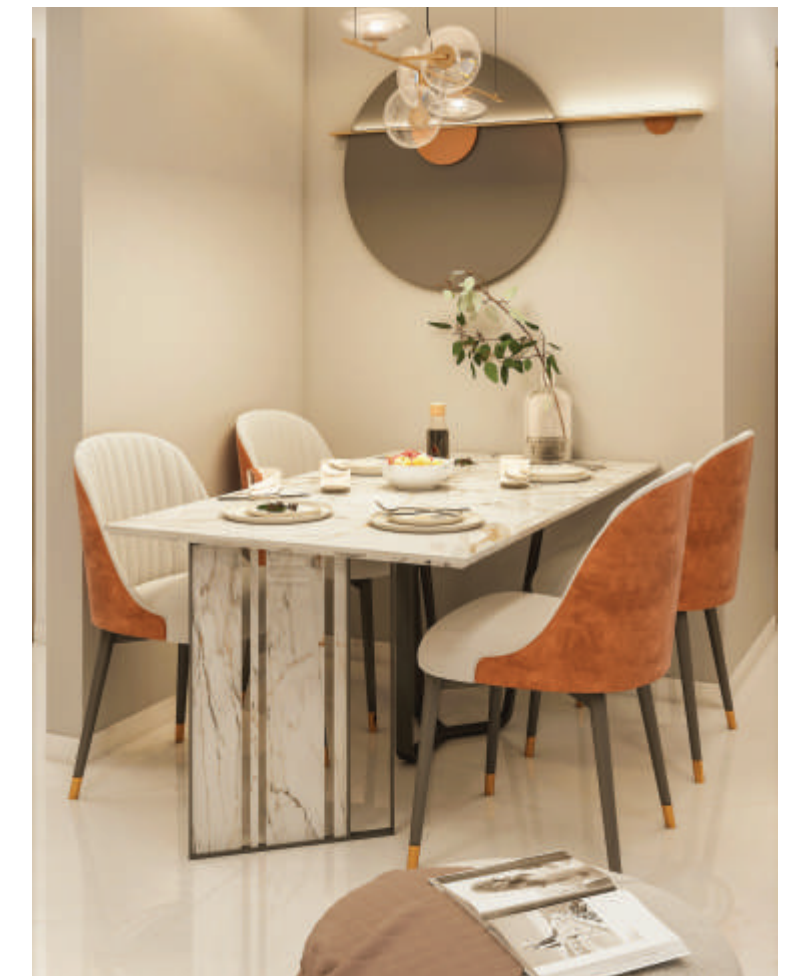
Artistic Impression | Dining Area