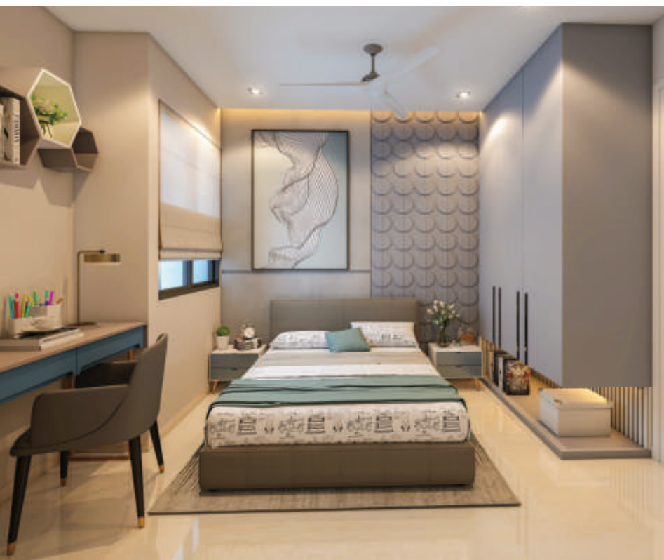
Artistic Impression | Children's Bedroom