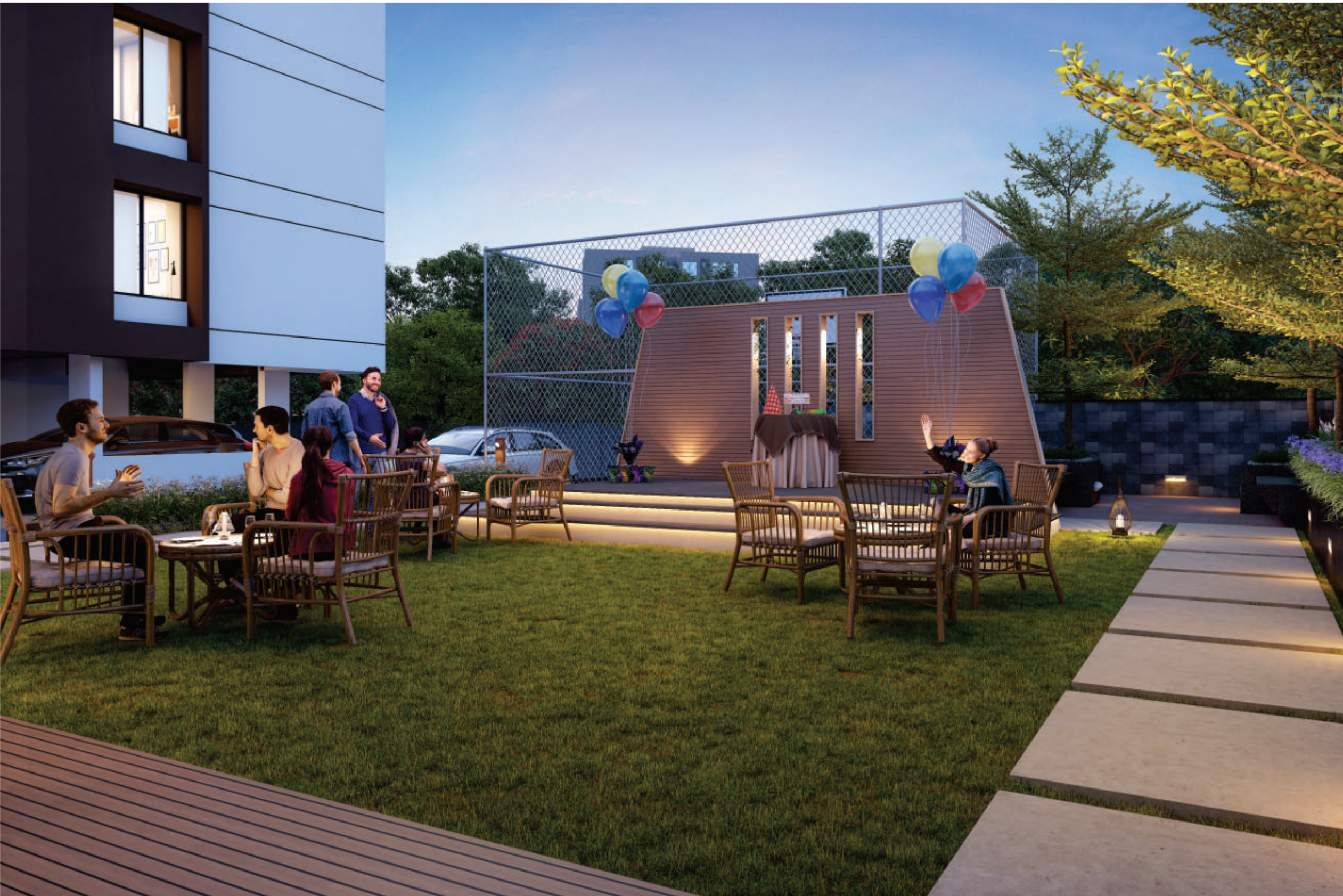
Artistic Impression | Club House