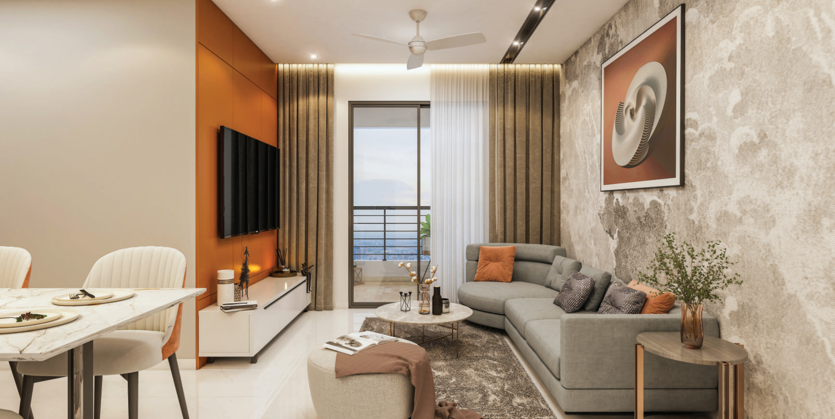
Artistic Impression | Living Room