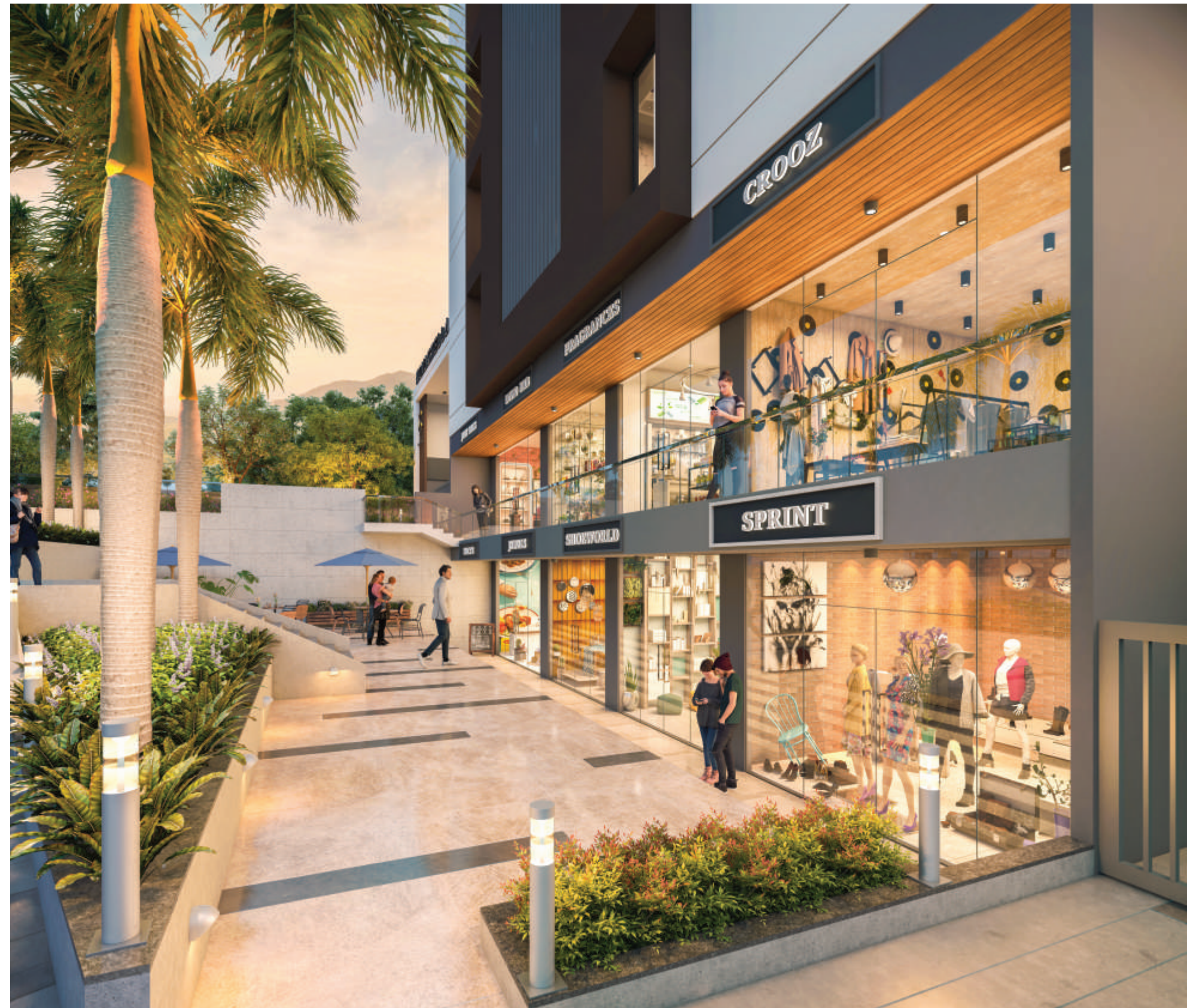
Artistic Impression | Commercial Space