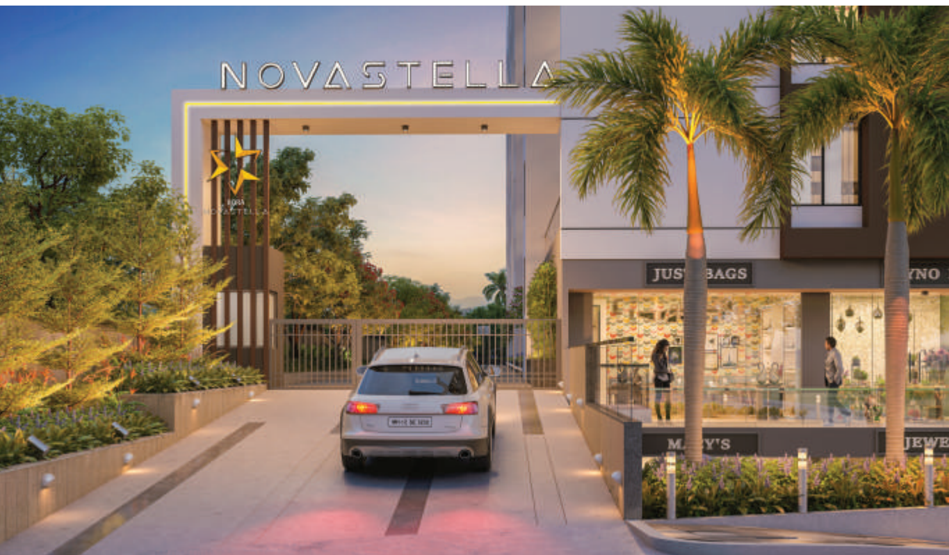
Artistic Impression | Entrance Gate