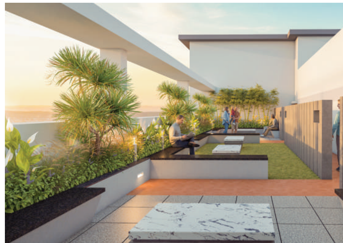
Artistic Impression | Sky Deck Katta Sitting