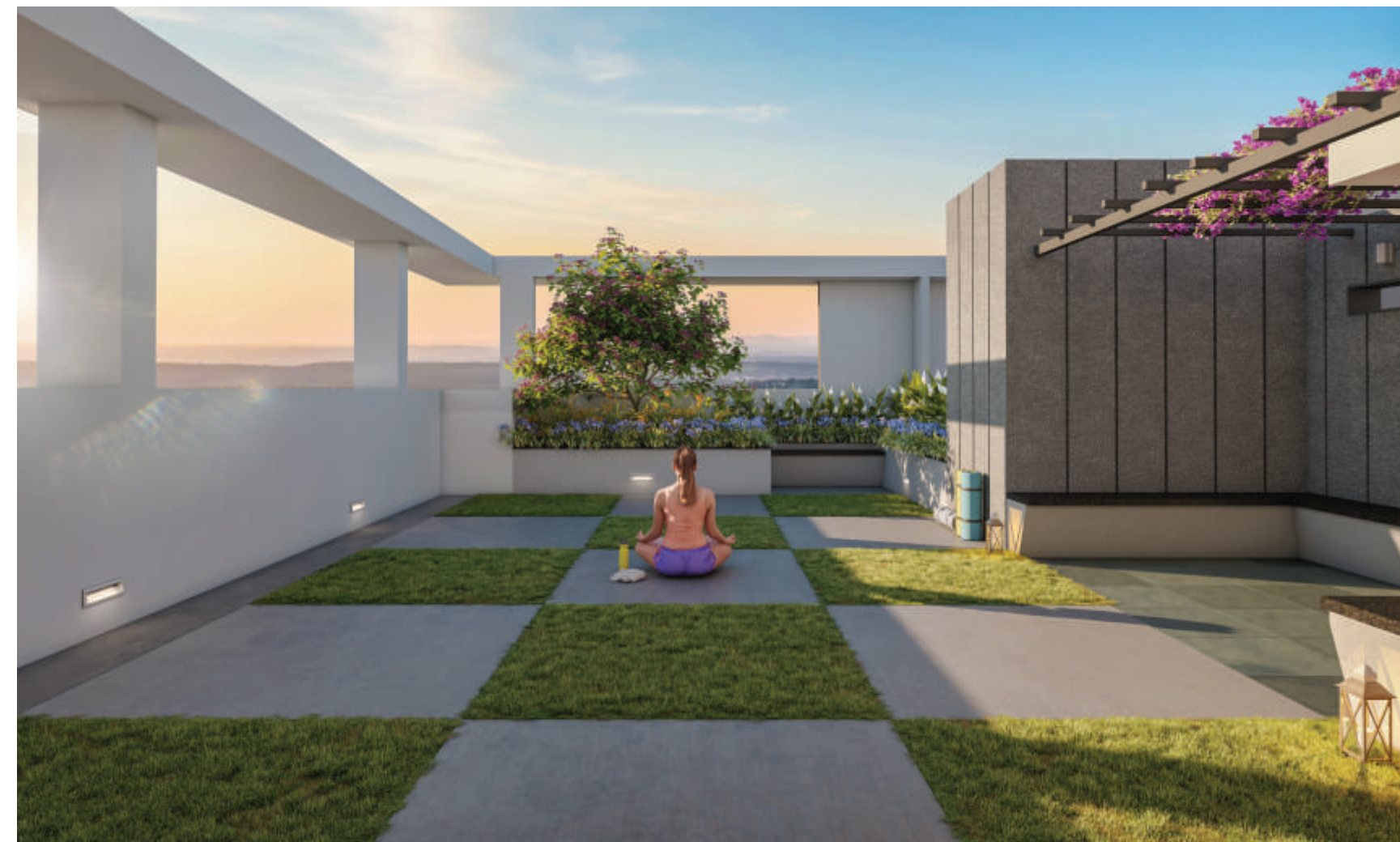
Artistic Impression | Top Terrace Meditation Area