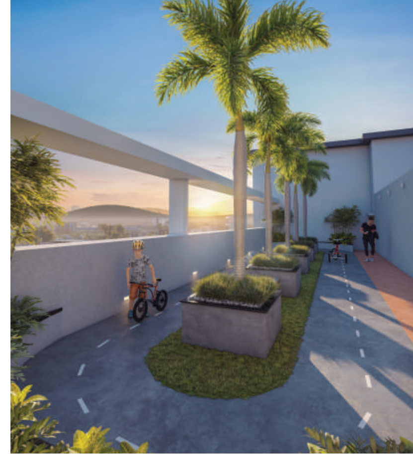
Artistic Impression | Top Terrace Walking Pathway