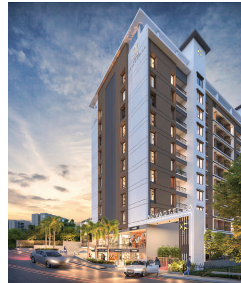
Artist's Rendering | Project Elevation