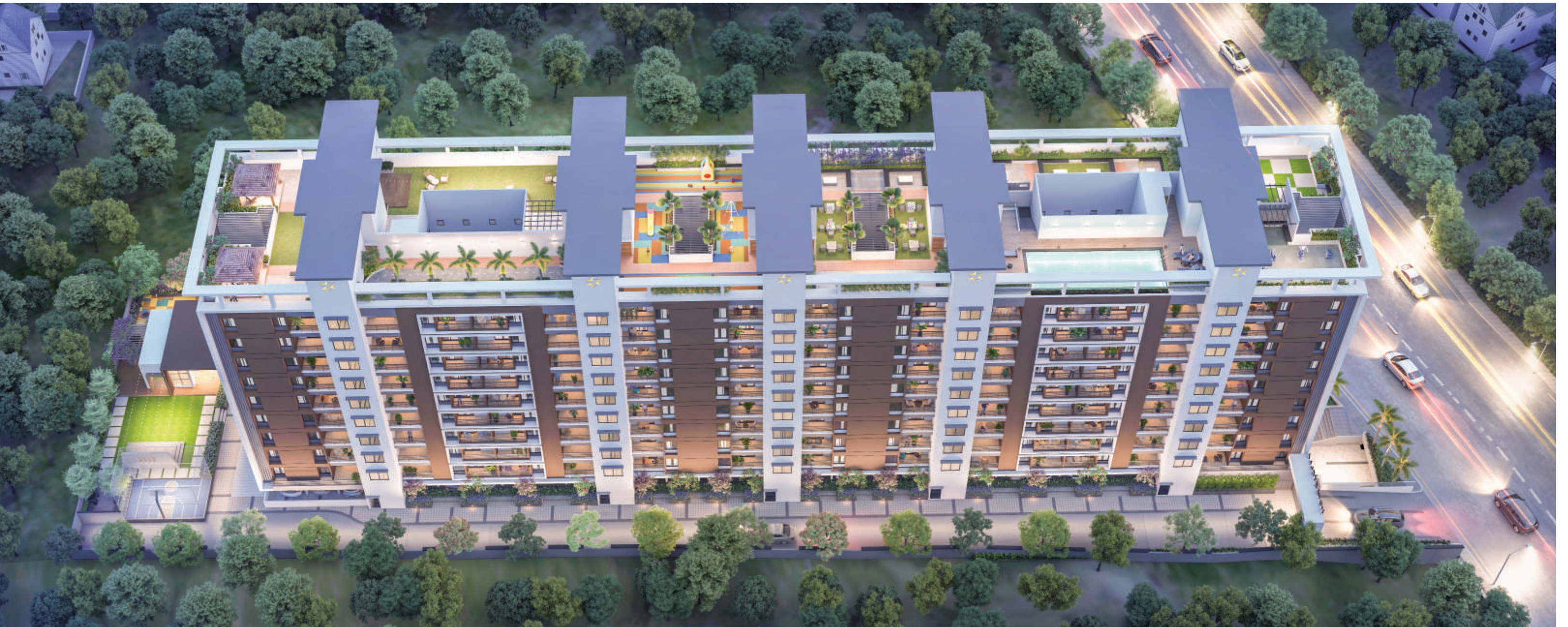
Artistic Impression | Aerial View