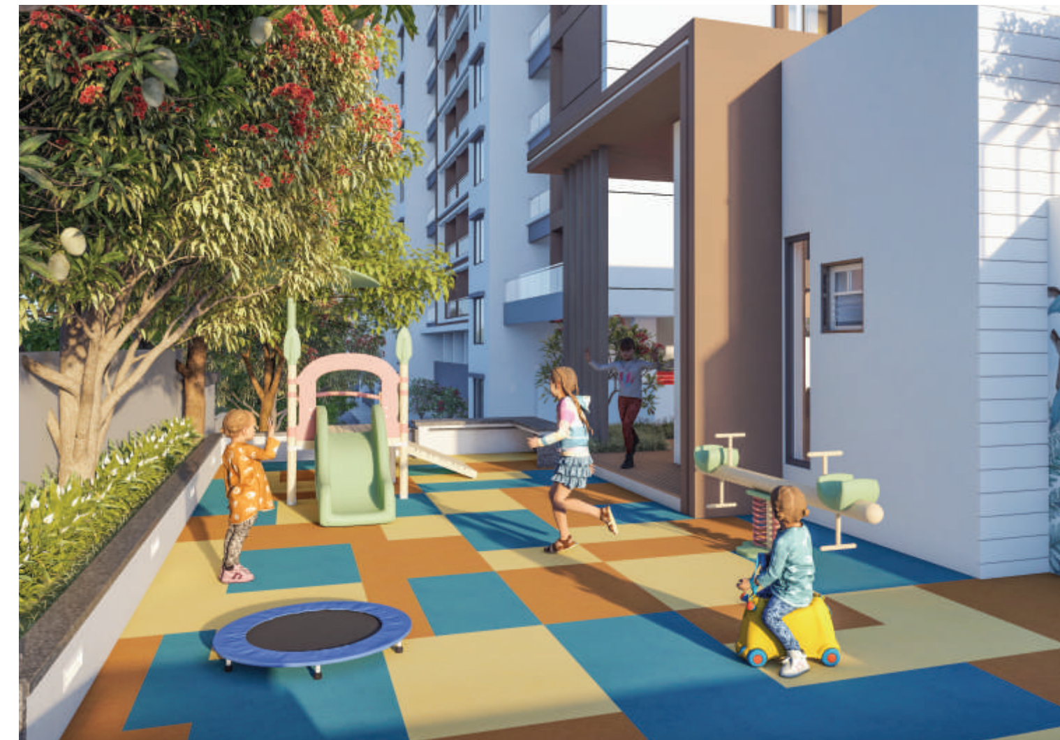
Artistic Impression | Children's Play Area