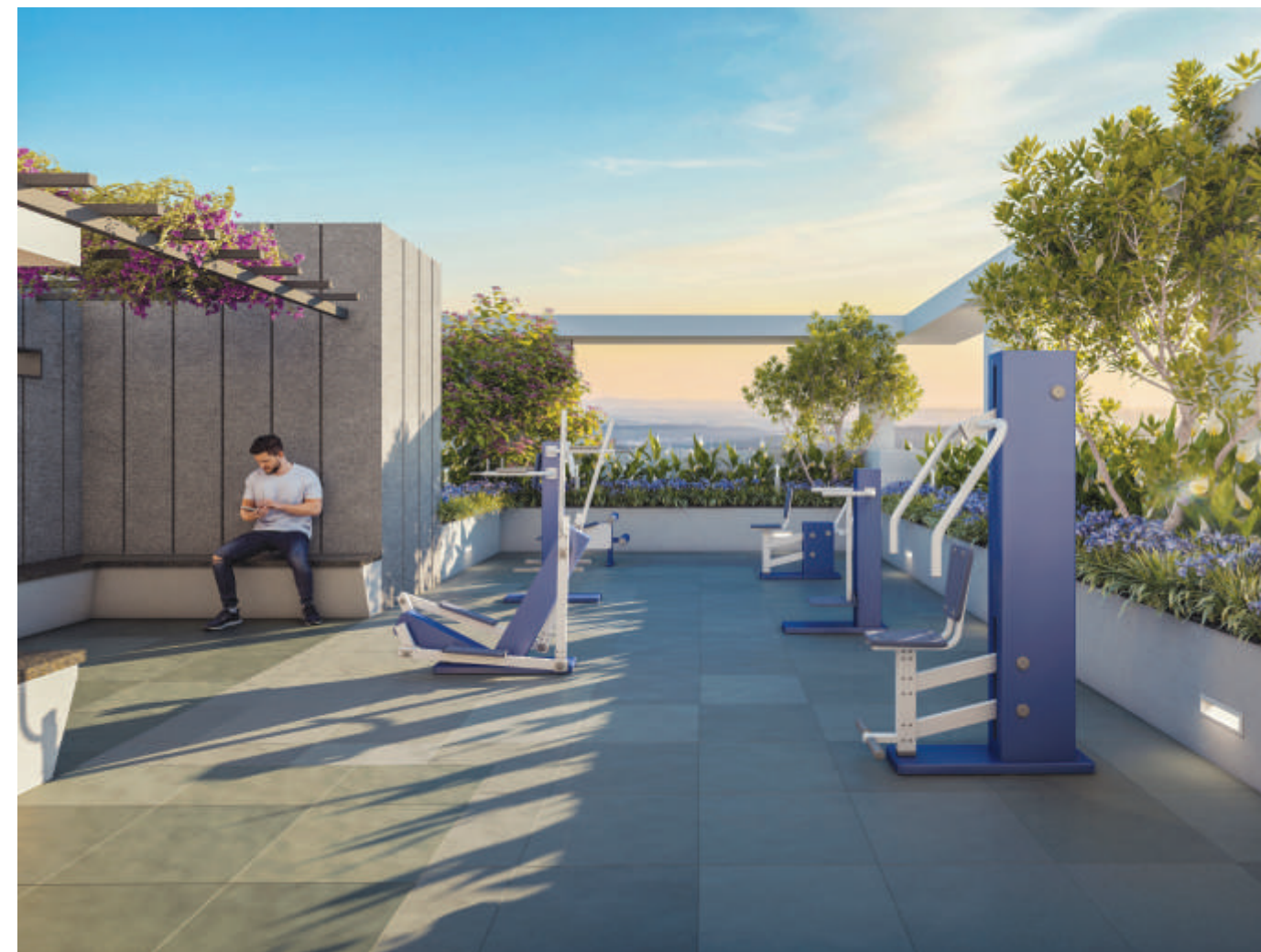
Artistic Impression | Top Terrace Outdoor Gymnasium