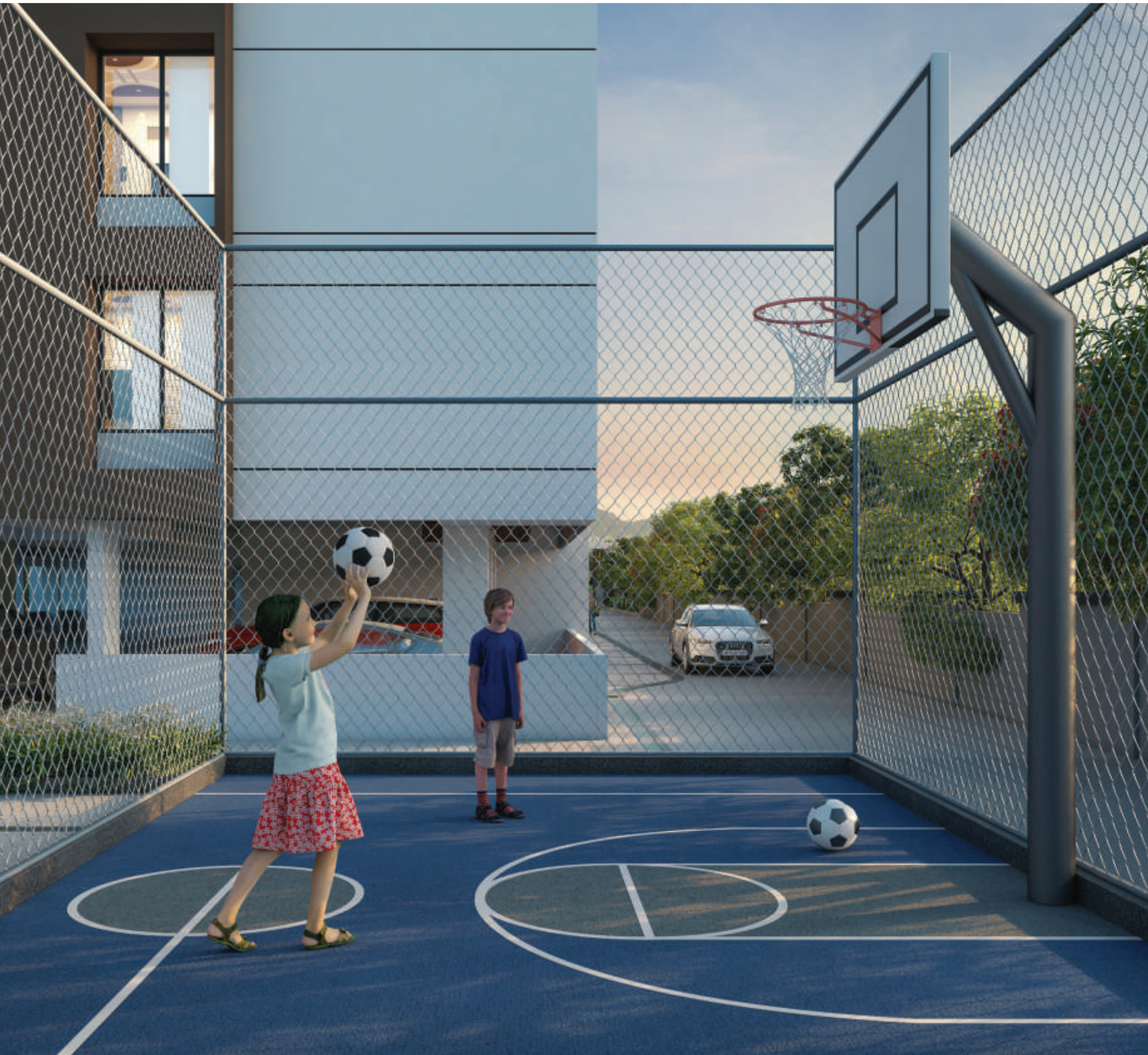
Artistic Impression | Basketball Court