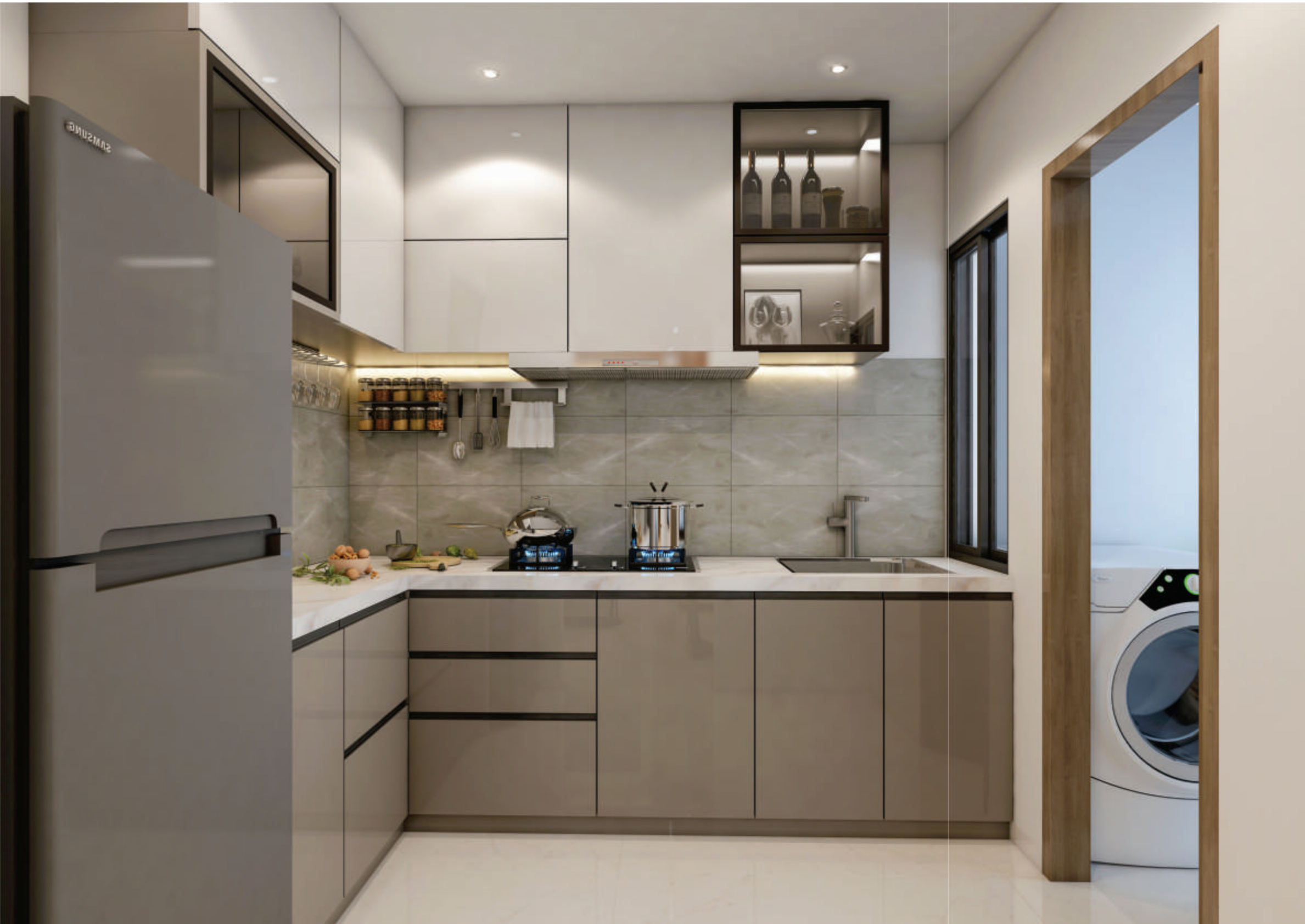
Artistic Impression | Kitchen