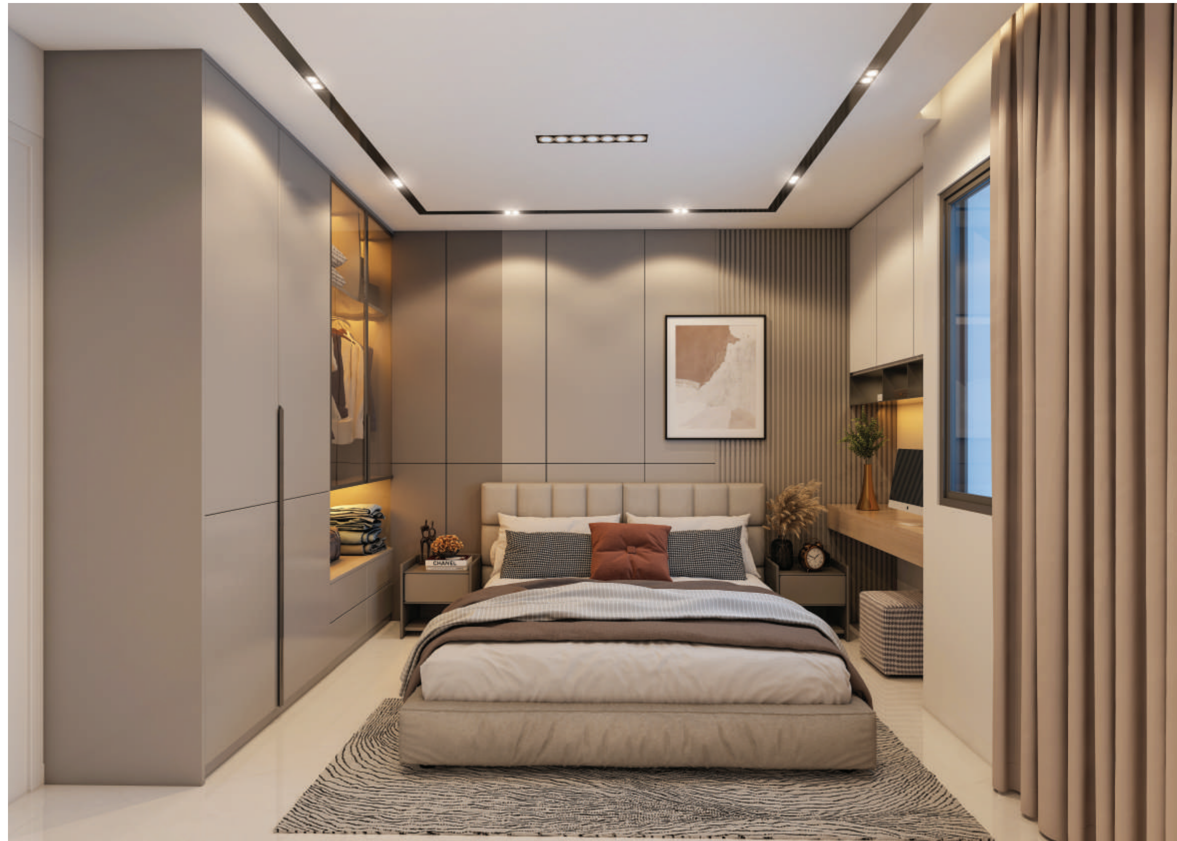
Artistic Impression | Master Bedroom