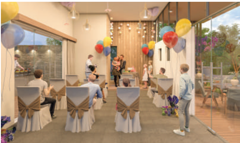
Artistic Impression | Multipurpose Hall