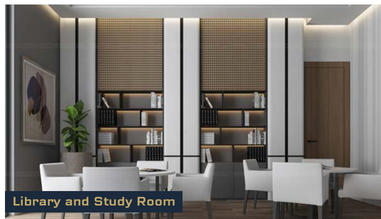
Library and Study Room