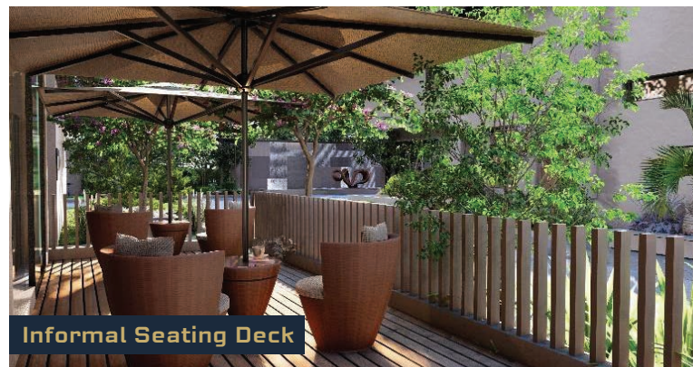
Informal Seating Deck