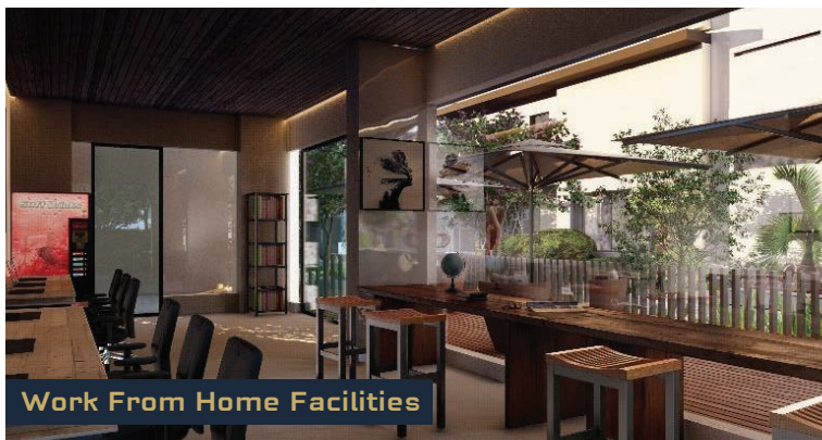
Work From Home Facilities