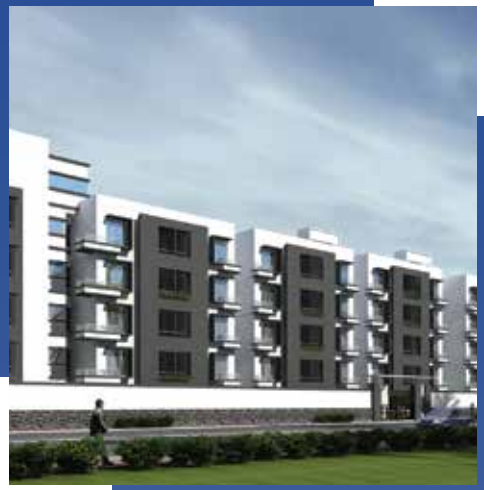
VIBRANT TRISHALA APARTMENTS Smart city road, Biyabani main road, Indore