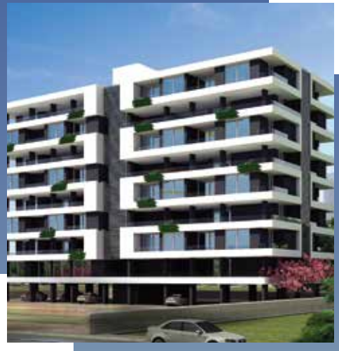
VIBRANT VIDHYA PALACE Manorama Ganj, Indore