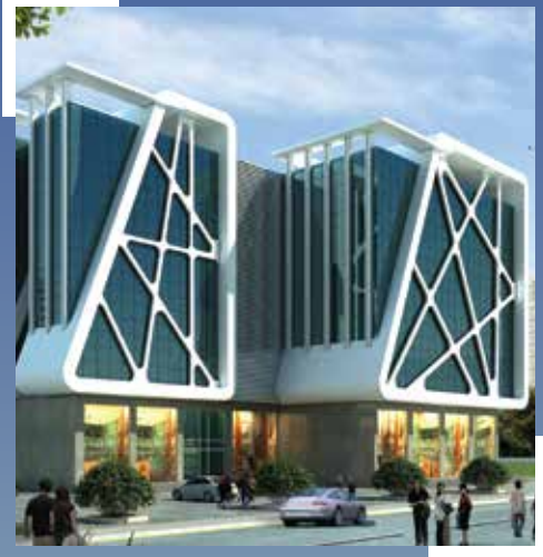
VIBRANT BUSINESS TOWER A.B. Rd, Manorama Ganj, Indore