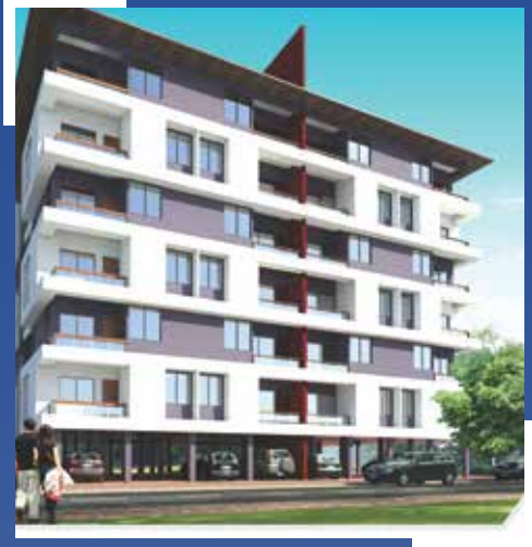
VIBRANT NAVNEET ENCLAVE Silicon Valley, Rau by pass, Indore