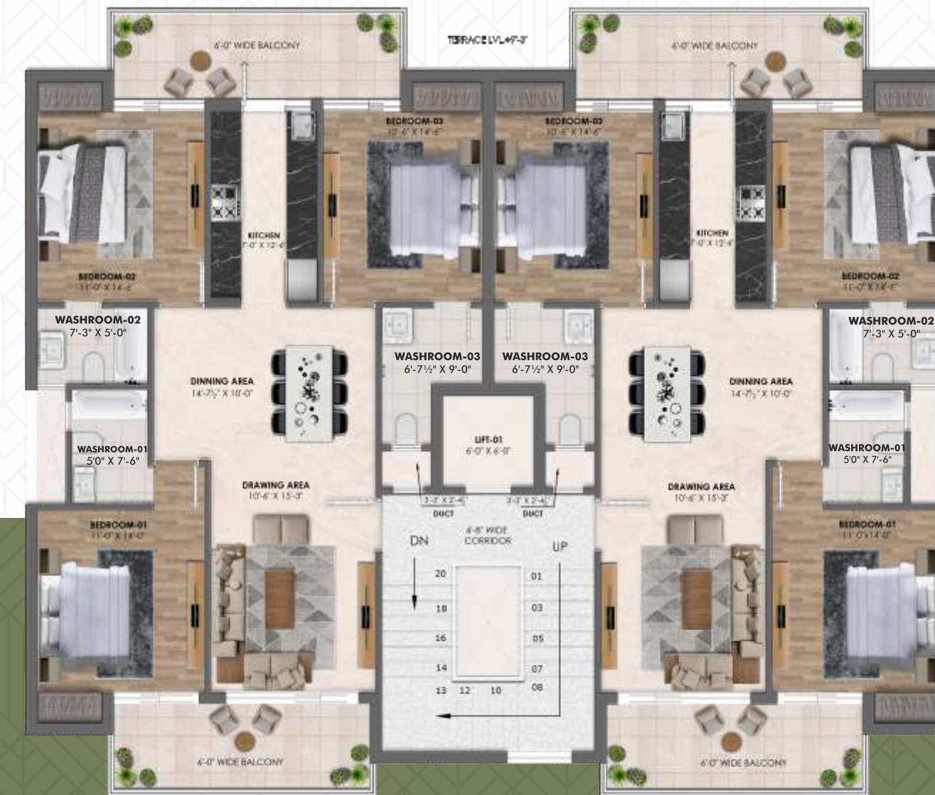
3 BHK Exclusive Floor (225 Sq.yds.)

Indulge in the allure of our meticulously crafted layout plan, where luxury meets nature. Spanning across 6 acres of pristine land, our premium location offers a place surrounded by lush greenery. Welcome to a residence where every corner is designed to evoke a sense of premium living within the embrace of expansive green landscapes.