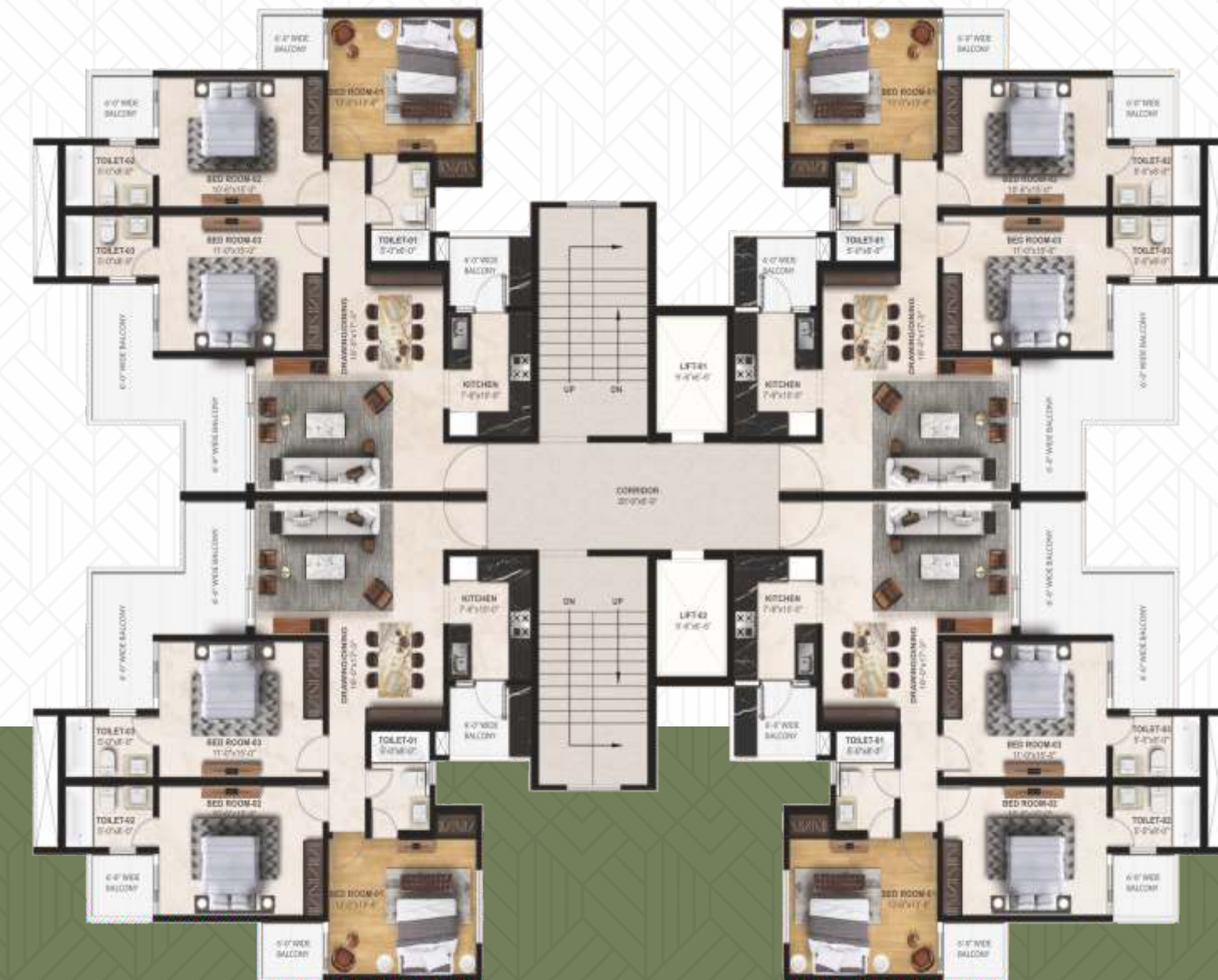
3 BHK (1750 Sq.ft.)