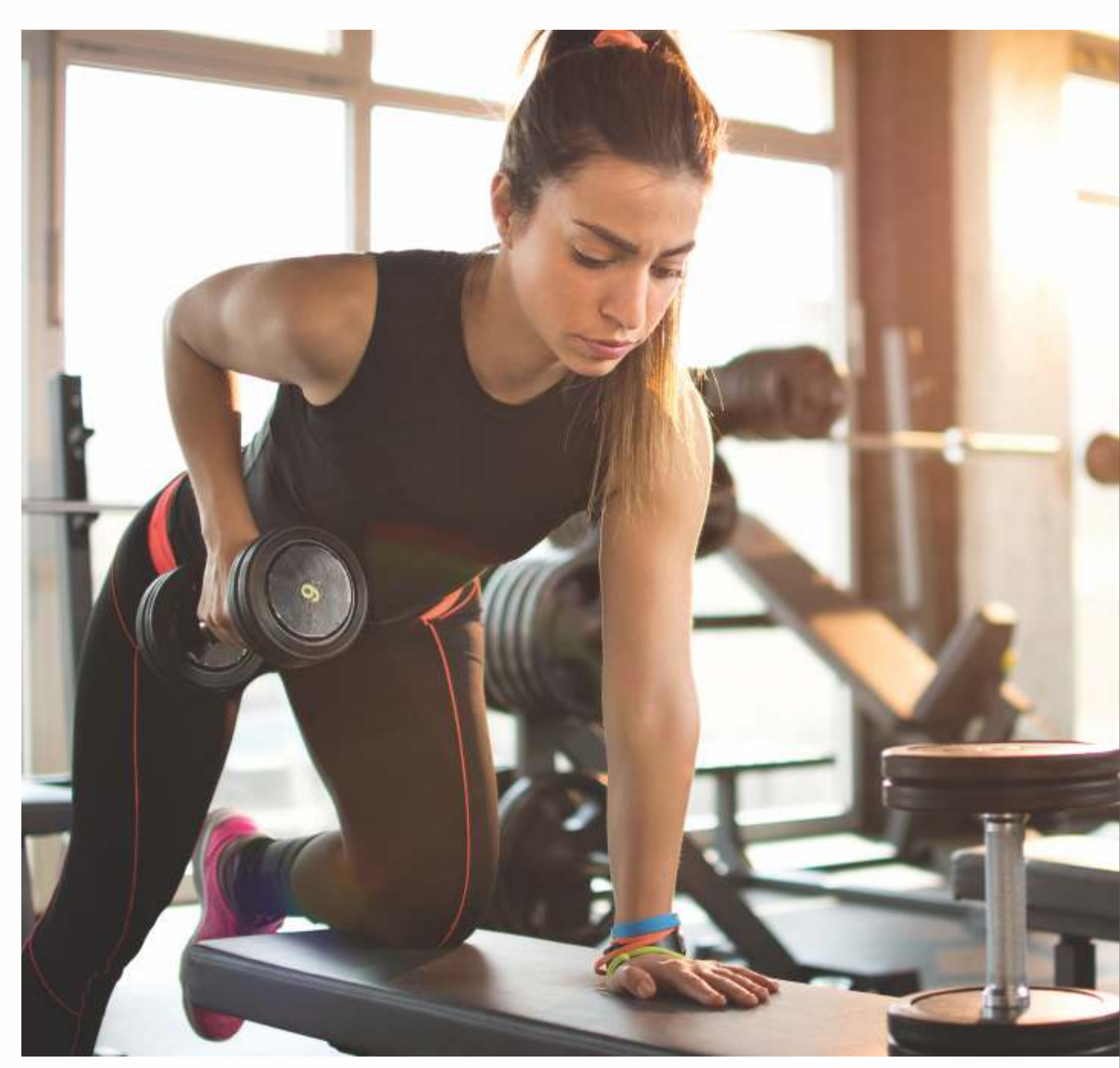
The images are for creative representation purposes.