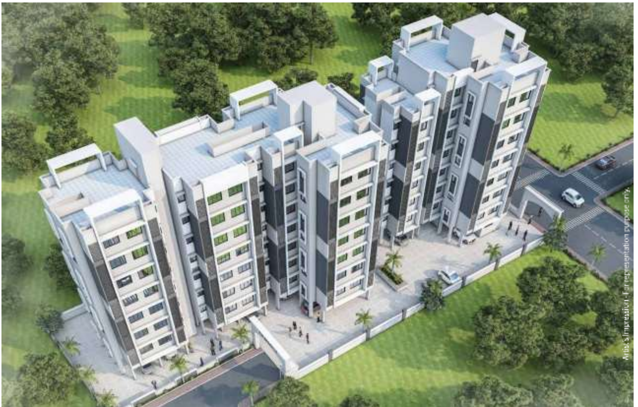
Artist's Impression - For representation purpose only.