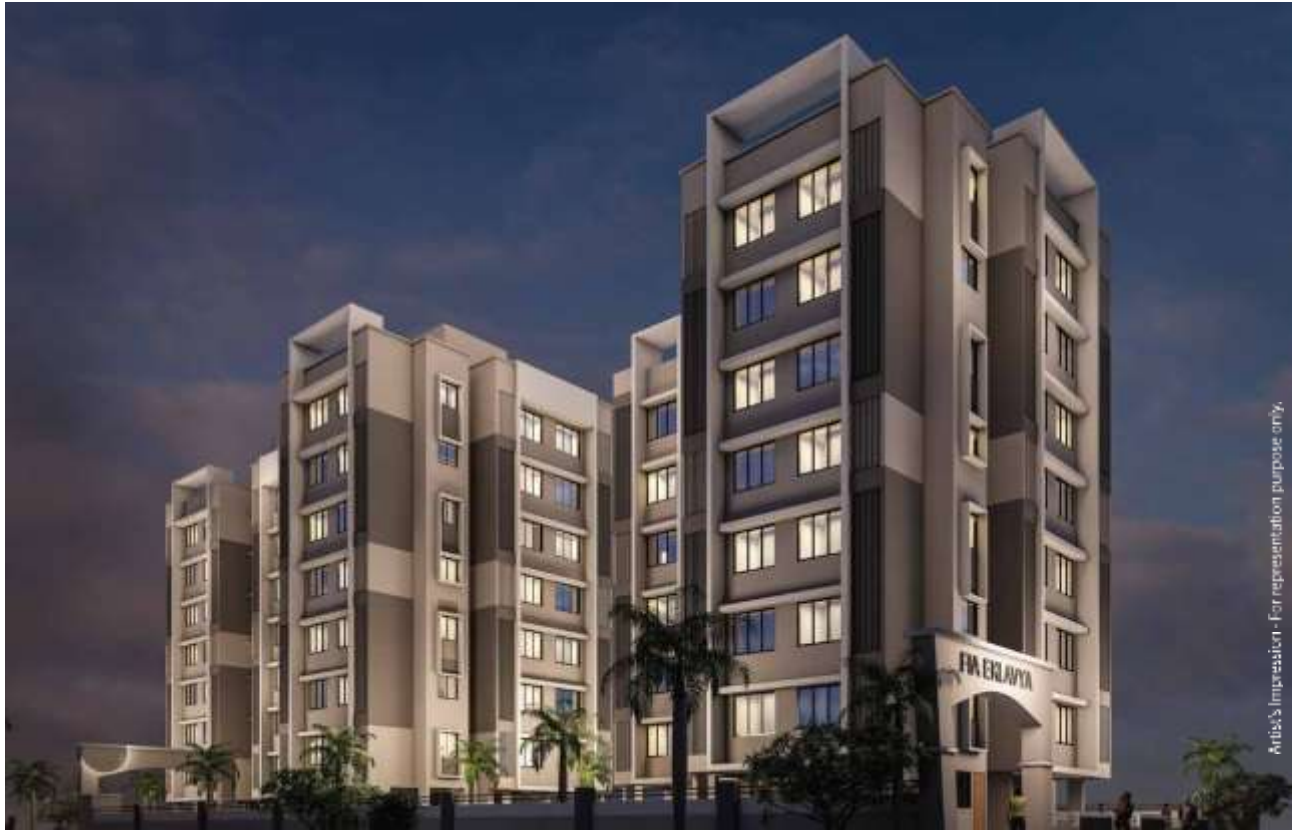
Artist's Impression - For representation purpose only.