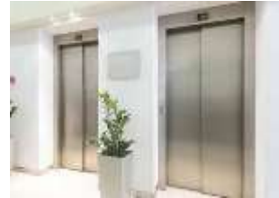
HIGH SPEED LIFT