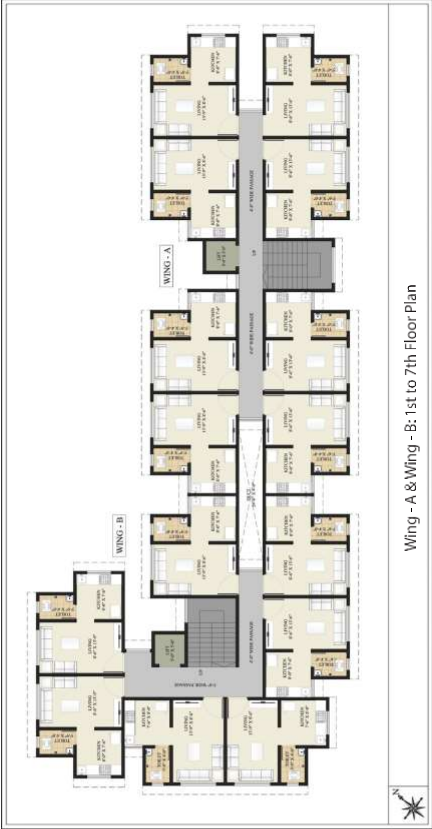
Wing - A & Wing - B: 1st to 7th Floor Plan