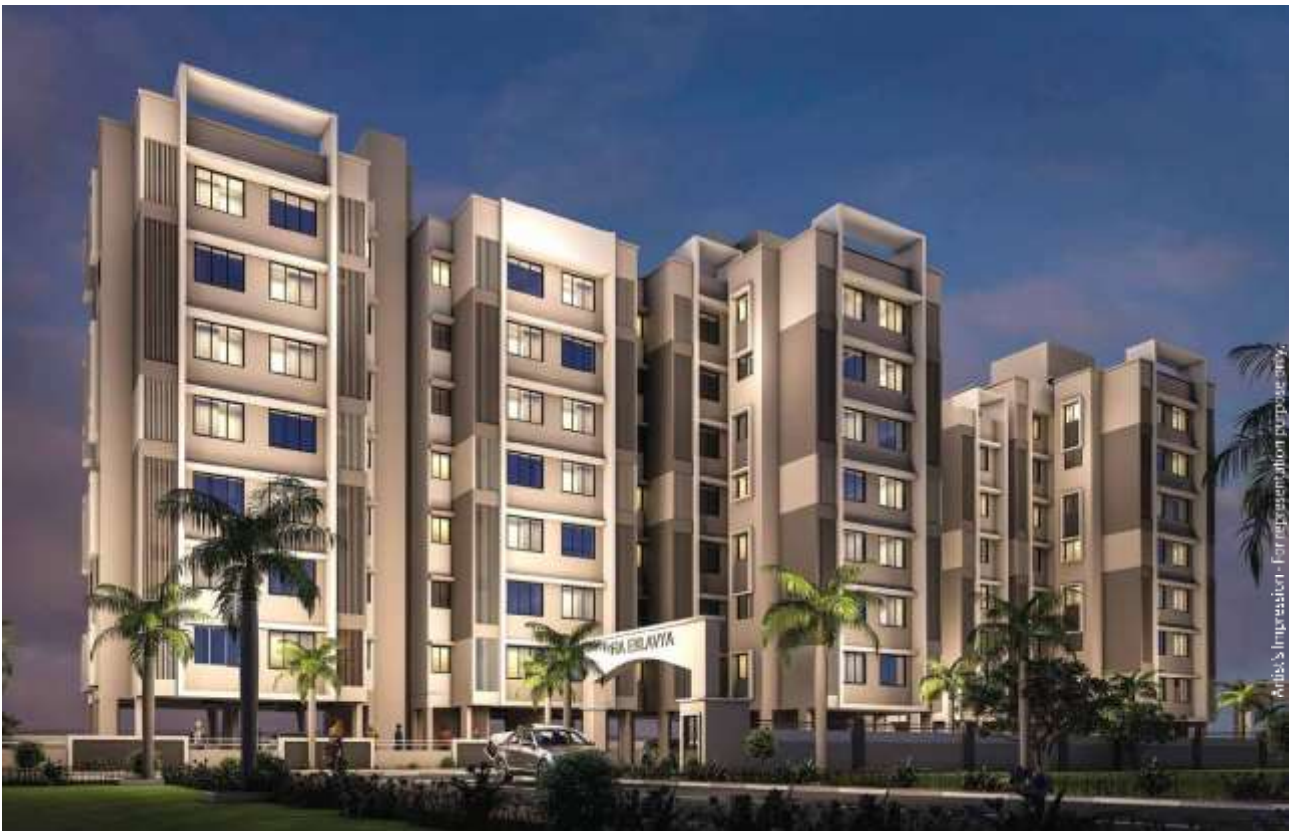
Artist's Impression - For representation purpose only.