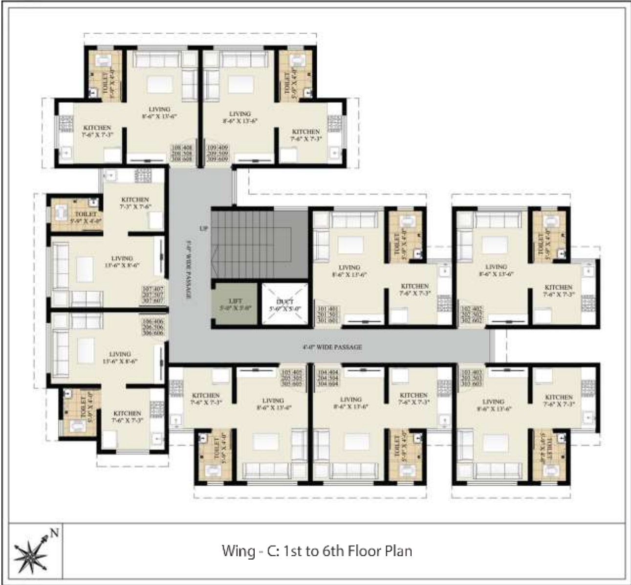
Wing - C: 1st to 6th Floor Plan