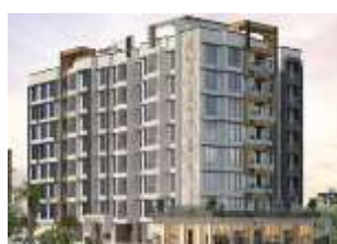
FIA ORION GRANDE