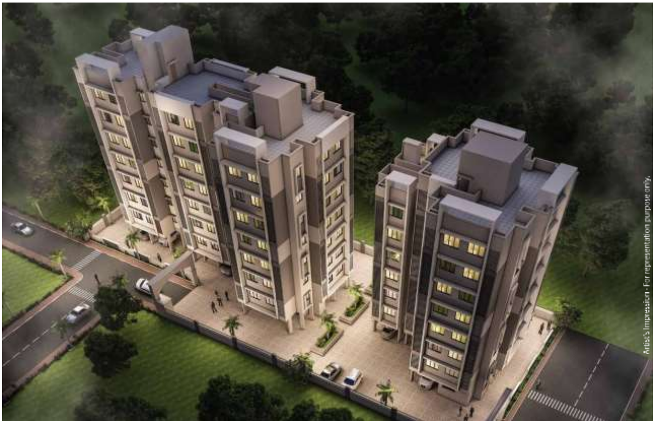
Artist's Impression - For representation purpose only.