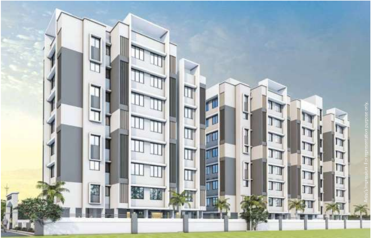
Artist's Impression - For representation purpose only.