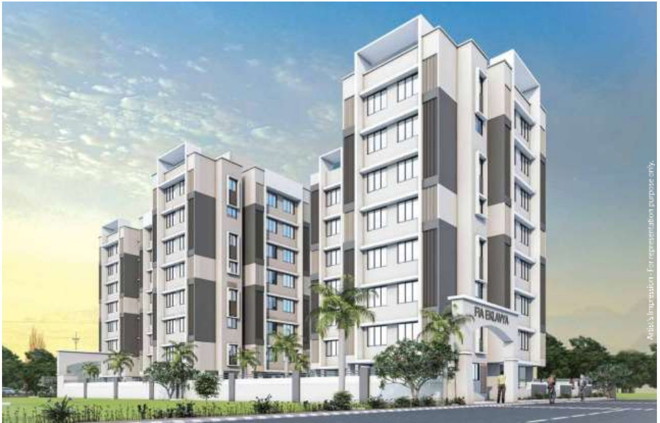
Artist's Impression - For representation purpose only.