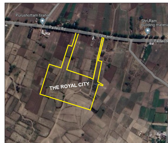
Site Planning & Designed by Animex Homes, Varanasi - # 9115255166