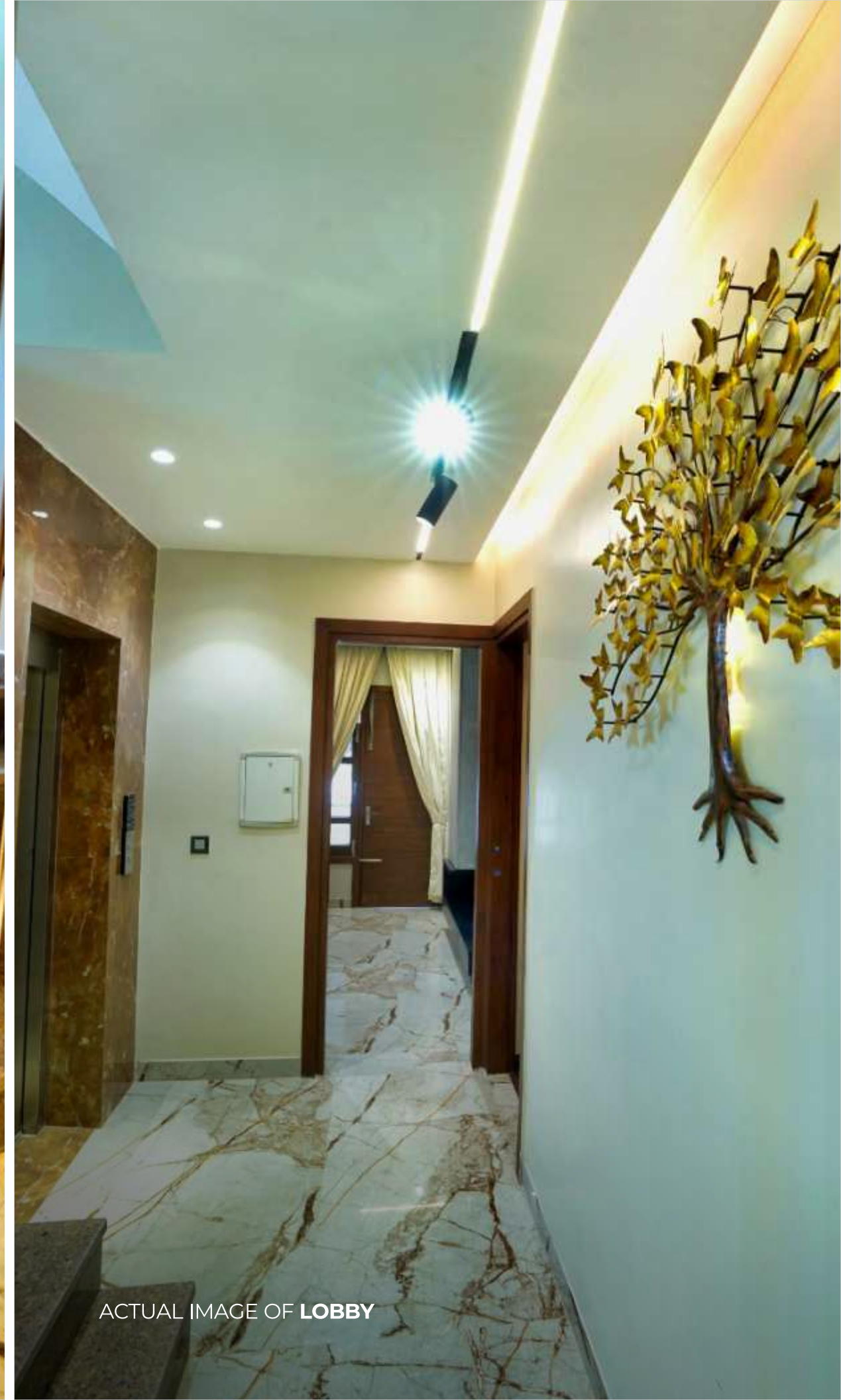
ACTUAL IMAGE OF LOBBY