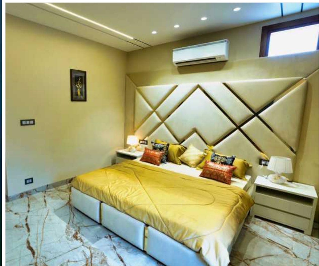
ACTUAL IMAGE OF BEDROOM 4