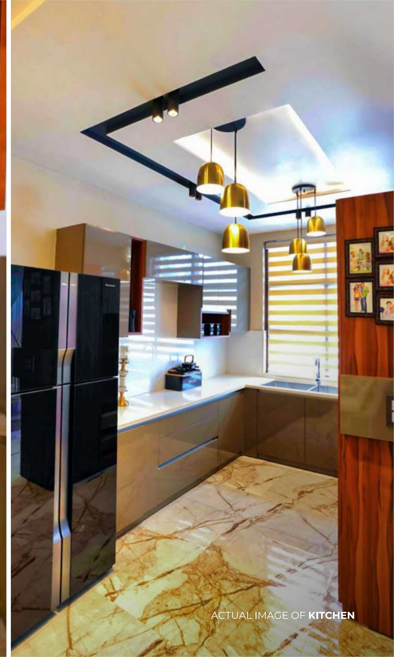
ACTUAL IMAGE OF KITCHEN