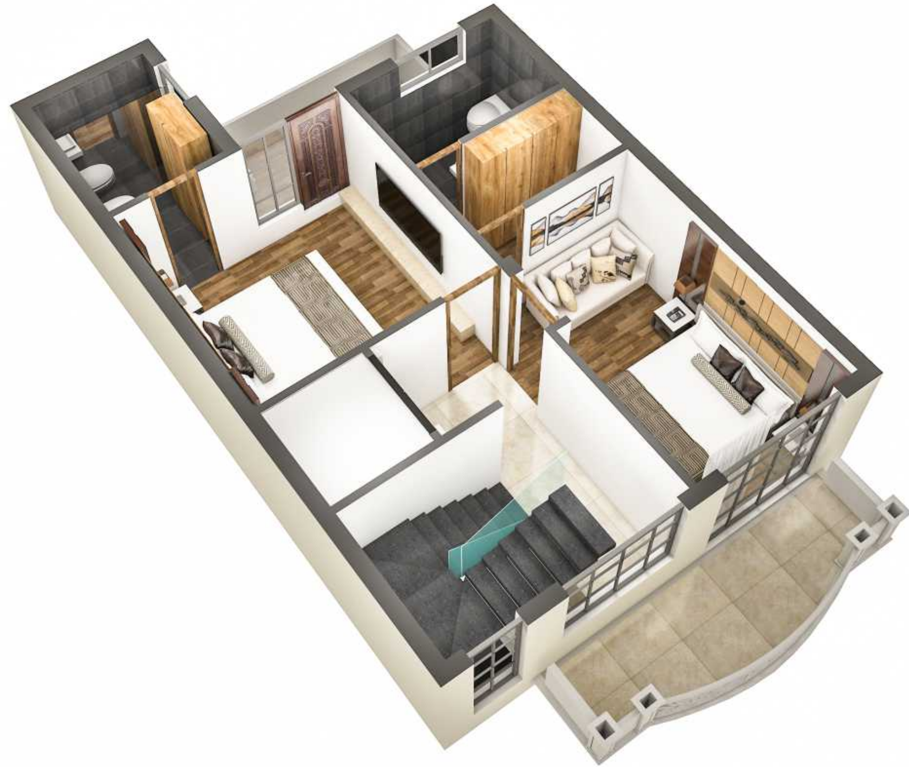
— † † FIRST FLOOR PLAN † † —