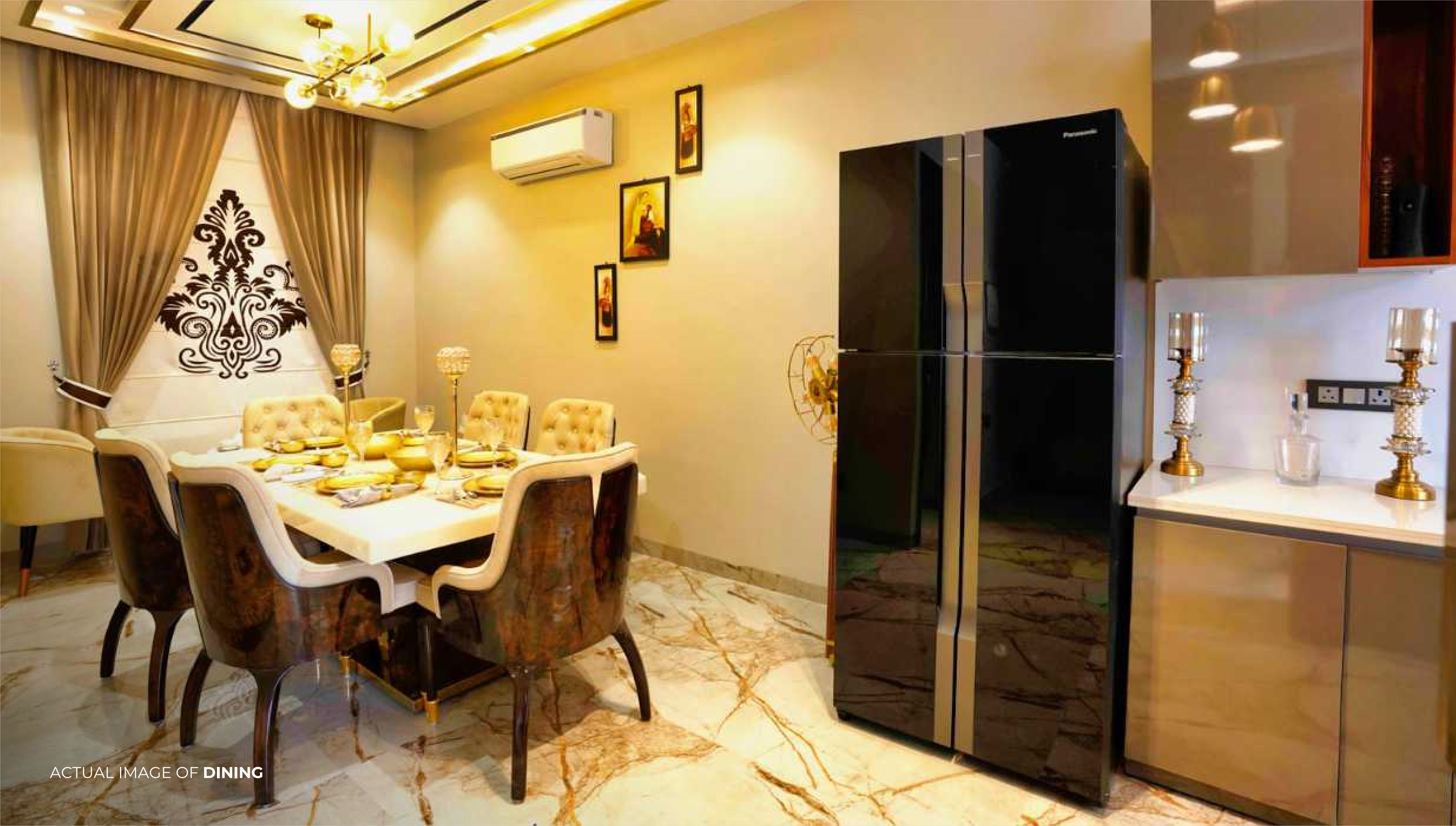
ACTUAL IMAGE OF DINING