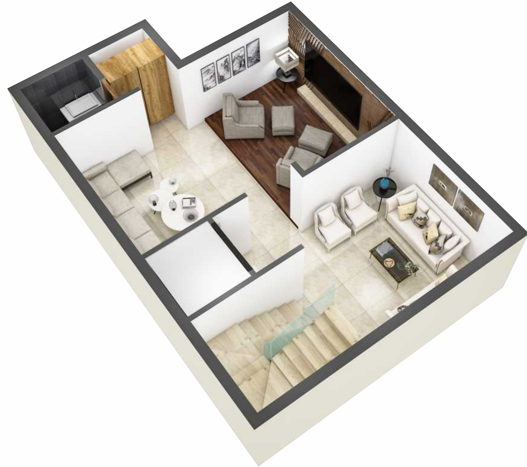
— † † BASEMENT FLOOR PLAN † † —