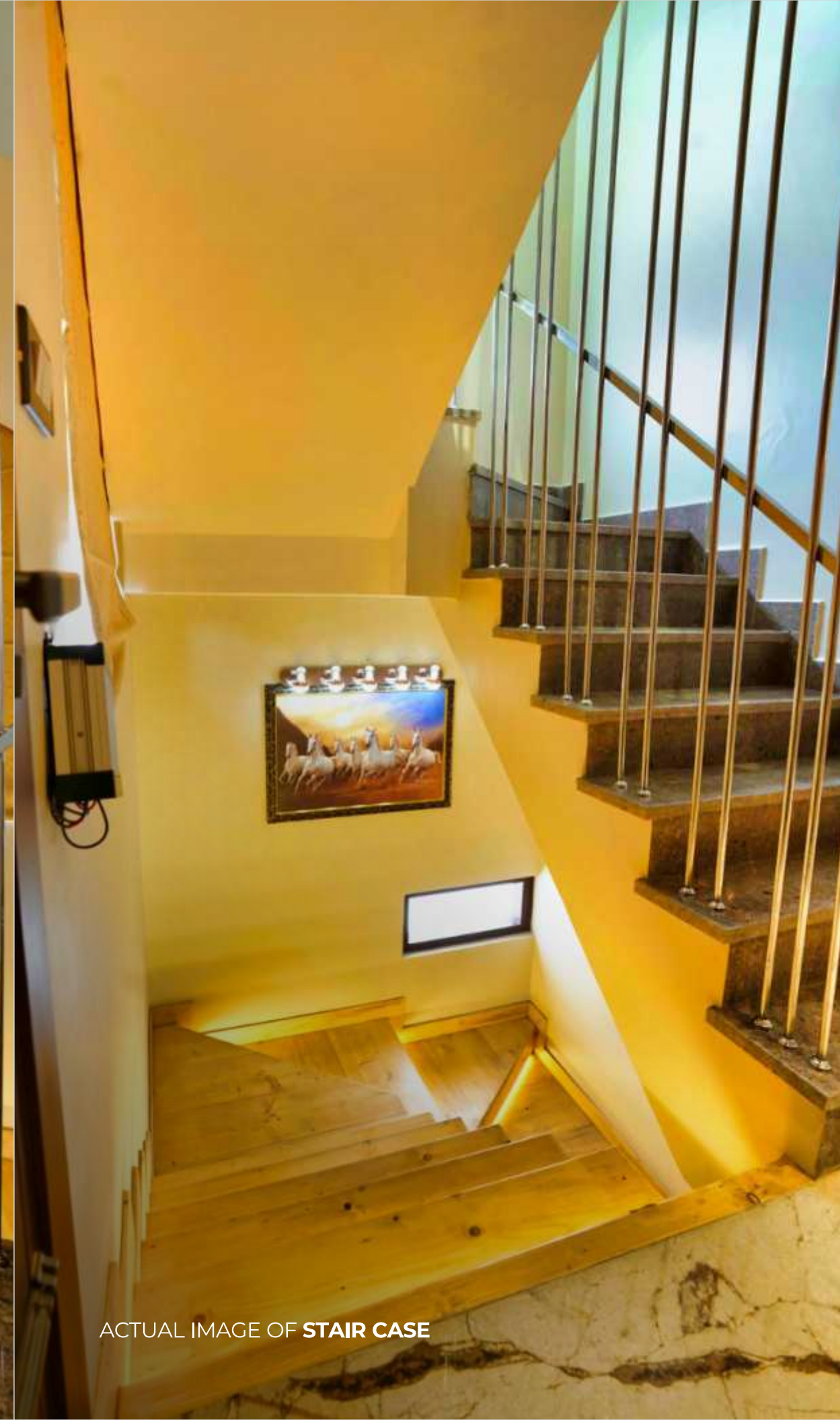
ACTUAL IMAGE OF STAIR CASE