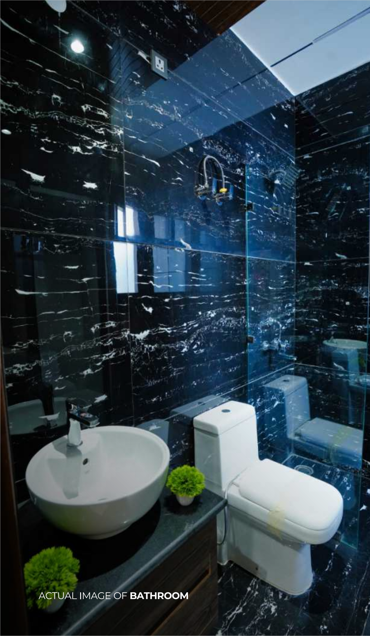
ACTUAL IMAGE OF BATHROOM