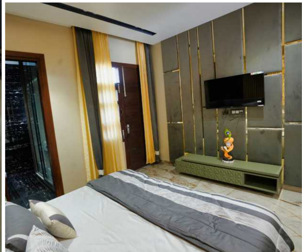
ACTUAL IMAGE OF BEDROOM 1