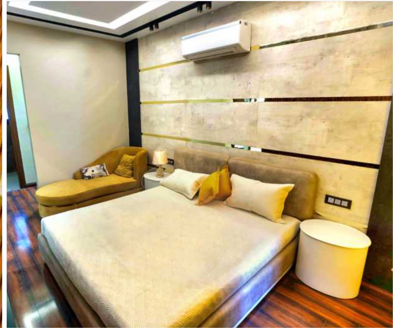
ACTUAL IMAGE OF BEDROOM 2