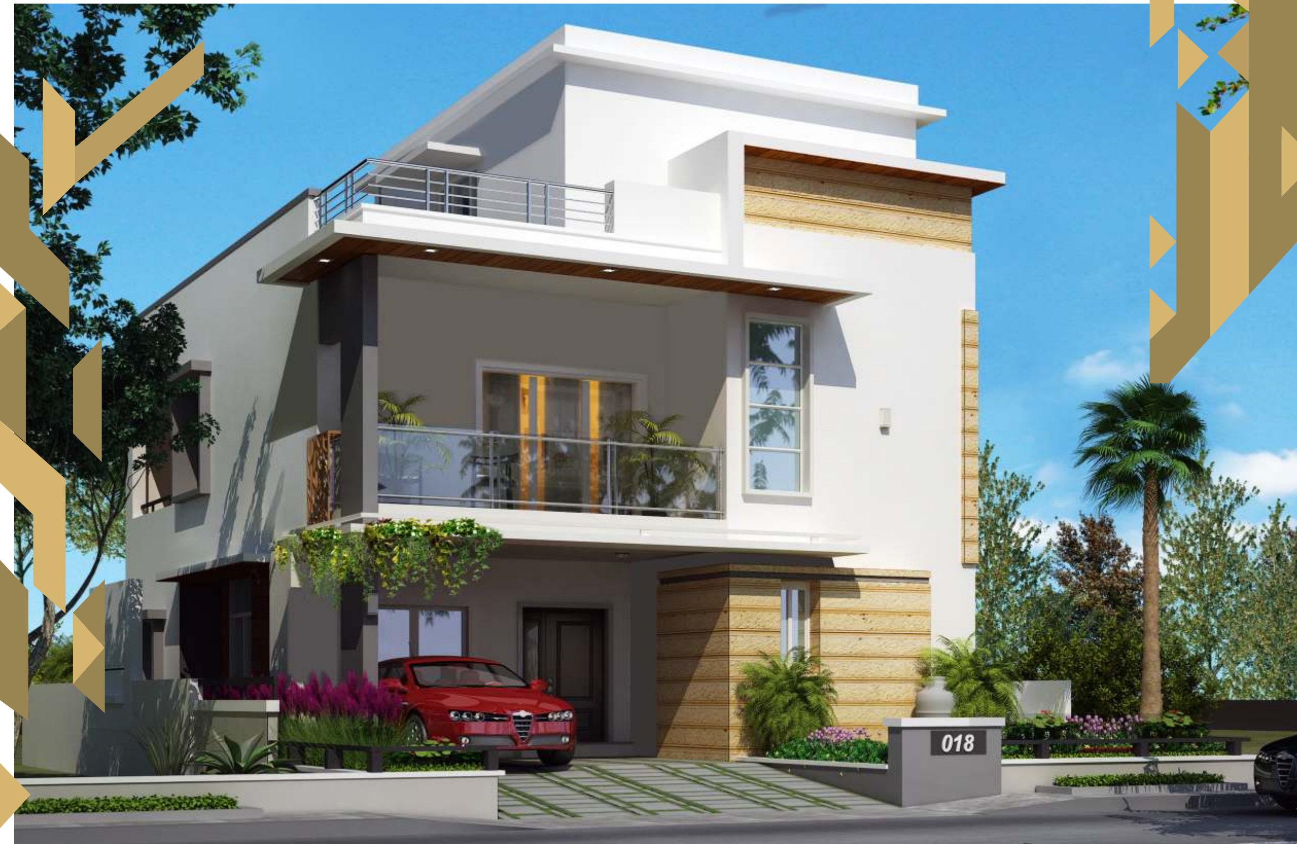
TYPICAL WEST FACING VILLA