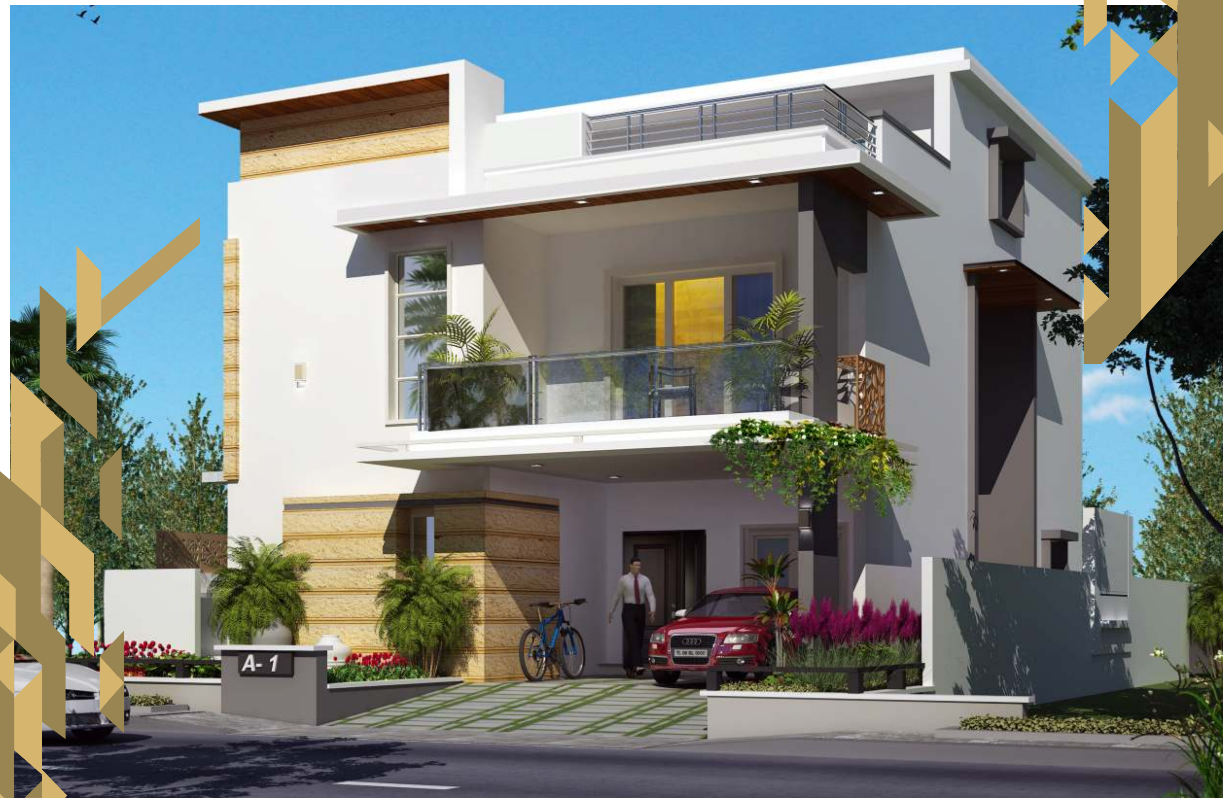
TYPICAL EAST FACING VILLA