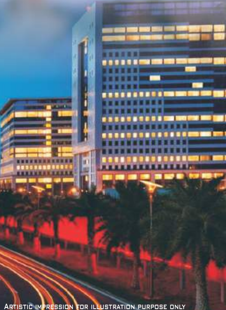
ARTISTIC IMPRESSION FOR ILLUSTRATION PURPOSE ONLY